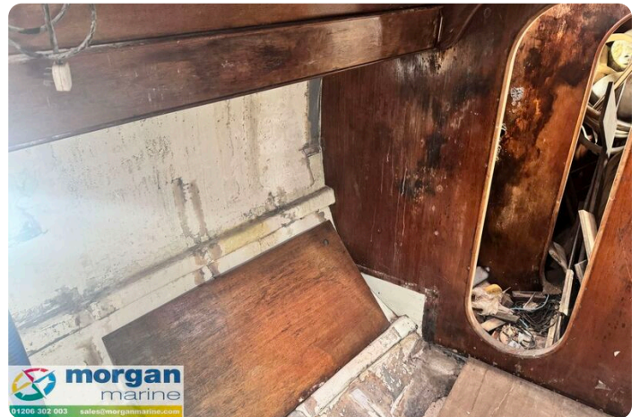
40ft sailing sloop yacht project boat - inside 16