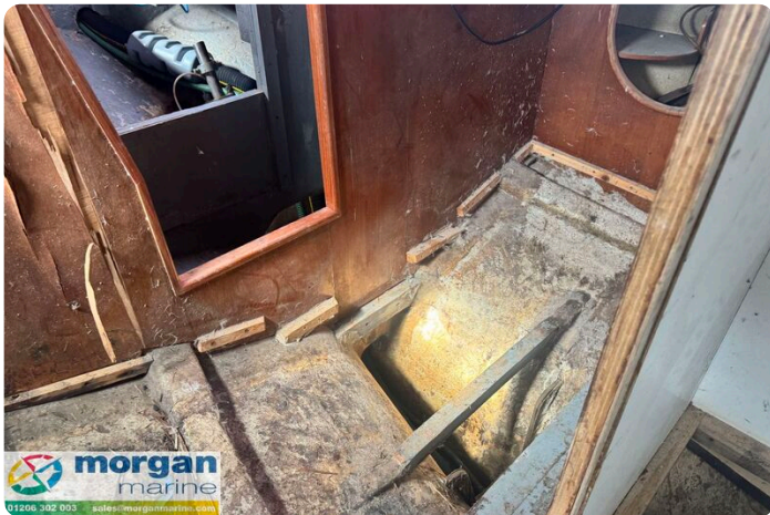
40ft sailing sloop yacht project boat - inside 14