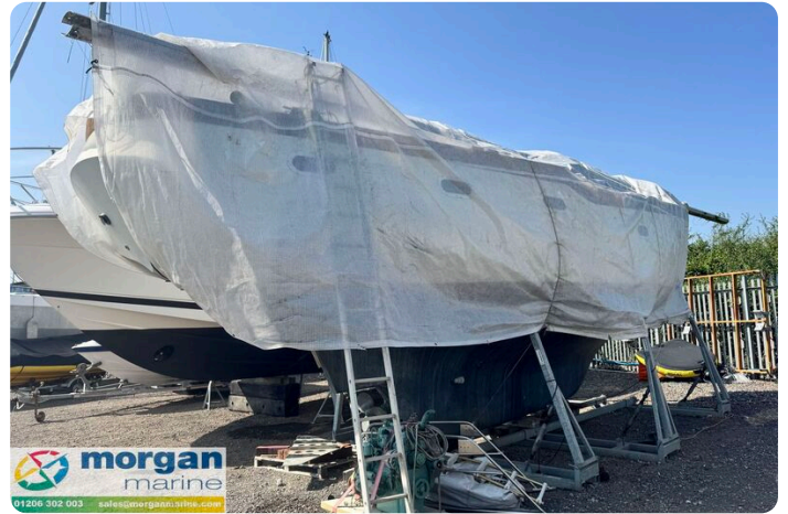
40ft Sailing Sloop yacht Project boat - Stern view