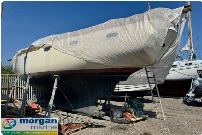
40ft Sailing Sloop yacht Project boat - stern