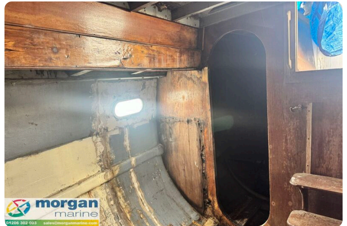
40ft sailing sloop yacht project boat - inside