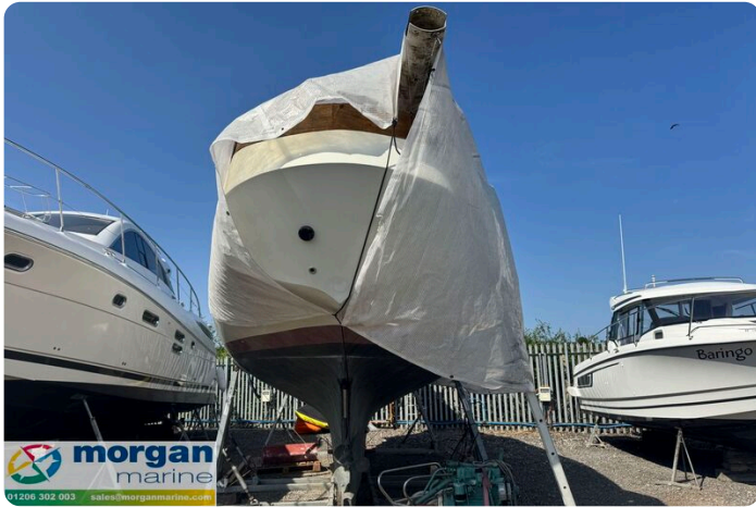
40ft Sailing Sloop yacht Project boat - Stern