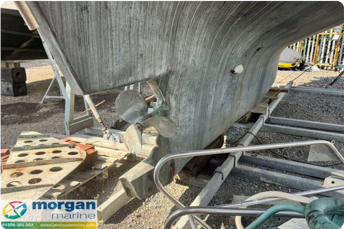
40ft Sailing Sloop yacht Project boat - prop