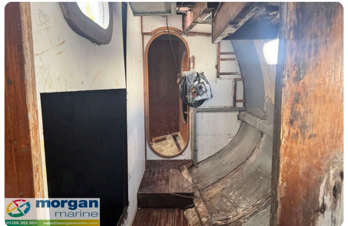
40ft sailing sloop yacht project boat - inside 3