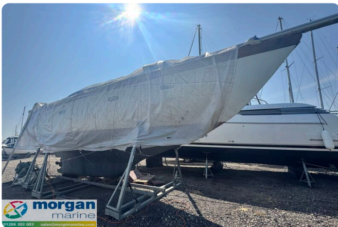
40ft Sailing Sloop yacht Project boat - Stern