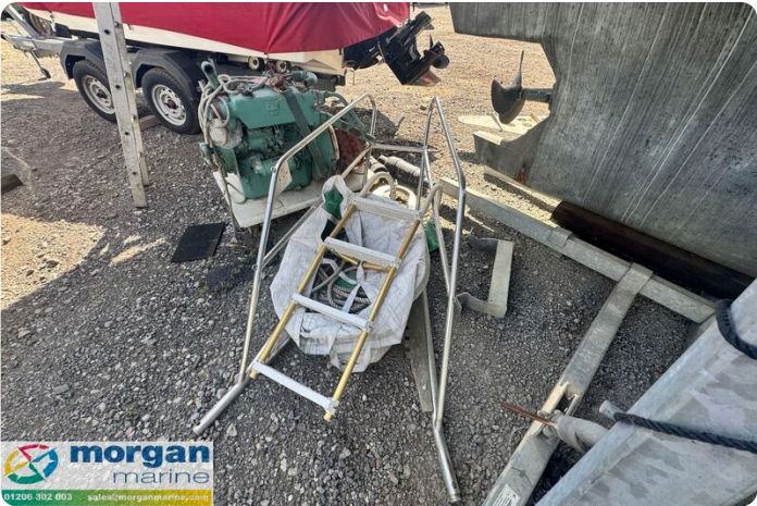
40ft Sailing Sloop yacht Project boat - ladder