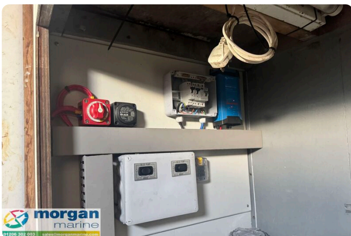
40ft sailing sloop yacht project boat - inside 4