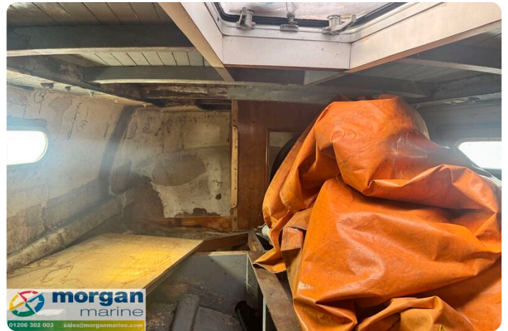
40ft sailing sloop yacht project boat - inside 12