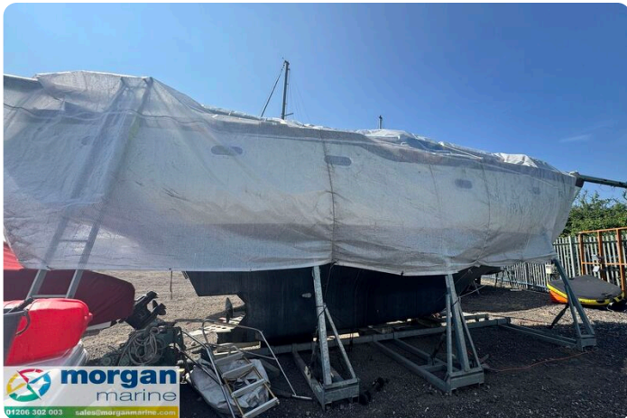
40ft Sailing Sloop yacht Project boat - Back view