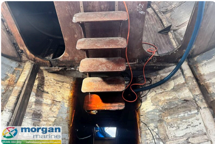
40ft sailing sloop yacht project boat - inside 2