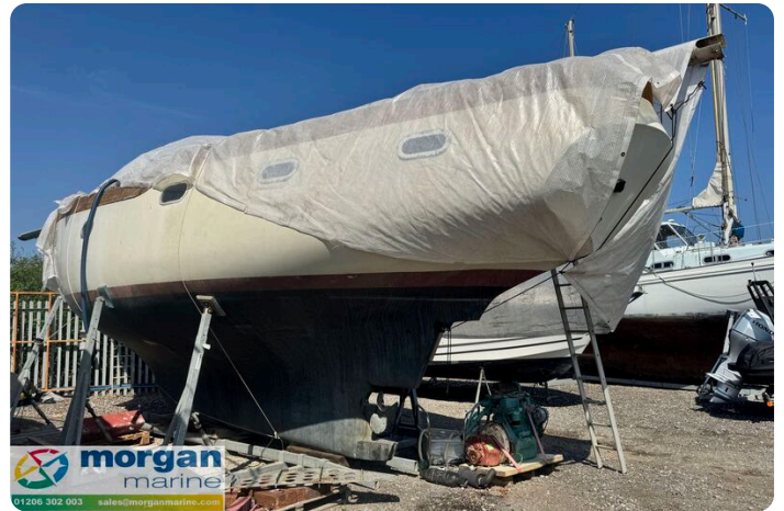
40ft Sailing Sloop yacht Project boat - ladder