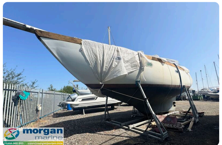
40ft Sailing Sloop yacht Project boat - side