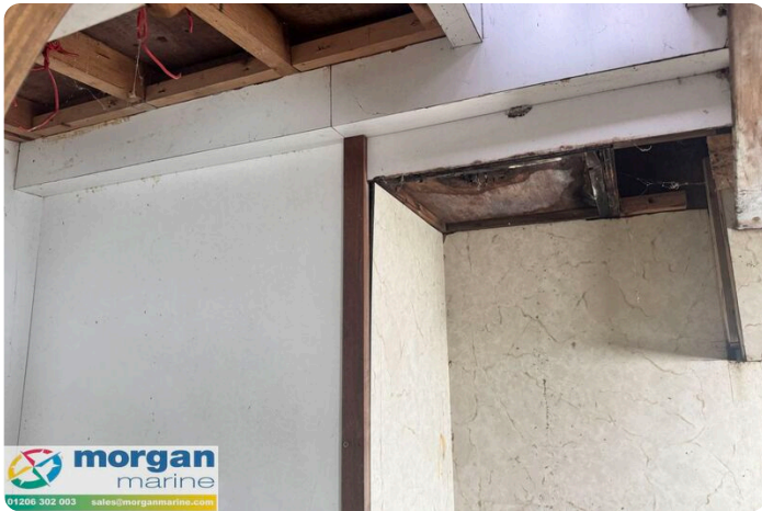
40ft sailing sloop yacht project boat - inside 10