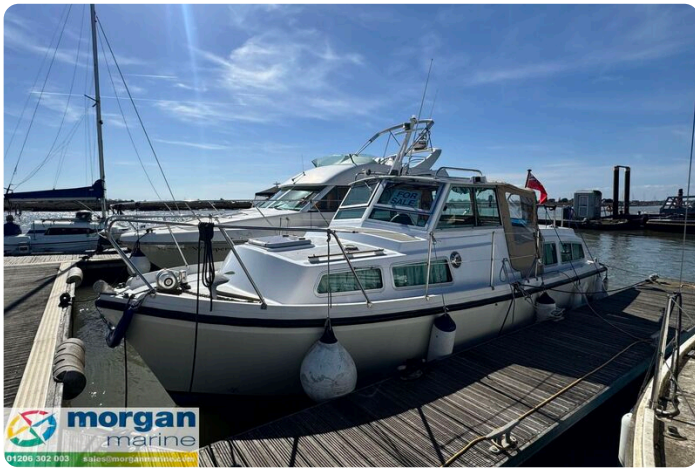
Aquastar 27 - main