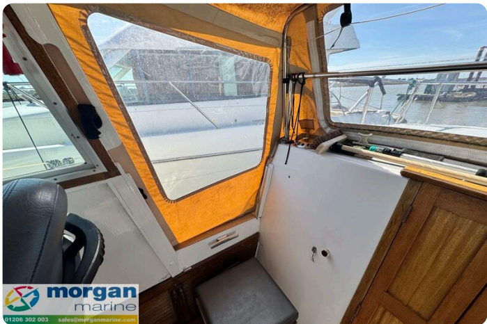
Aquastar 27 - window