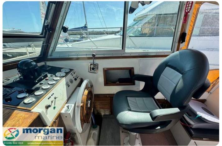
Aquastar 27 - pilot seat