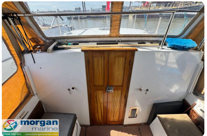
Aquastar 27 - door