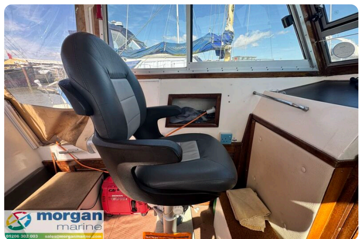
Aquastar 27 - co pilot seat