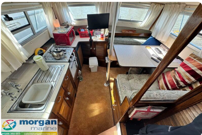
Aquastar 27 -galley