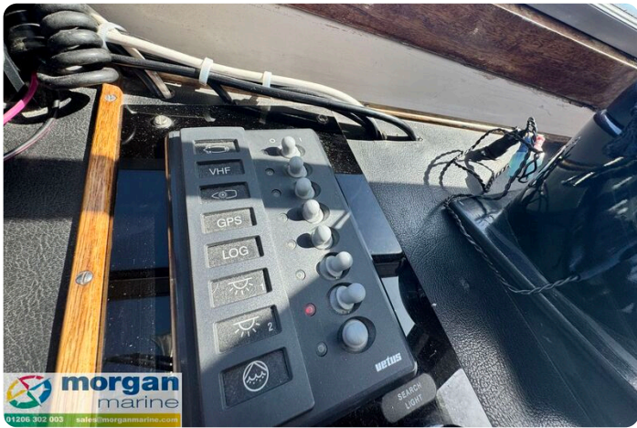
Aquastar 27 - switch panel