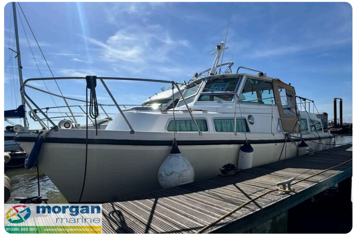
Aquastar 27 - cleats