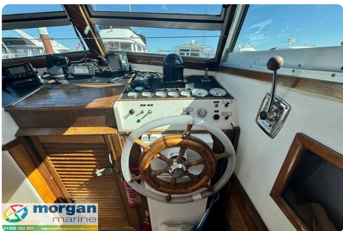
Aquastar 27 - dash