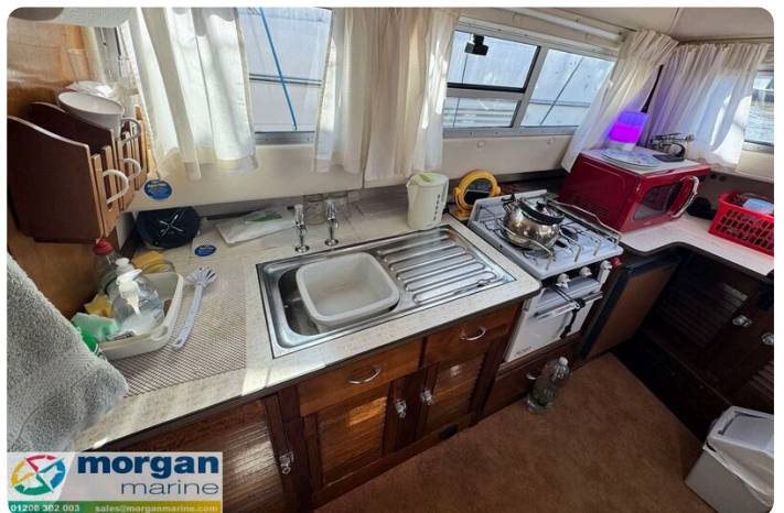
Aquastar 27 - sink