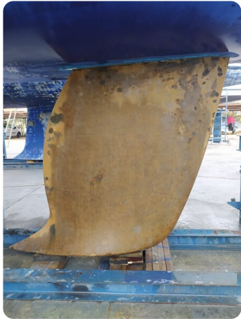
Immagine WhatsApp 2023-03-08 ore 19.00.17_f42b73bc