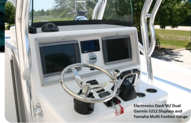
Electronics Dash w/ Dual Garmin 5212 Displays and Yamaha Multi Function Gauge