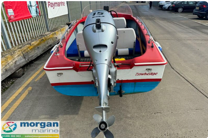
Classic mid-1970s river launch-prop