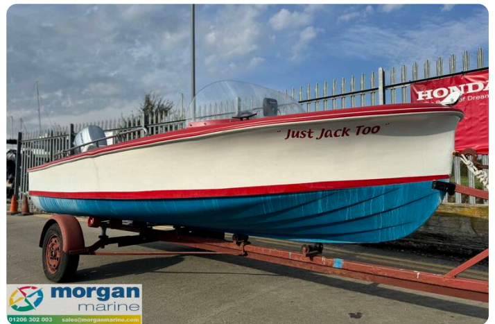
Classic mid-1970s river launch-main