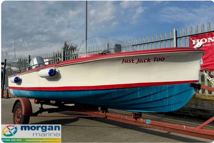
Classic mid-1970s river launch-fenders