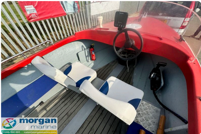
Classic mid-1970s river launch-engine-dash