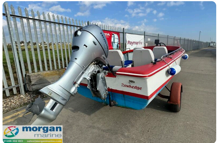
Classic mid-1970s river launch-back-of-engine