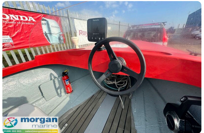
Classic mid-1970s river launch-wheel