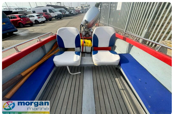
Classic mid-1970s river launch-cushioned-seating