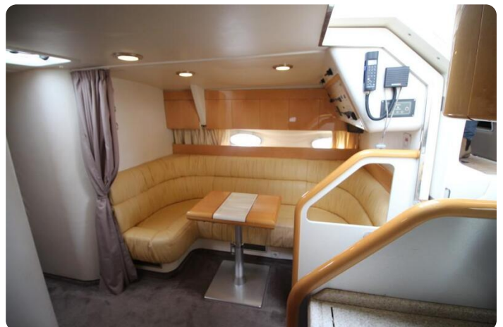
Cranchi 41 Mediterranee