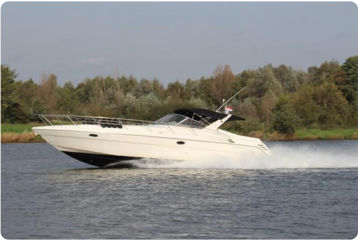
Cranchi 41 Mediterranee