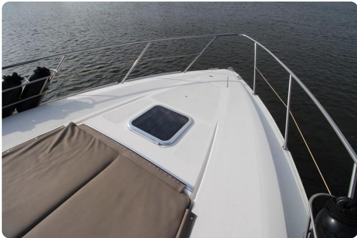
Cranchi 41 Mediterranee