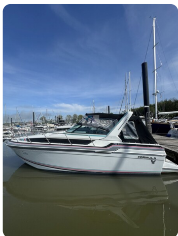
Formula BALU 74