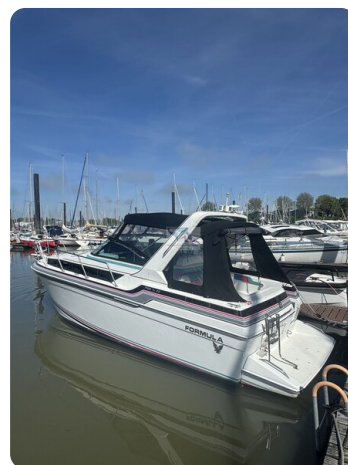
Formula BALU 33