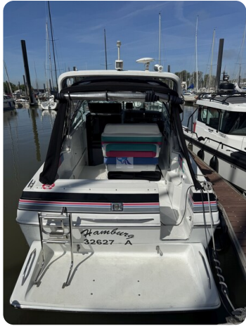
Formula BALU 36