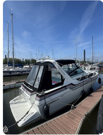
Formula BALU 1