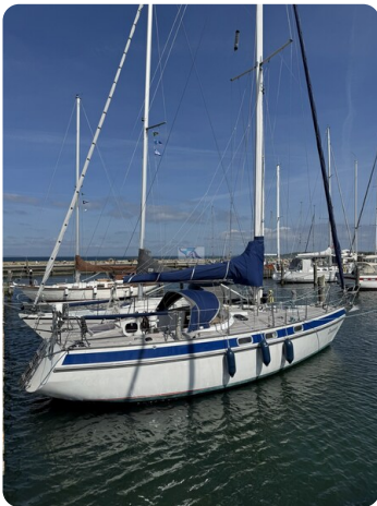
Phantom 35 TOWANDA 105