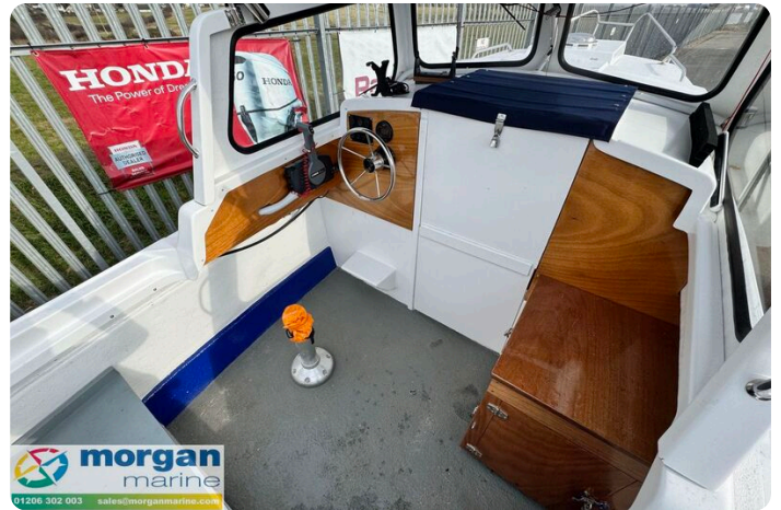
Hardy PH 17 -cockpit