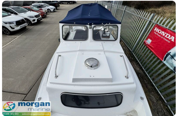
Hardy PH 17 - hatch