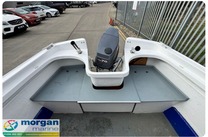
Hardy PH 17 - bench