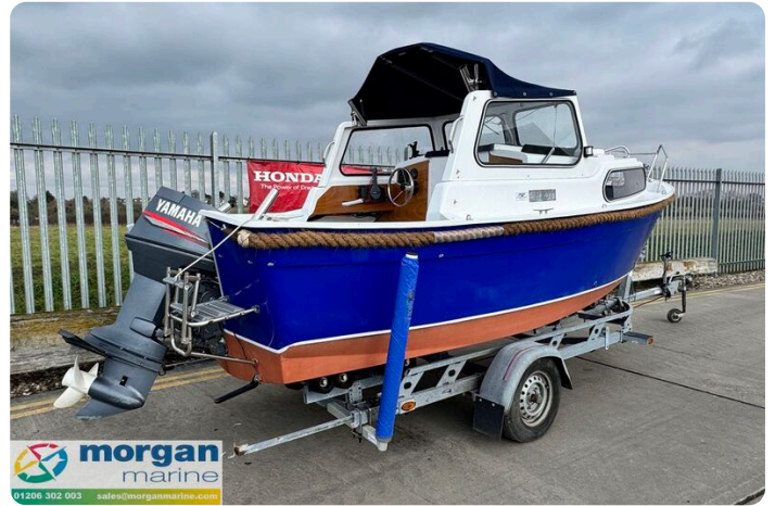
Hardy PH 17 - back