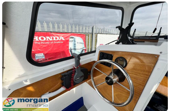
Hardy PH 17 - wheel