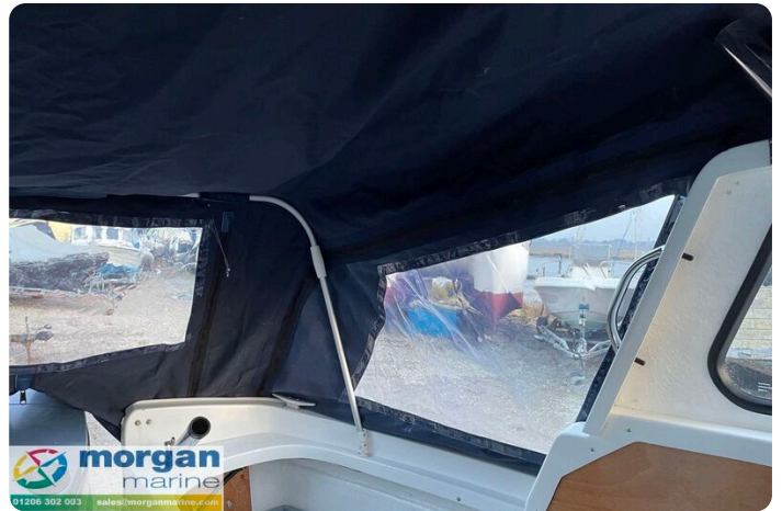
Hardy PH 17 - window