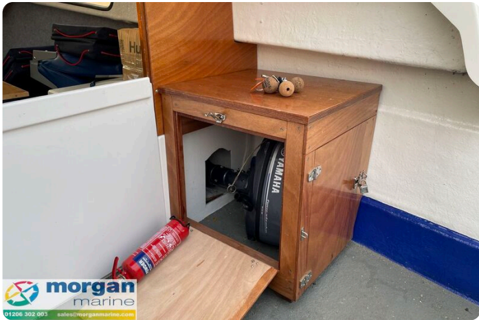
Hardy PH 17 - aux engine