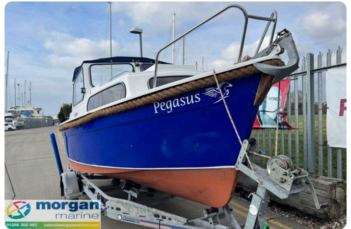
Hardy PH 17 - bow