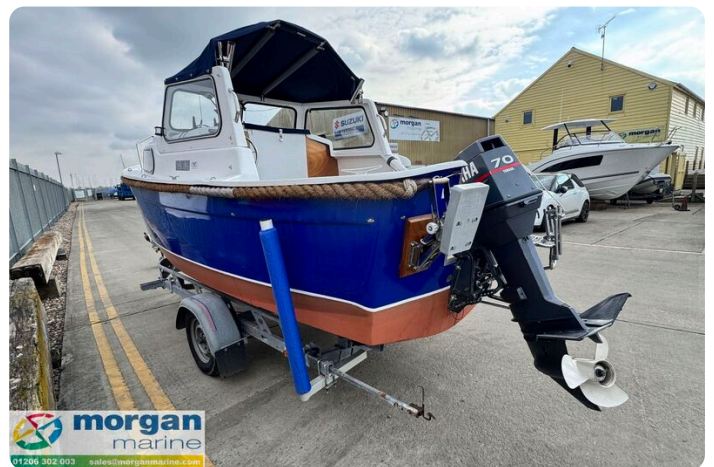
Hardy PH 17 - engine