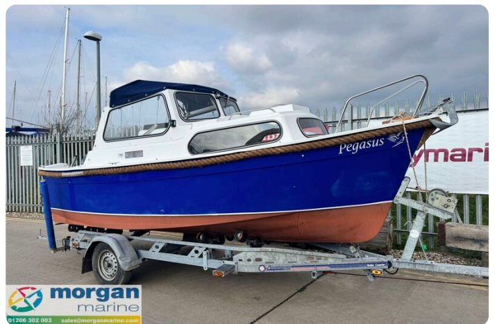
Hardy PH 17 - side