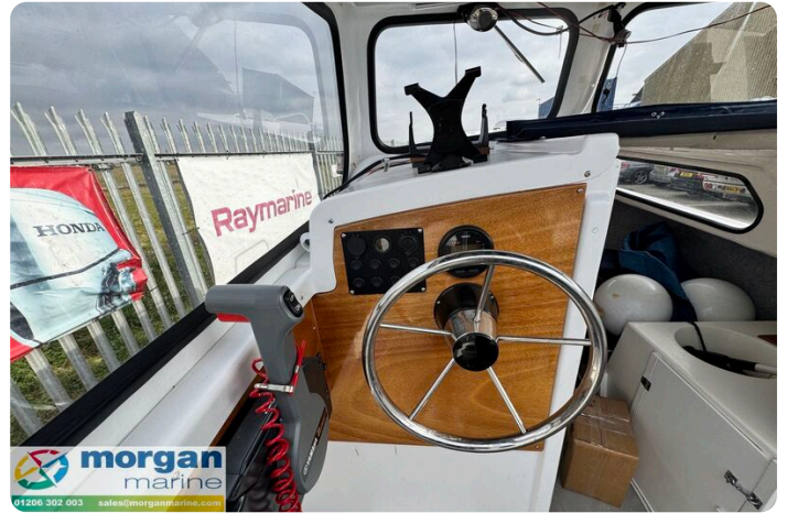
Hardy PH 17 - wheel