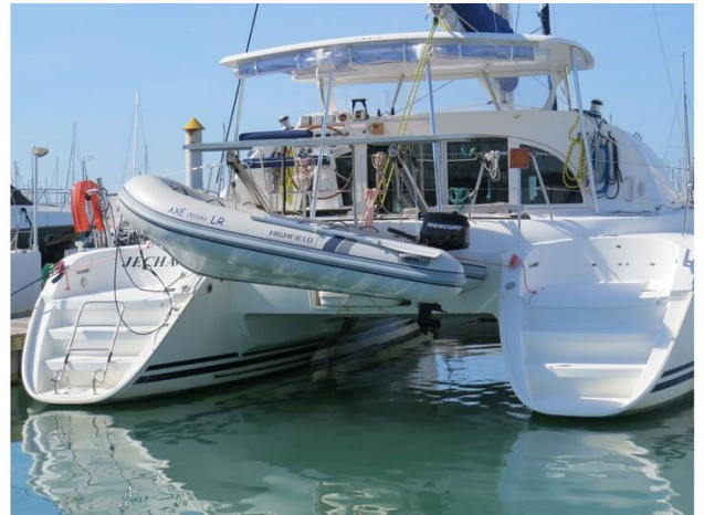
Highfield CL 310 - lifted into water