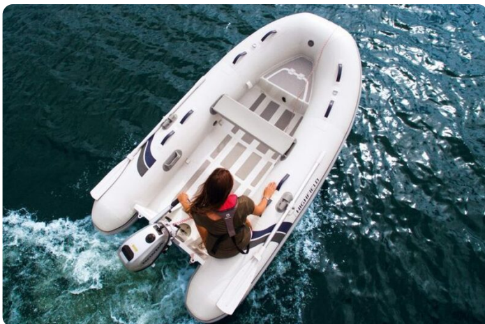
Highfield CL 310 aluminium RIB