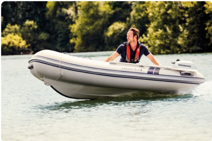
Highfield CL 310 - on the water