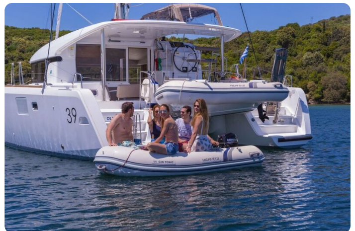
Highfield CL 310 aluminium RIB - tender to larger boat