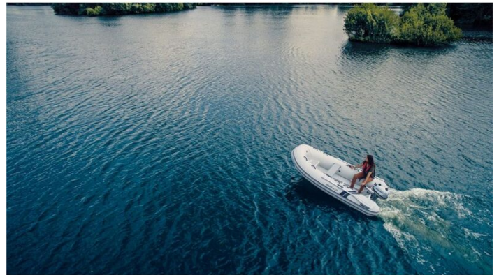
Highfield CL 310 - overhead view