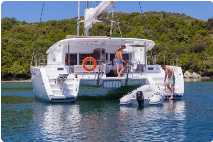
Highfield CL 310 - lifted off larger boat