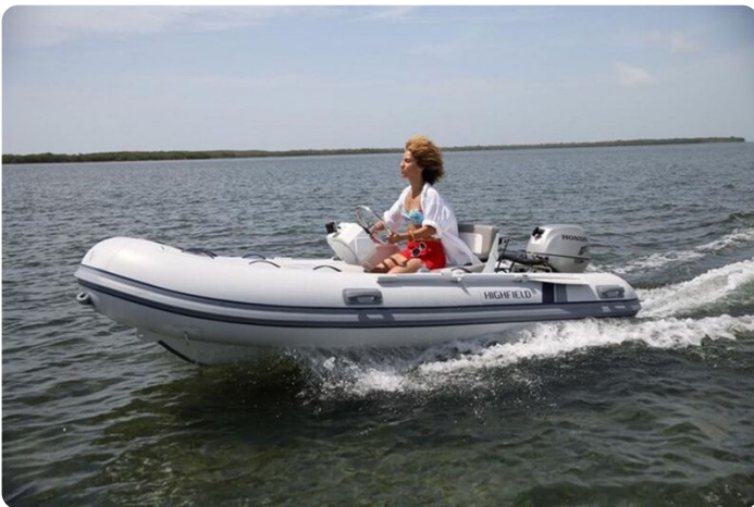
Highfield CL 260 aluminium RIB - on the water