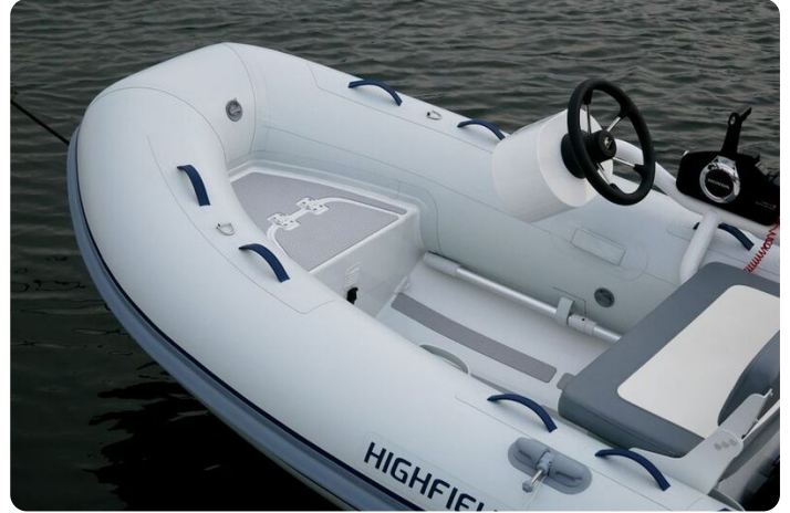
Highfield CL 340 aluminium RIB - bow