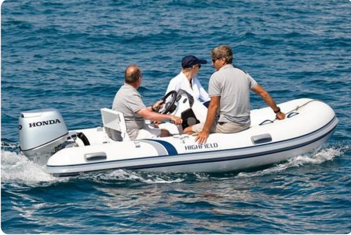
Highfield CL 260 aluminium RIB