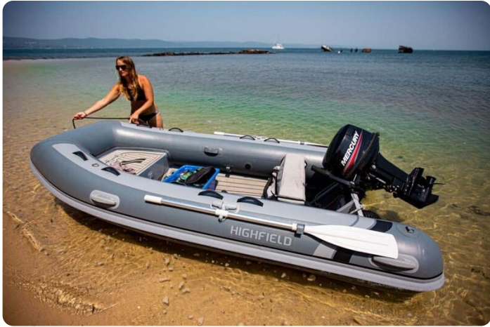
Highfield CL 360 aluminium RIB - on the beach