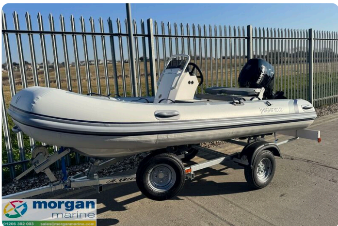
Highfield Classic 380 GT console - side