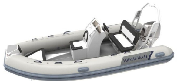
Highfield Classic 420 aluminium RIB - overview from port side