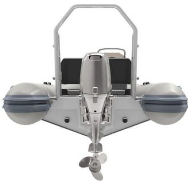
Highfield Classic 420 aluminium RIB - transom