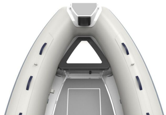
Highfield Classic 420 aluminium RIB - bow