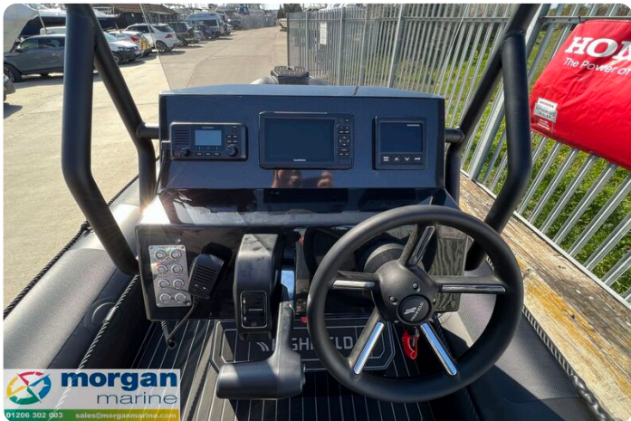
Highfield Patrol 500 aluminium RIB - steering wheel and dash