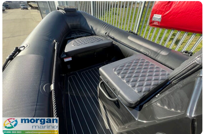
Highfield Patrol 500 aluminium RIB - forward console seat