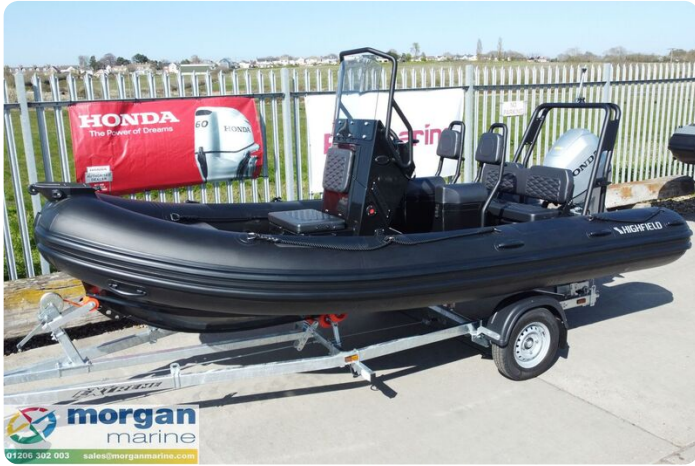
Highfield Patrol 500 aluminium RIB