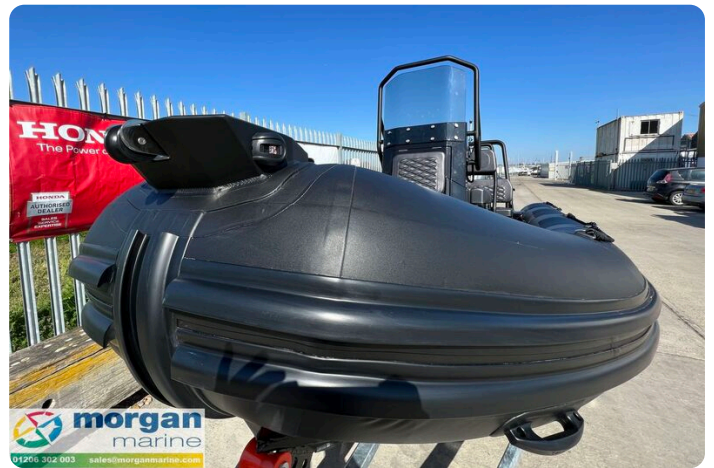
Highfield Patrol 500 aluminium RIB - bow and tubes