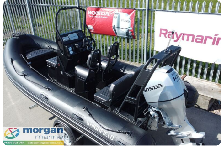
Highfield Patrol 500 aluminium RIB - overhead view of console