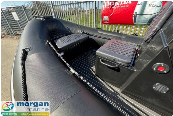
Highfield Patrol 500 aluminium RIB - bow seating