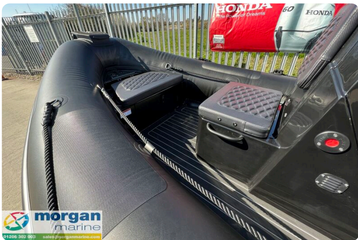
Highfield Patrol 500 aluminium RIB - bow seating