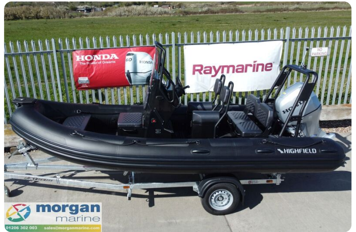
Highfield Patrol 500 aluminium RIB - port side