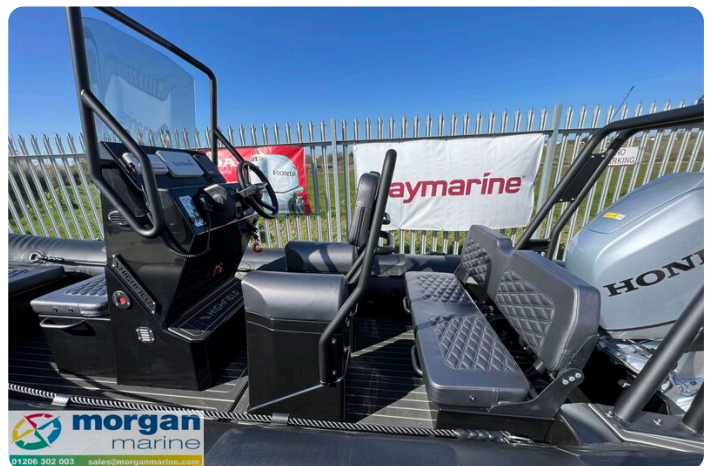
Highfield Patrol 500 aluminium RIB - jockey seats and aft bench seat