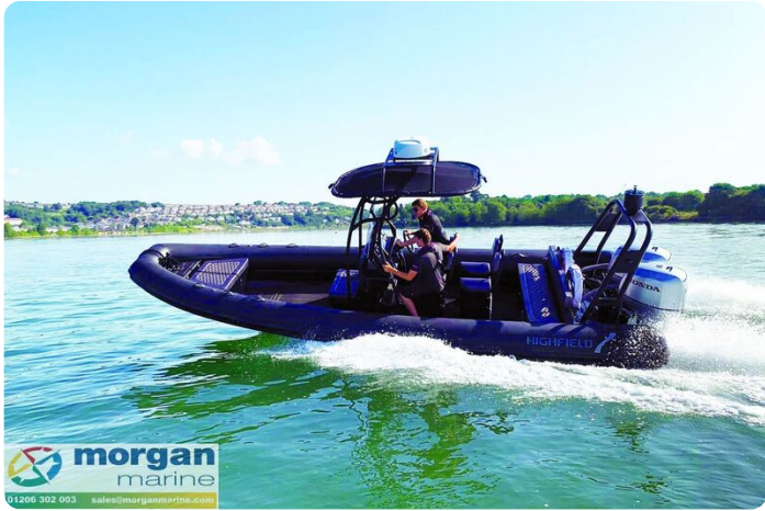
Highfield Patrol 860 aluminium RIB