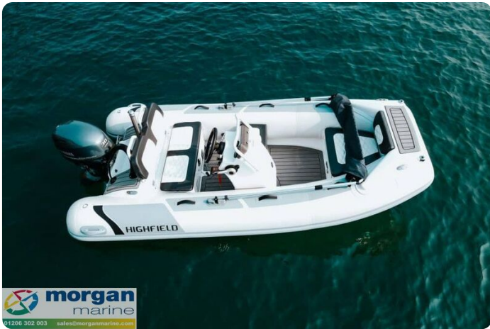
Highfield Sport 360 aluminium RIB