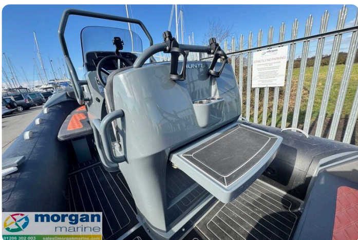
Highfield Sport 560 Hunter - pop up table