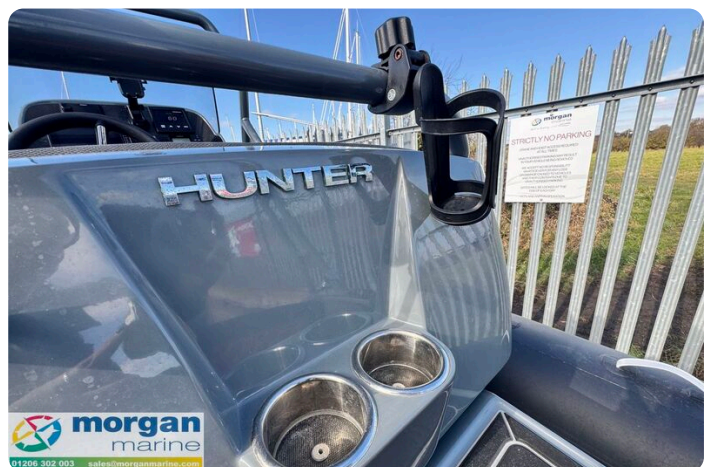
Highfield Sport 560 Hunter - cup holders