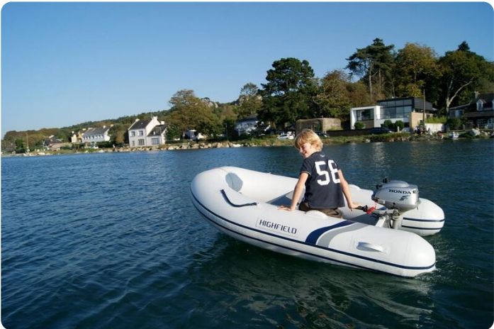
Highfield UL 240 aluminium RIB - on the water