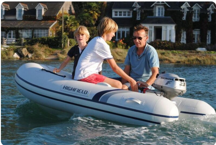
Highfield UL 240 aluminium RIB