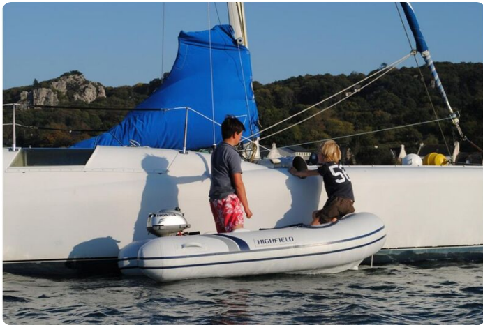
Highfield UL 240 aluminium RIB - next to larger boat