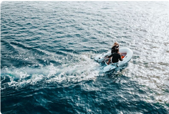
Highfield UL 240 aluminium RIB - overhead view