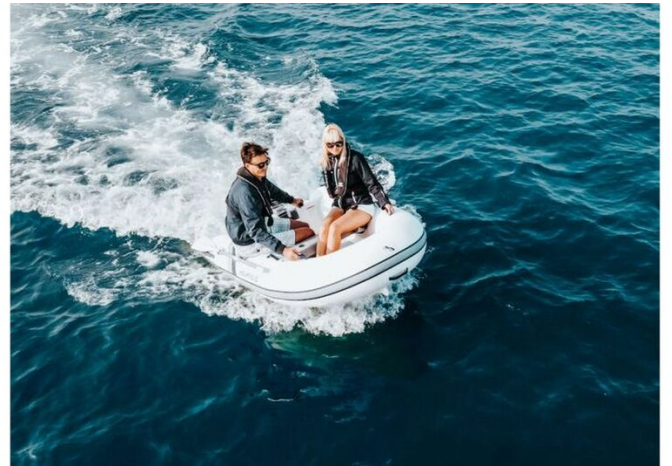
Highfield UL 240 aluminium RIB - moving through the water