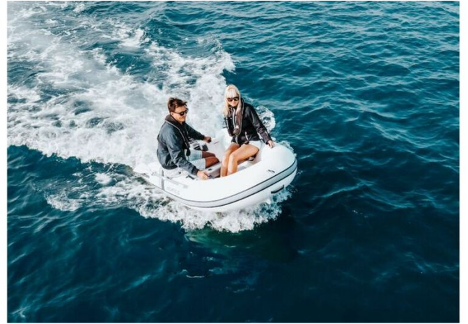
Highfield UL 240 aluminium RIB - moving through the water