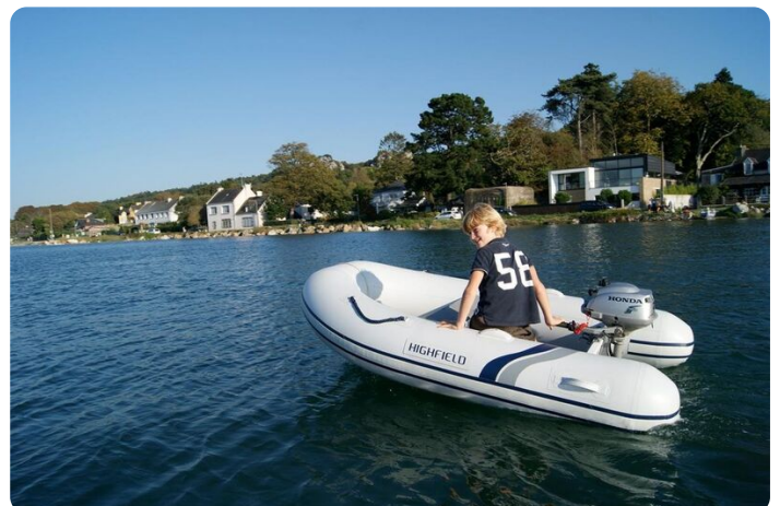
Highfield UL 240 aluminium RIB - on the water