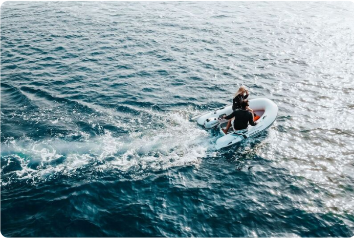
Highfield UL 240 aluminium RIB - overhead view