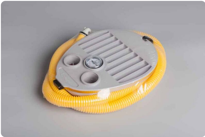
Highfield UL 340 aluminium RIB - pump