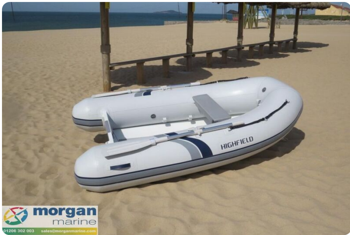
Highfield UL 340 aluminium RIB