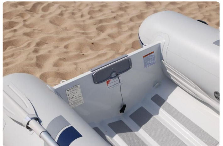
Highfield UL 340 aluminium RIB - deck and transom