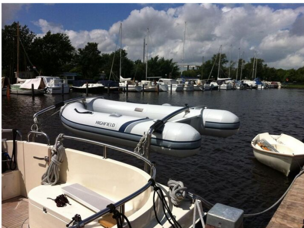
Highfield UL 340 aluminium RIB - on a larger boat