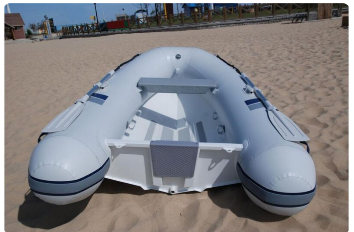
Highfield UL 340 aluminium RIB - overhead view