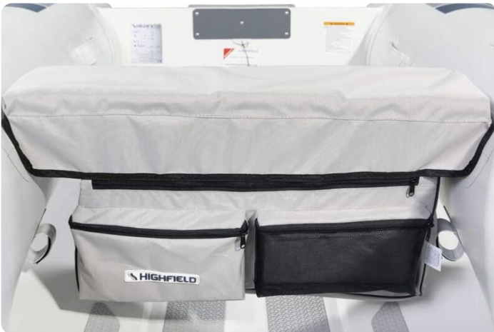
Highfield UL 340 aluminium RIB - storage