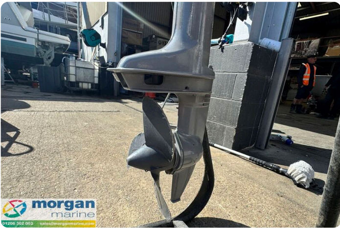
Honda BF2.3 Short Shaft - prop