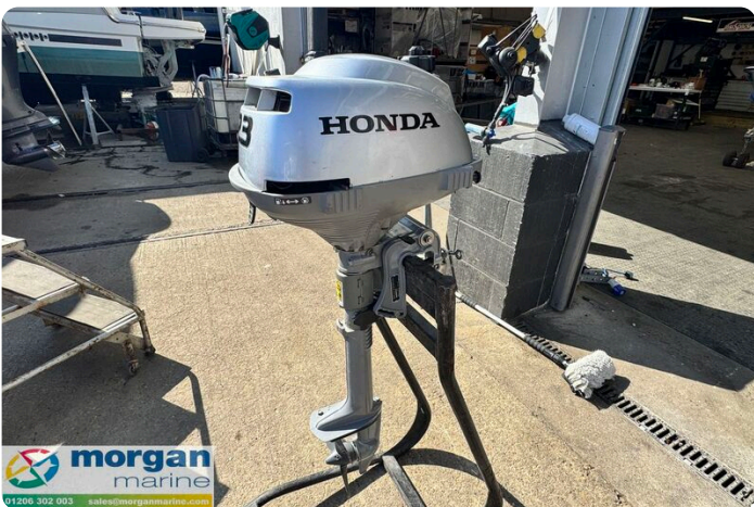
Honda BF2.3 Short Shaft - side view