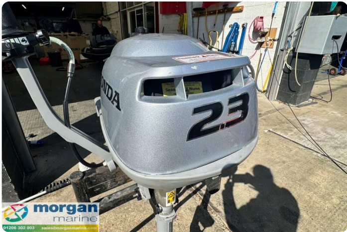
Honda BF2.3 Short Shaft - number