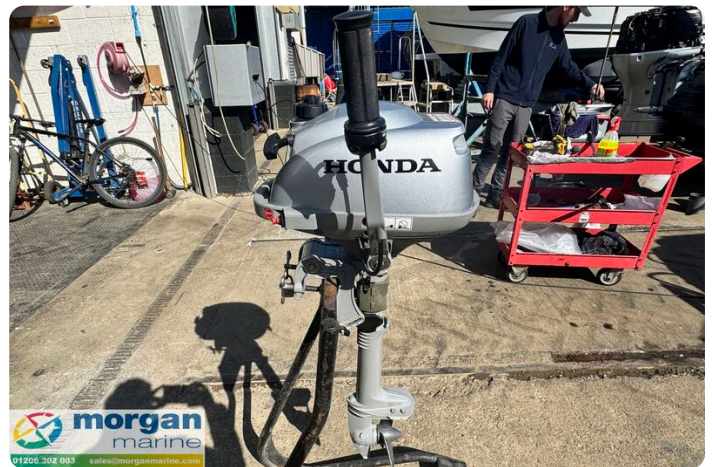
Honda BF2.3 Short Shaft - tiller