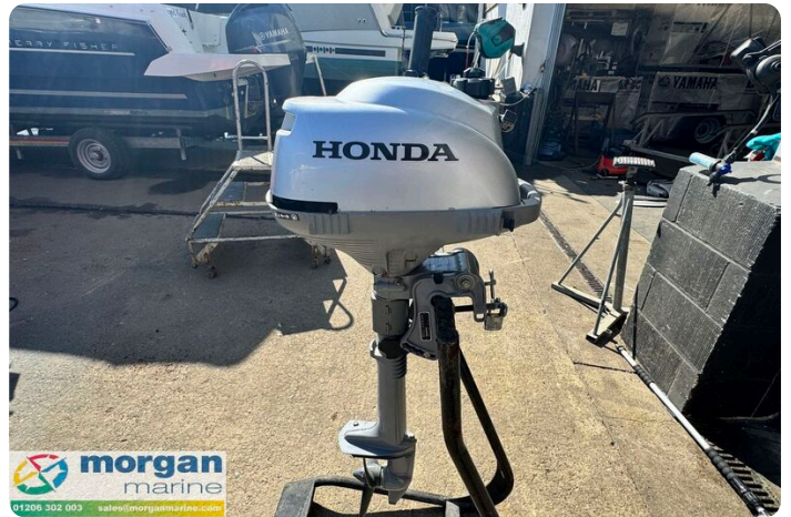
Honda BF2.3 Short Shaft - side view