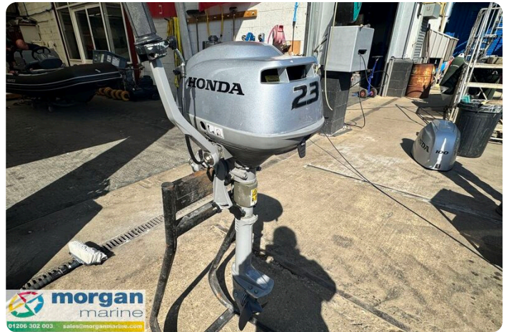
Honda BF2.3 Short Shaft - cowling