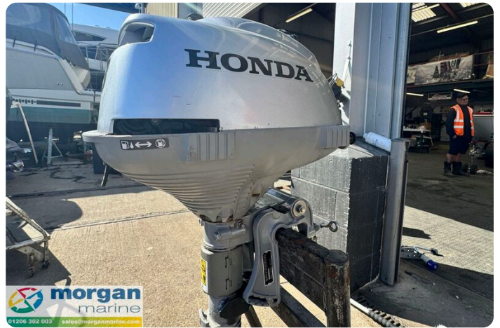
Honda BF2.3 Short Shaft - make