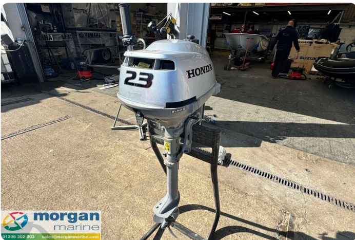
Honda BF2.3 Short Shaft - Main