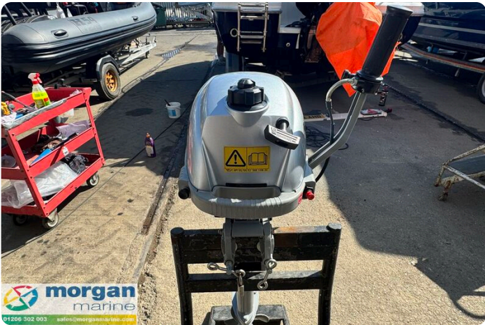
Honda BF2.3 Short Shaft - fuel