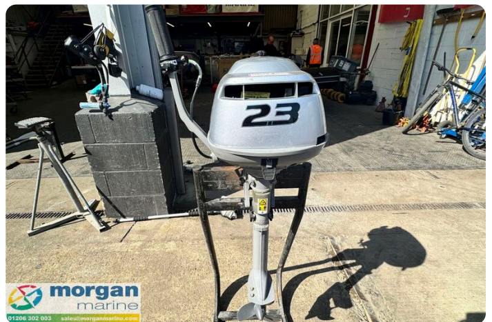
Honda BF2.3 Short Shaft - front