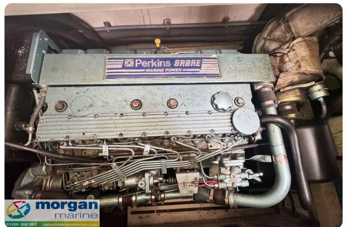
Humber 42 - close up engines