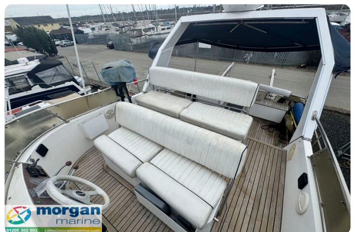
Humber 42 - fly seats