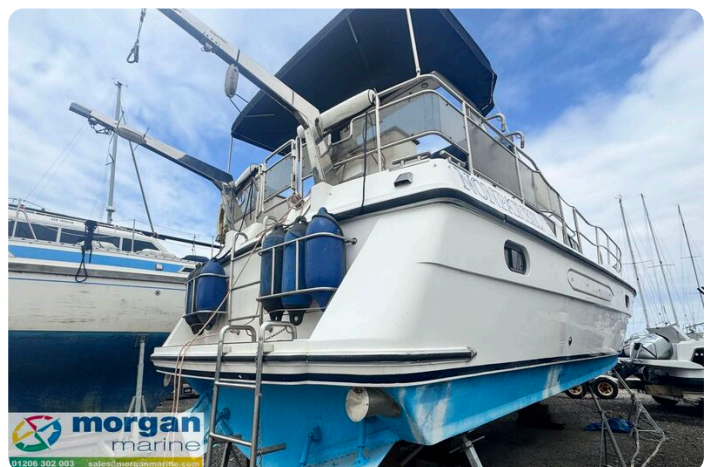
Humber 42 - ladder