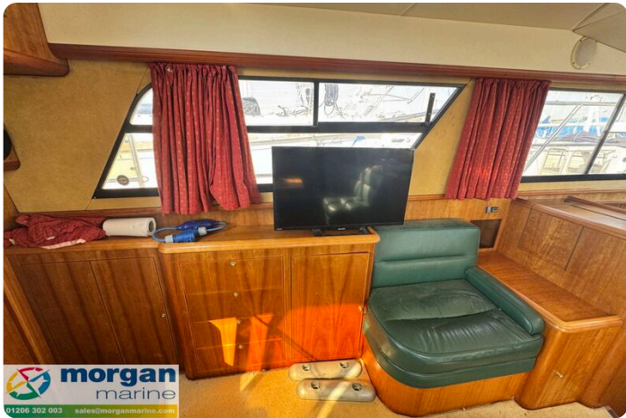
Humber 42 TSDY - TV