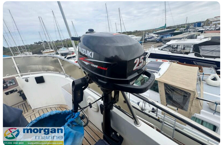
Humber 42 - aux