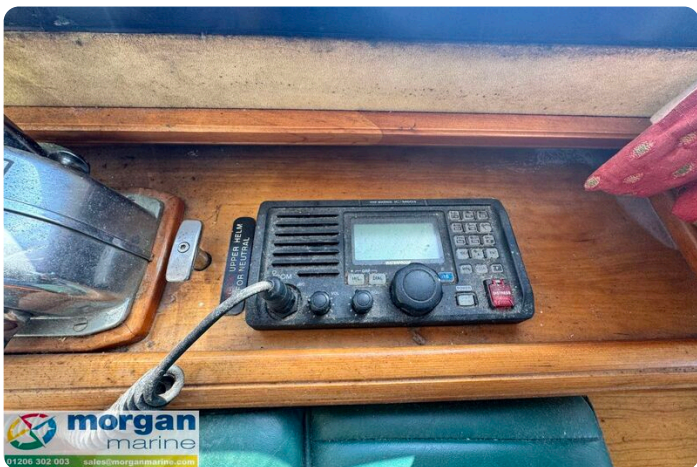
Humber 42 TSDY - plotter