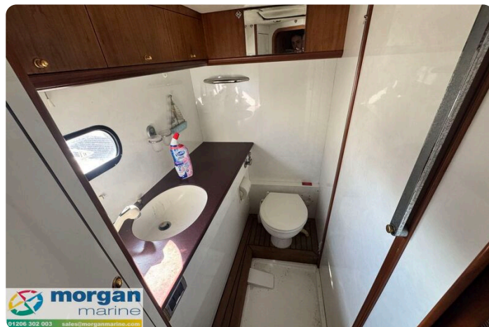
Humber 42 TSDY - aft toilet