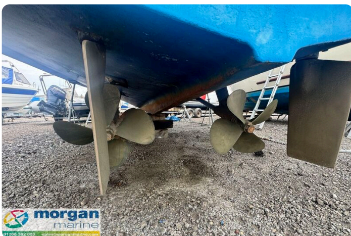
Humber 42 - props