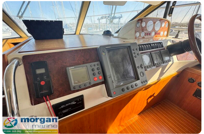
Humber 42 TSDY - plotter