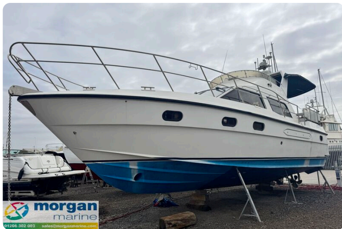
Humber 42 - Main