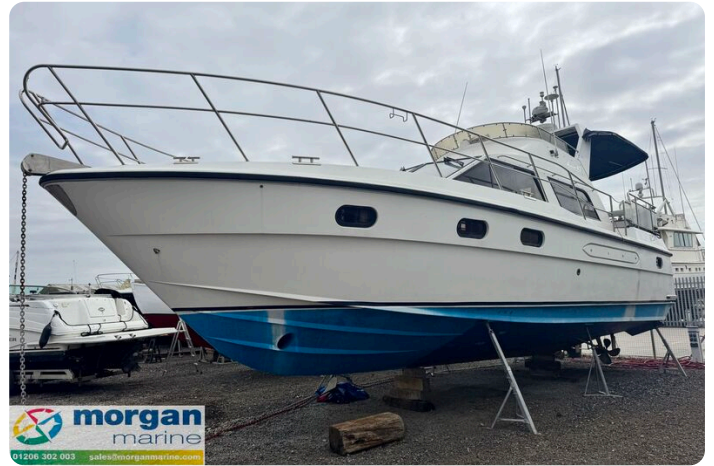
Humber 42 - side