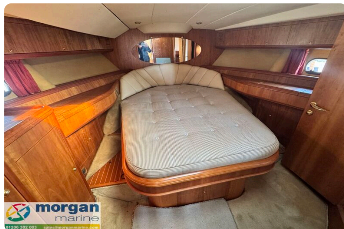
Humber 42 TSDY - main berth