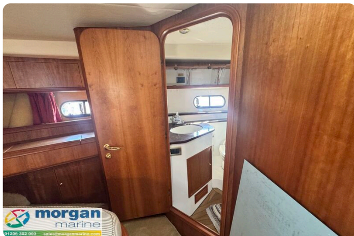
Humber 42 TSDY - door