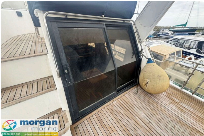
Humber 42 - doors