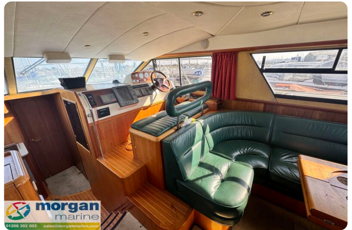
Humber 42 TSDY - Saloon 2