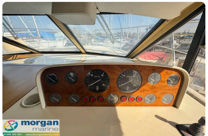
Humber 42 TSDY - dash