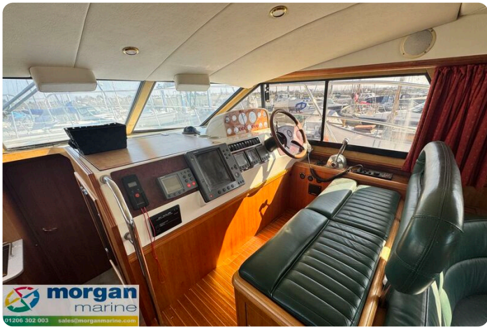
Humber 42 TSDY - pilot seat