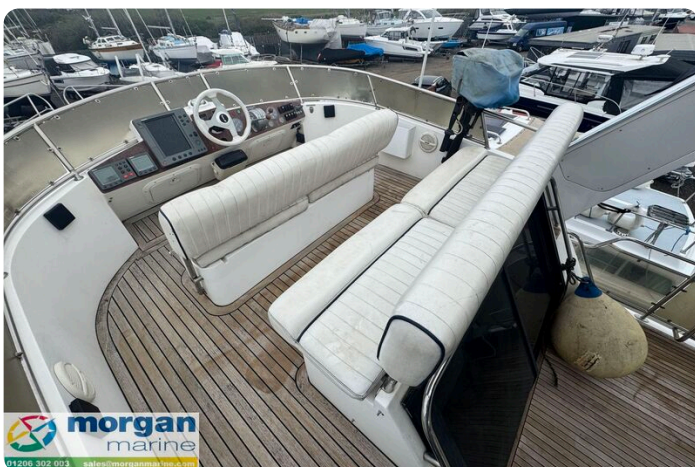
Humber 42 - fly