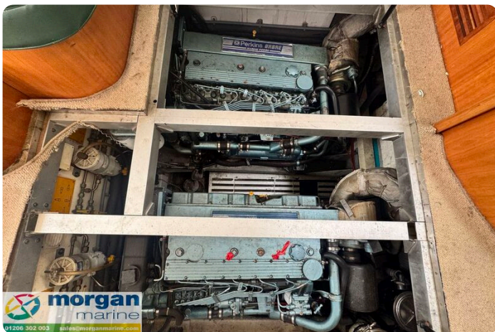
Humber 42 - engines