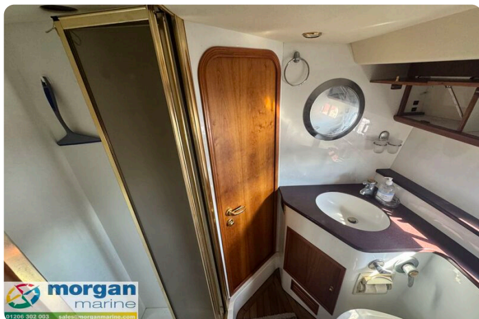
Humber 42 TSDY - sink