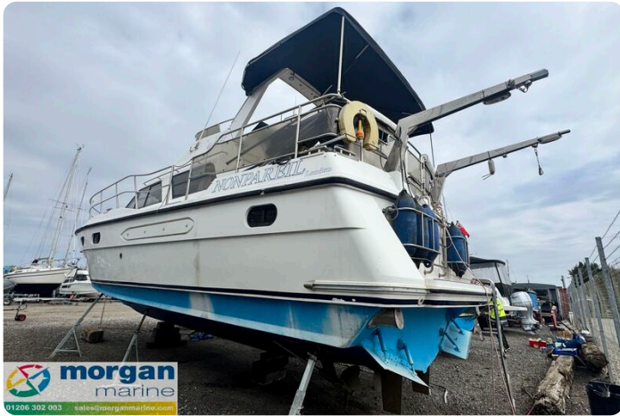
Humber 42 - back