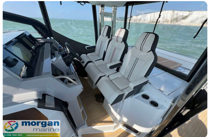
Jeanneau Cap Camarat 12.5 WA - engine controls and triple seats