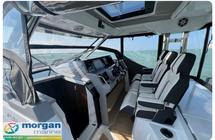
Jeanneau Cap Camarat 12.5 WA - door to cabin