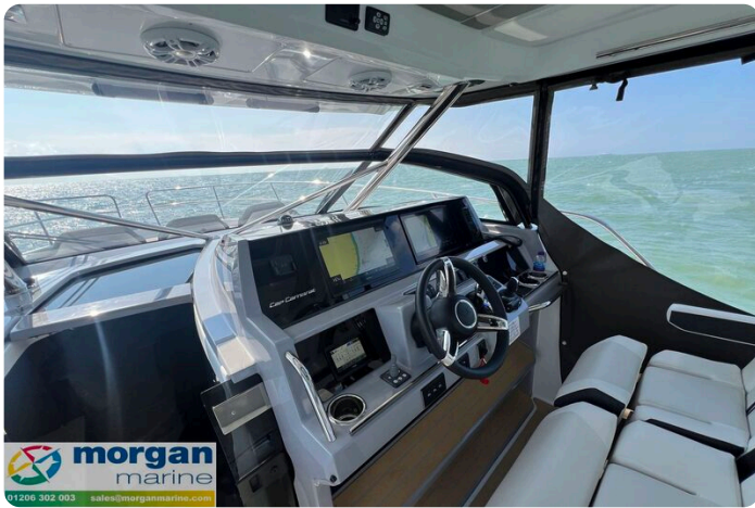
Jeanneau Cap Camarat 12.5 WA - helm position with great visibility