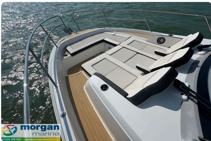
Jeanneau Cap Camarat 12.5 WA - side deck towards bow