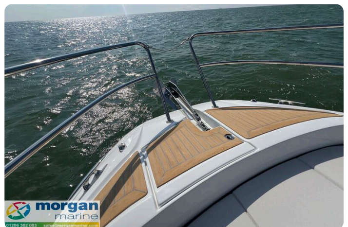
Jeanneau Cap Camarat 12.5 WA - anchor locker and pulpit rails