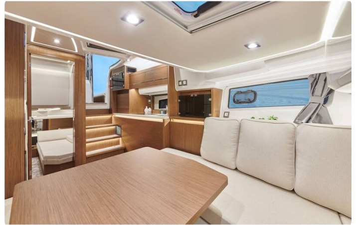
Jeanneau Cap Camarat 12.5 WA - forward cabin / saloon