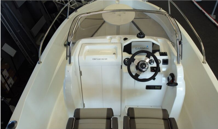
Jeanneau Cap Camarat 5.5 CC - helm position and dash