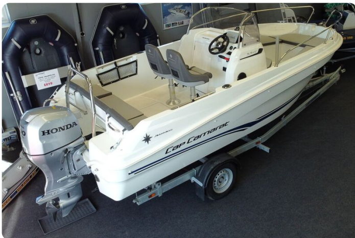
Jeanneau Cap Camarat 5.5 CC - cockpit seating and console