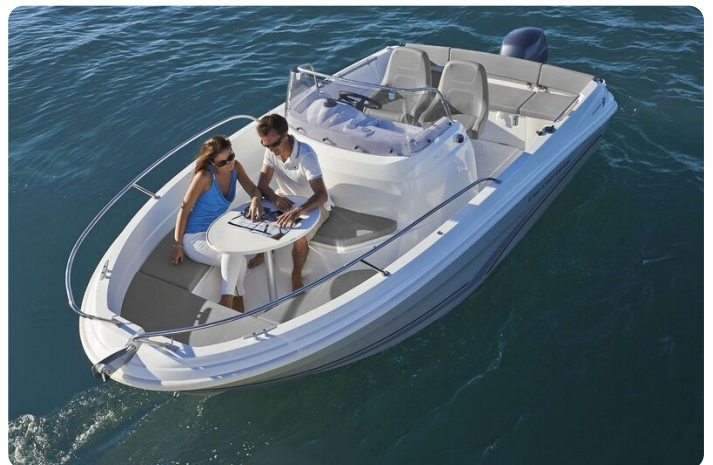
Jeanneau Cap Camarat 5.5 CC - with table in open bow