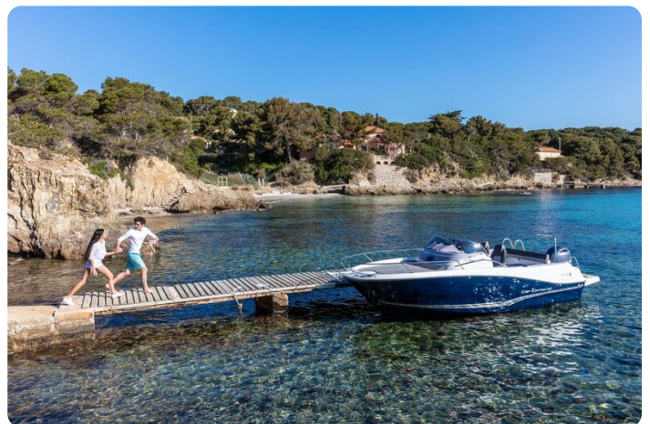
Jeanneau Cap Camarat 6.5 Walk Around - on a mooring