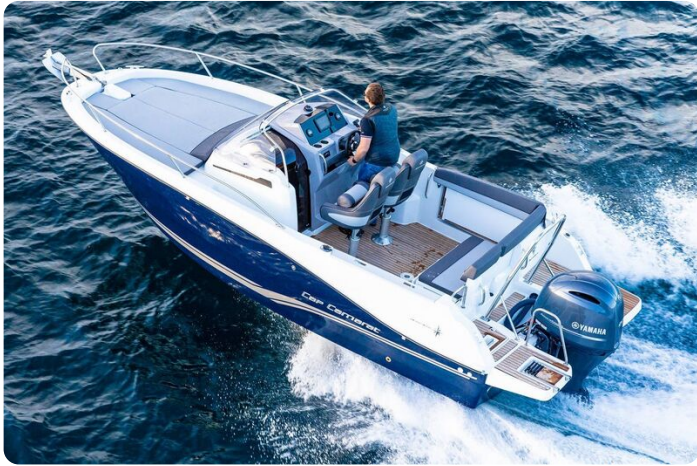
Jeanneau Cap Camarat 6.5 Walk Around