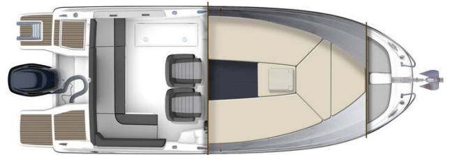
Jeanneau Cap Camarat 6.5 Walk Around - diagram of cuddy