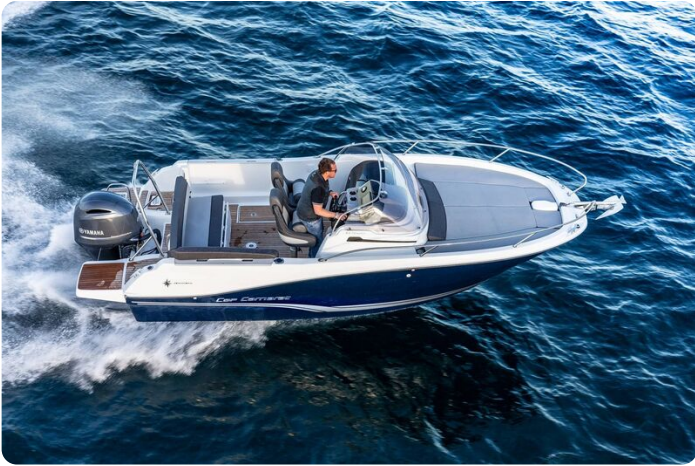
Jeanneau Cap Camarat 6.5 Walk Around - overhead view from port side