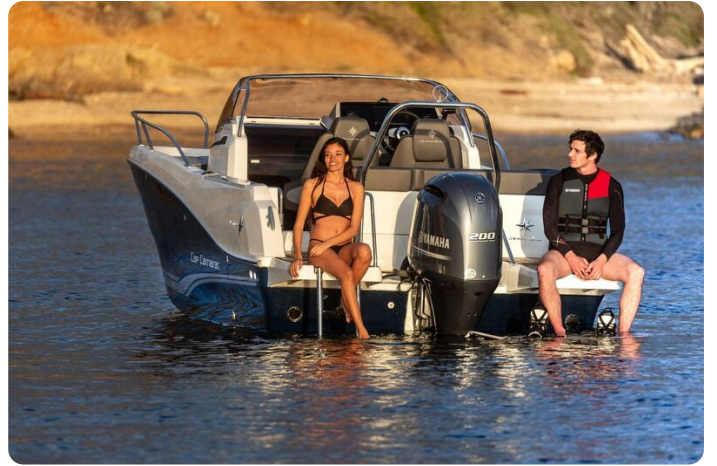
Jeanneau Cap Camarat 6.5 Walk Around - swim platforms