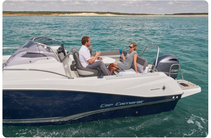
Jeanneau Cap Camarat 6.5 Walk Around - cockpit table and aft seating