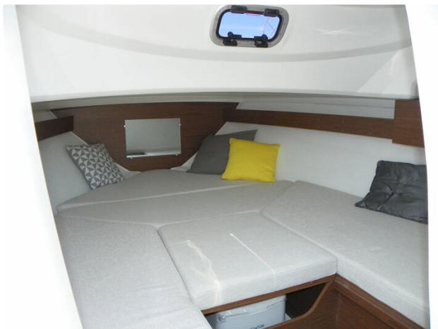
Jeanneau Cap Camarat 6.5 Walk Around - 2 berth cuddy