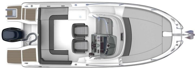
Jeanneau Cap Camarat 6.5 Walk Around - diagram of overhead view