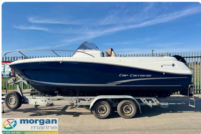
Cap Camarat 6.5 WA - side view