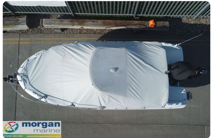
Cap Camarat 6.5 WA - top view cover