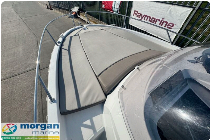
Cap Camarat 6.5 WA - sun bed