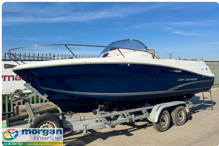
Cap Camarat 6.5 WA - Main