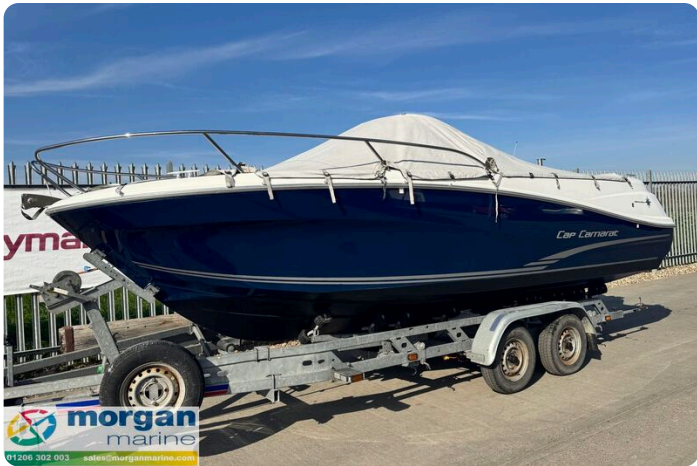
Cap Camarat 6.5 WA - full cover