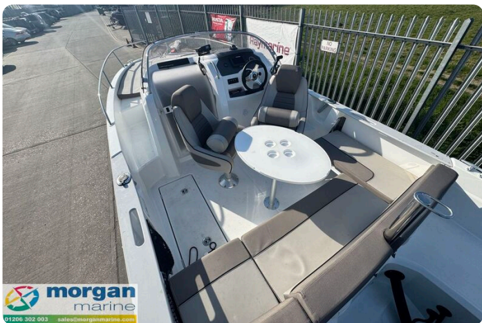
Cap Camarat 6.5 WA - table