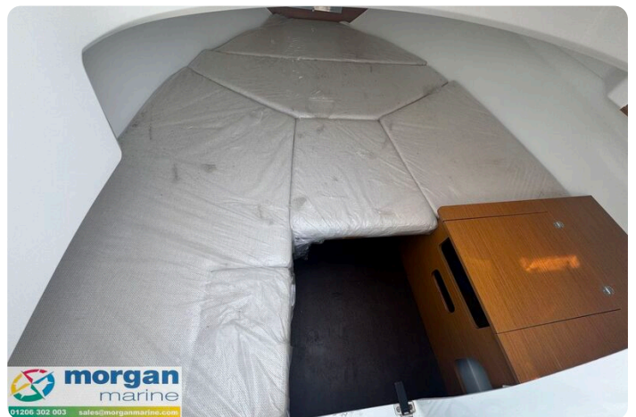
Cap Camarat 6.5 WA - main berth