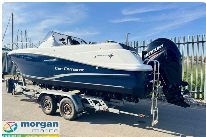
Cap Camarat 6.5 WA - back