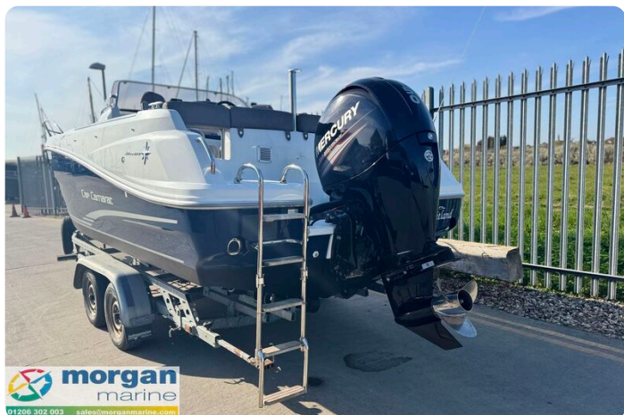
Cap Camarat 6.5 WA - boarding ladder