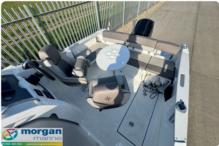
Cap Camarat 6.5 WA - bolster seats