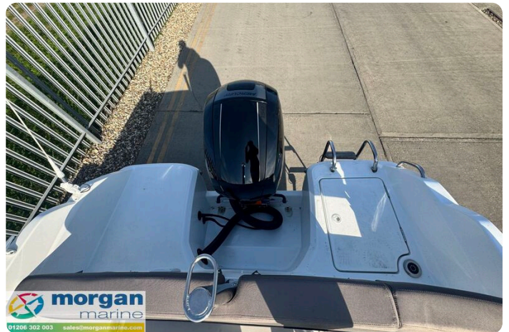
Cap Camarat 6.5 WA - engine