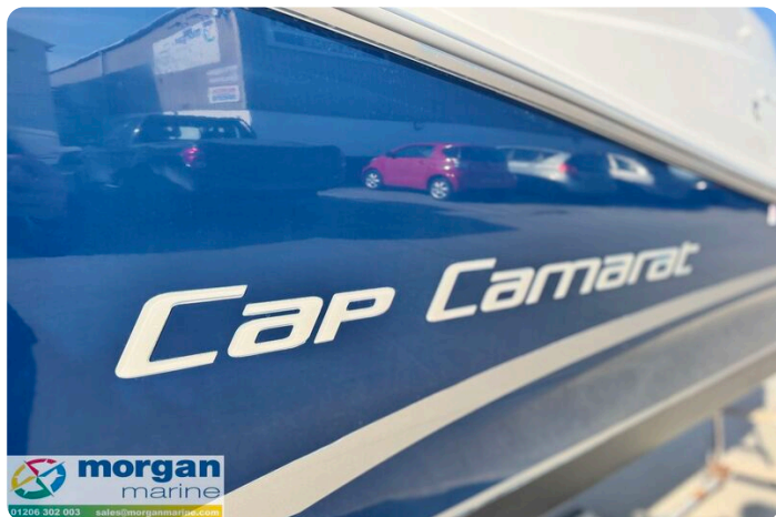
Cap Camarat 6.5 WA - brand