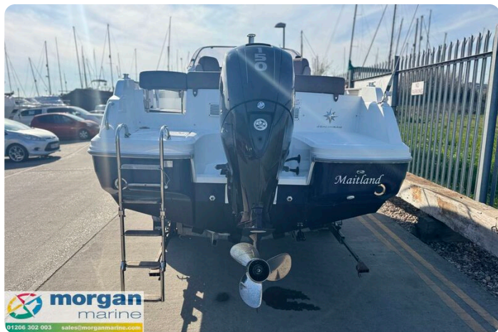
Cap Camarat 6.5 WA - engine