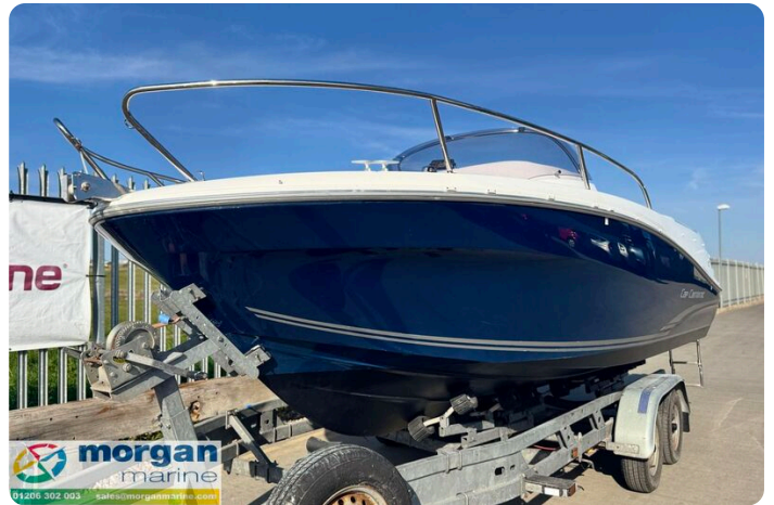
Cap Camarat 6.5 WA - railings