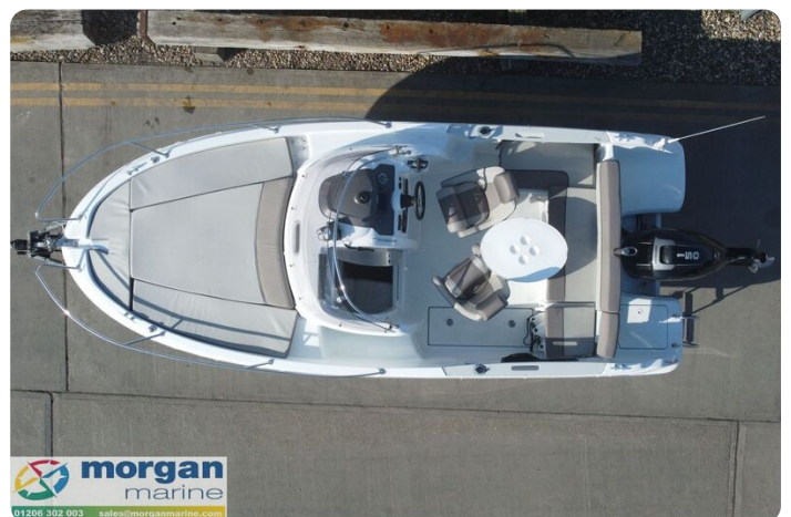
Cap Camarat 6.5 WA - top view -2