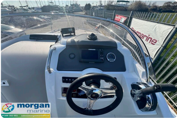
Cap Camarat 6.5 WA - dash