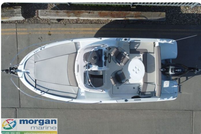
Cap Camarat 6.5 WA - top view