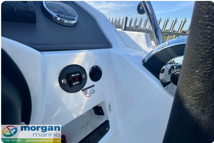
Cap Camarat 6.5 WA - key start