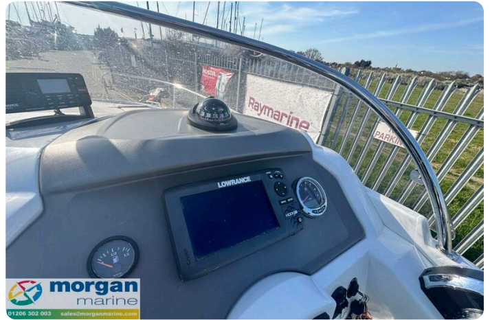
Cap Camarat 6.5 WA - chart plotter