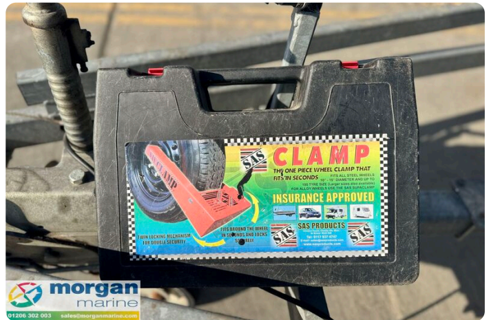
Cap Camarat 6.5 WA - wheel clamp