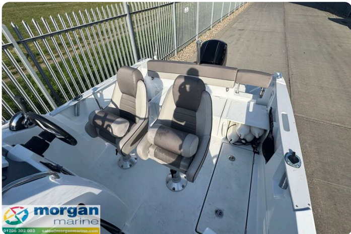
Cap Camarat 6.5 WA - bolster seats