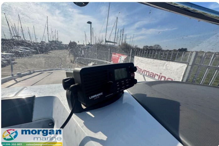
Cap Camarat 6.5 WA - VHF