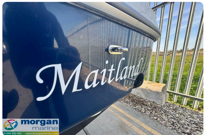
Cap Camarat 6.5 WA - name