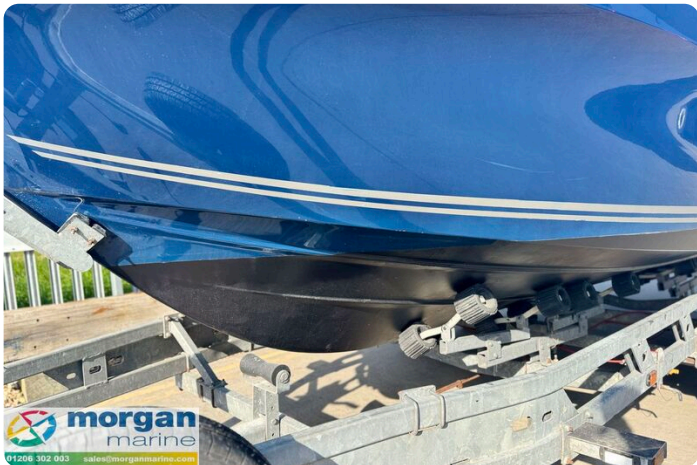
Cap Camarat 6.5 WA - hull