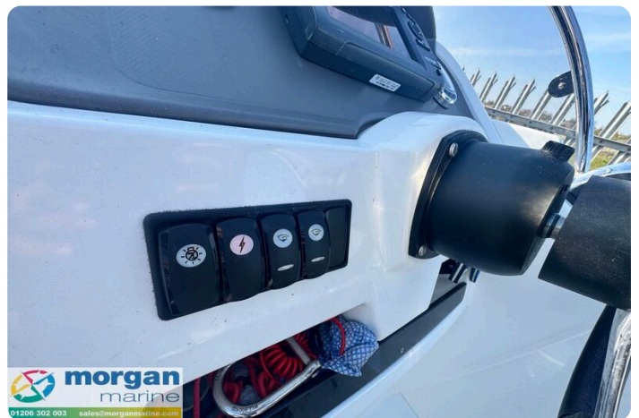
Cap Camarat 6.5 WA - buttons