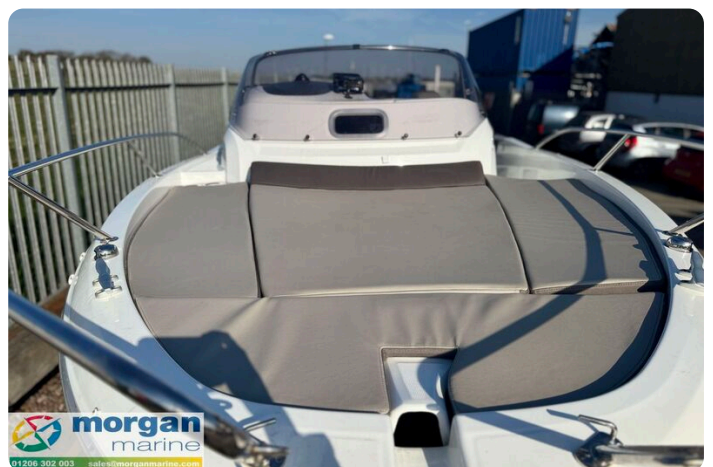
Cap Camarat 6.5 WA - sun bed cushions