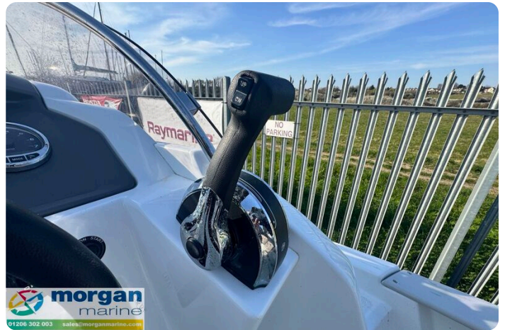
Cap Camarat 6.5 WA - throttle control