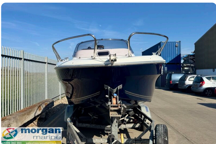
Cap Camarat 6.5 WA - bow