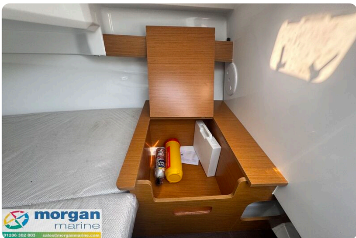
Cap Camarat 6.5 WA - storage