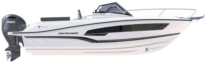
Jeanneau Cap Camarat 7.5 WA - diagram of starboard side