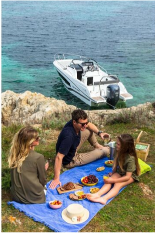
Jeanneau Cap Camarat 7.5 WA - great for picnics