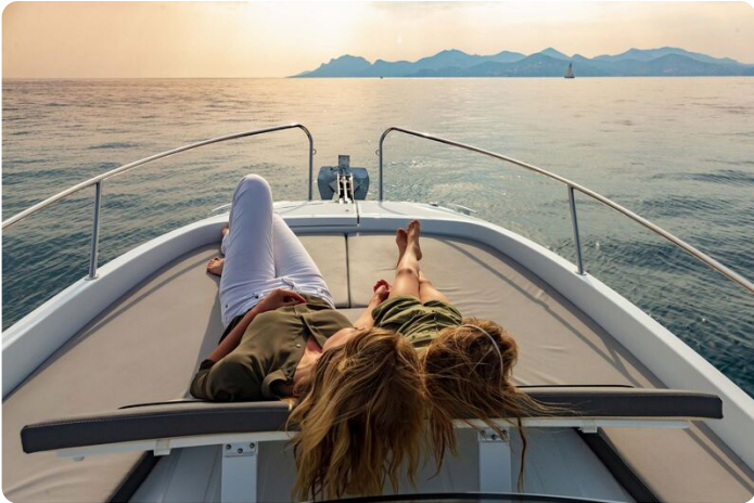
Jeanneau Cap Camarat 7.5 WA - bow sun lounger