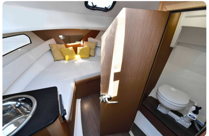
Jeanneau Cap Camarat 7.5 WA - toilet compartment