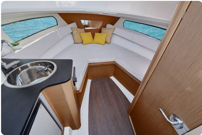
Jeanneau Cap Camarat 7.5 WA - cabin with port side galley and starboard side toilet compartment