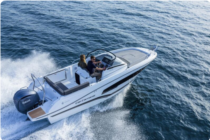
Jeanneau Cap Camarat 7.5 WA - overhead view from starboard side