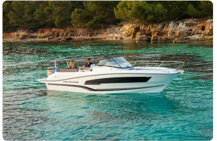
Jeanneau Cap Camarat 7.5 WA - in beautiful surroundings