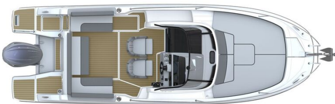
Jeanneau Cap Camarat 7.5 WA - diagram of cockpit with seats