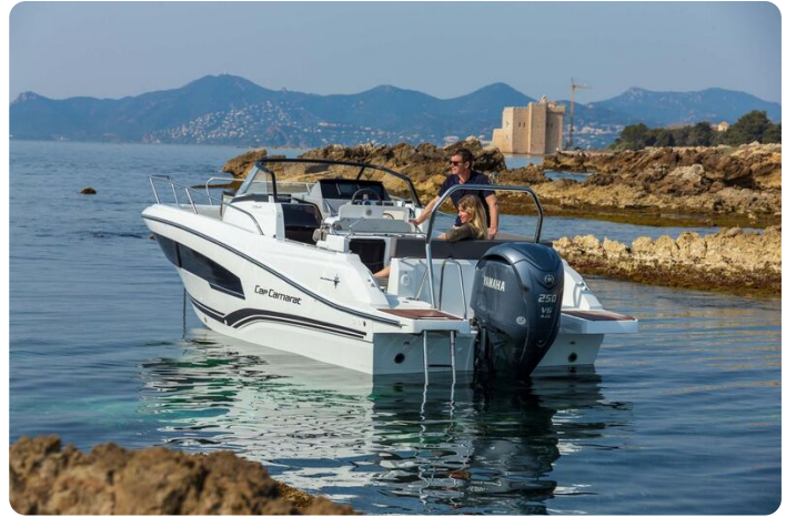
Jeanneau Cap Camarat 7.5 WA - transom with engine and swim platform