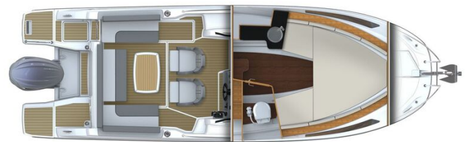
Jeanneau Cap Camarat 7.5 WA - diagram of cockpit seating around table and cabin layout