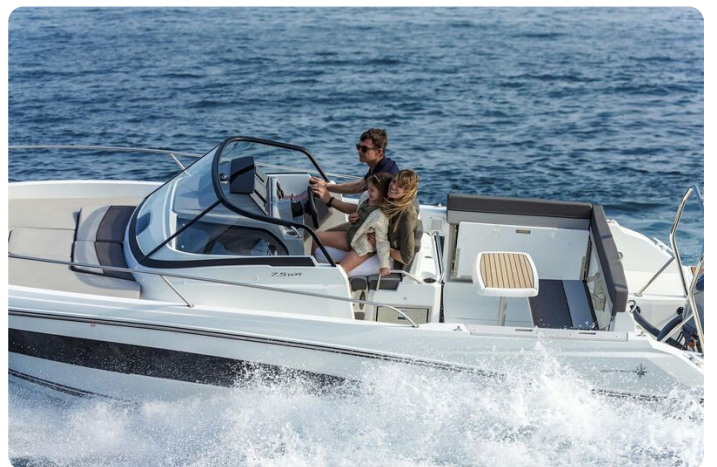
Jeanneau Cap Camarat 7.5 WA - relaxing on the boat