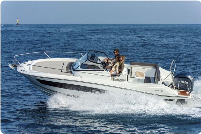
Jeanneau Cap Camarat 7.5 WA - view towards port side