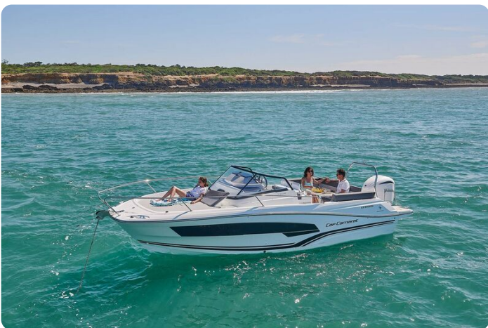
Jeanneau Cap Camarat 7.5 WA - on the water