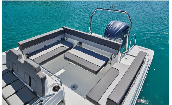
Jeanneau Cap Camarat 7.5 WA - cockpit seating and ski arch