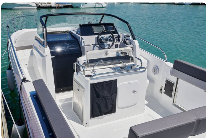
Jeanneau Cap Camarat 7.5 WA - leaning post with cockpit galley