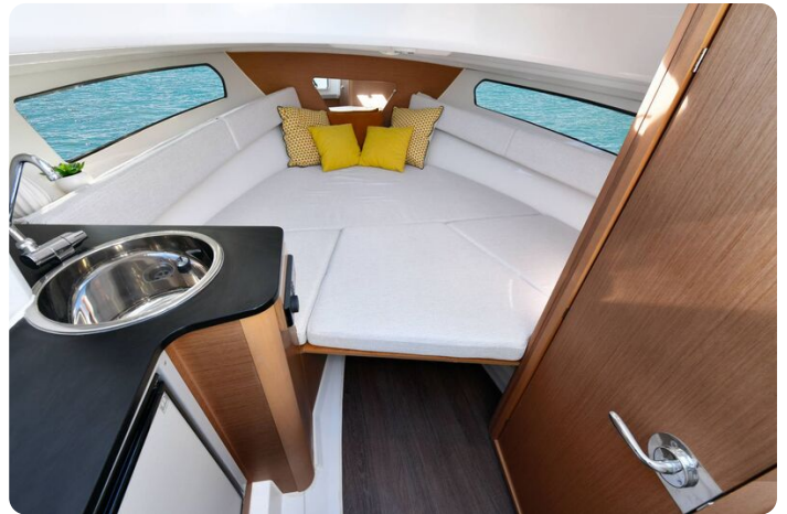
Jeanneau Cap Camarat 7.5 WA - cabin with double berth infill