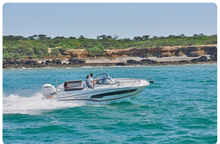
Jeanneau Cap Camarat 7.5 WA - speeding through the water