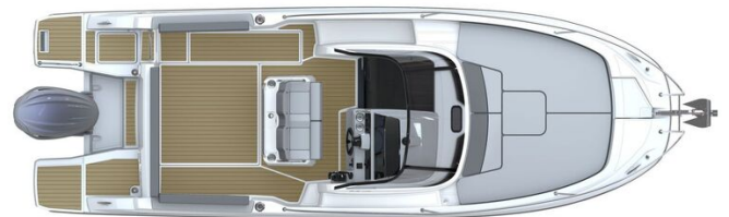
Jeanneau Cap Camarat 7.5 WA - diagram of cockpit with seats folded