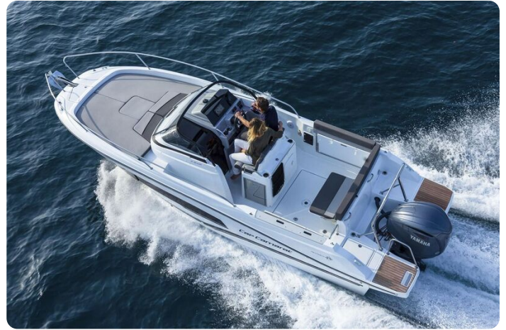
Jeanneau Cap Camarat 7.5 WA