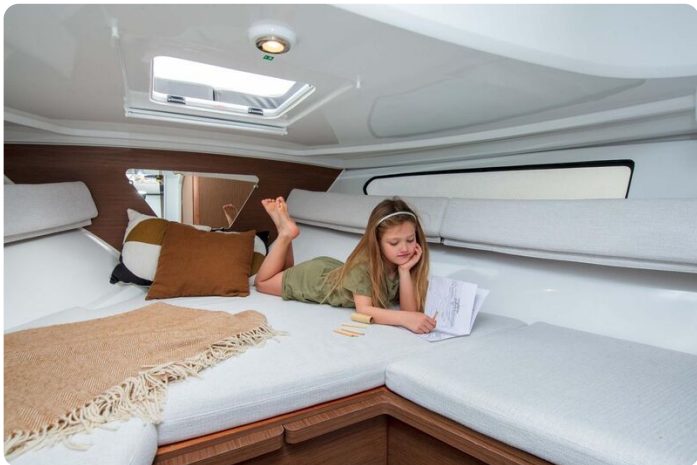
Jeanneau Cap Camarat 7.5 WA - cabin roof hatch to deck