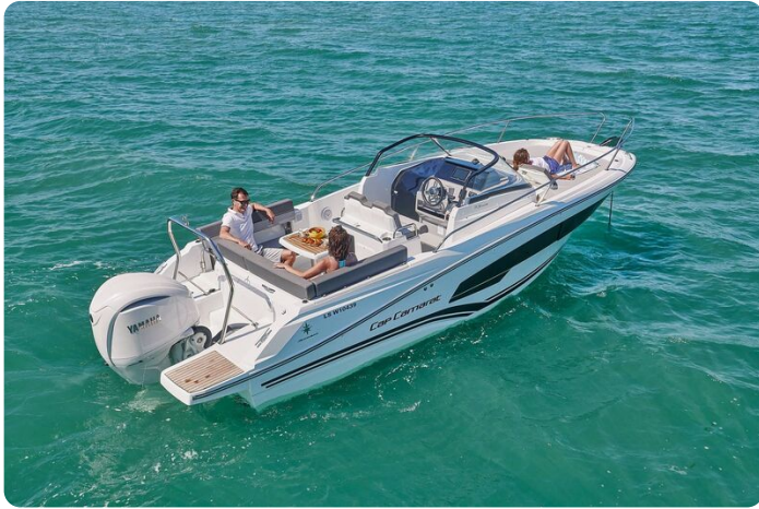
Jeanneau Cap Camarat 7.5 WA - plenty of seating