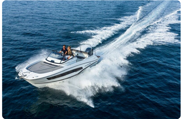
Jeanneau Cap Camarat 7.5 WA - with large wake