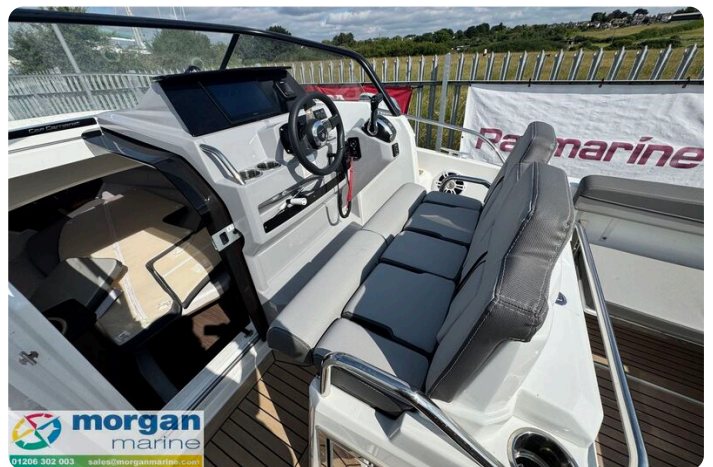
Jeanneau Cap Camarat 7.5 WA S3 - wheel