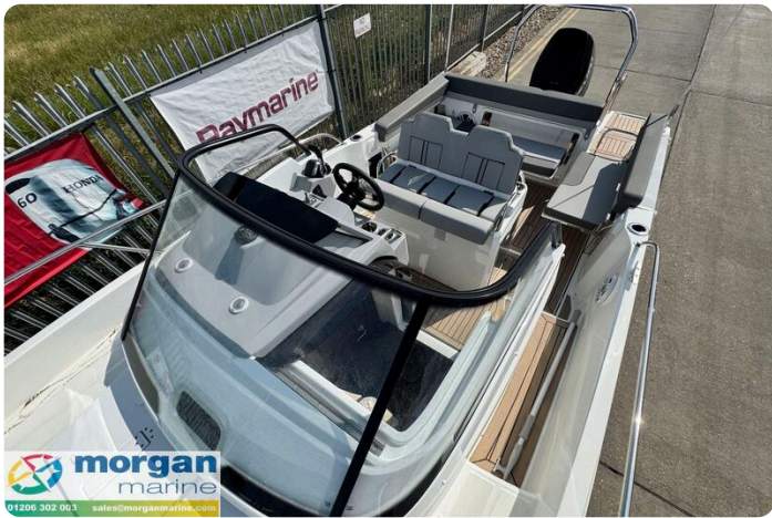
Jeanneau Cap Camarat 7.5 WA S3 - windscreen