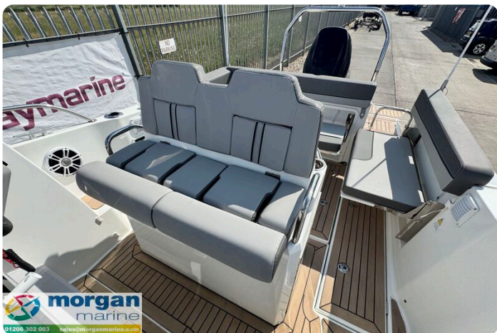
Jeanneau Cap Camarat 7.5 WA S3 - bolster seats