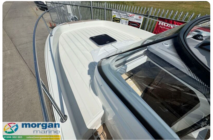
Jeanneau Cap Camarat 7.5 WA S3 - deck