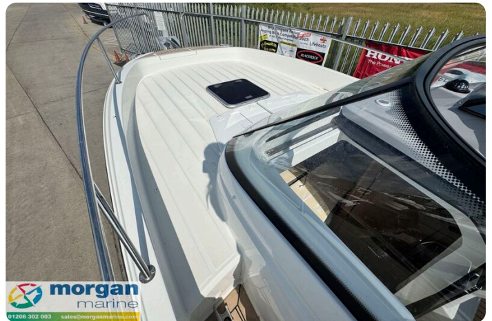
Jeanneau Cap Camarat 7.5 WA S3 - deck