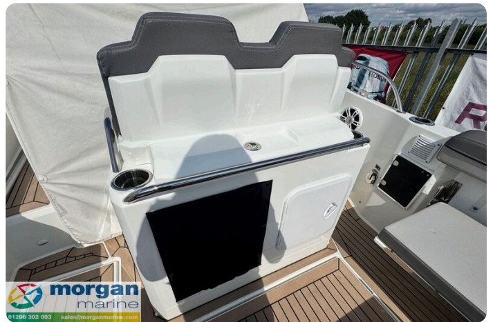
Jeanneau Cap Camarat 7.5 WA S3 - cockpit galley