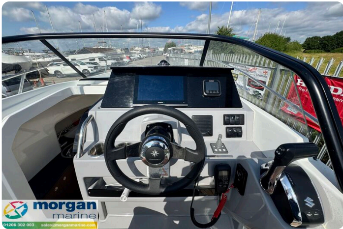
Jeanneau Cap Camarat 7.5 WA S3 - dash