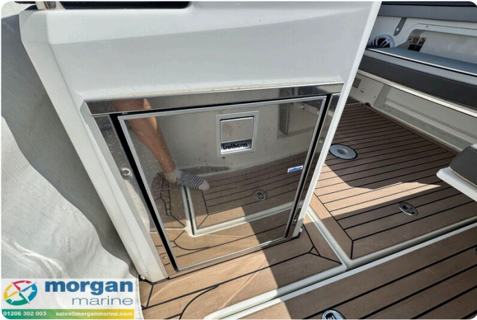
Jeanneau Cap Camarat 7.5 WA S3 - cockpit fridge