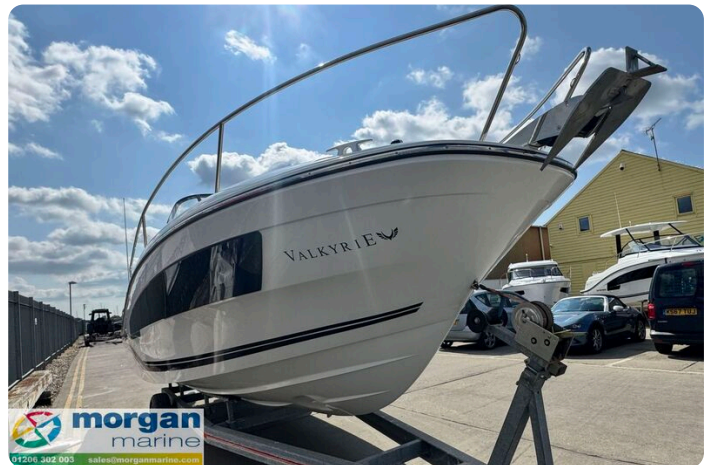
Jeanneau Cap Camarat 7.5 WA S3 - rails