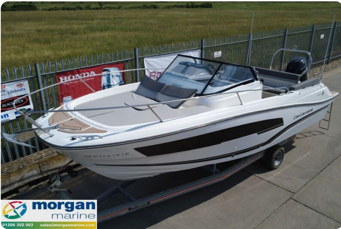
Jeanneau Cap Camarat 7.5 WA S3 - bow seating