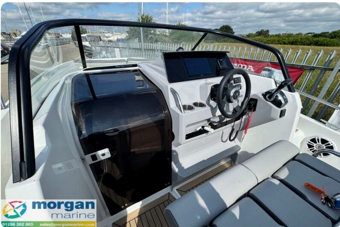
Jeanneau Cap Camarat 7.5 WA S3 - door