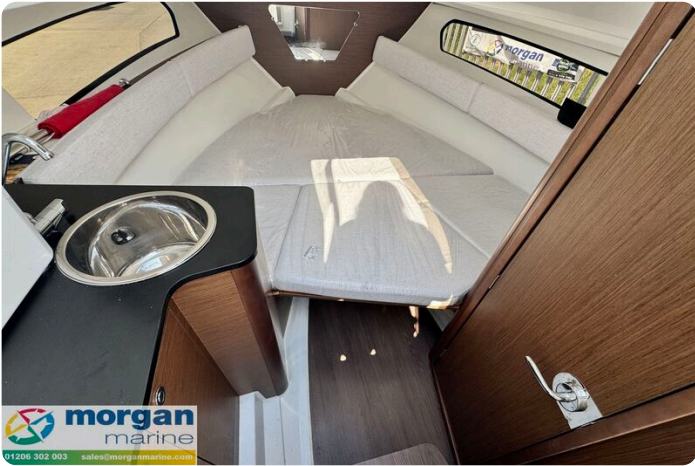
Jeanneau Cap Camarat 7.5 WA S3 - cabin