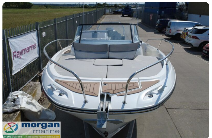
Jeanneau Cap Camarat 7.5 WA S3 - anchor