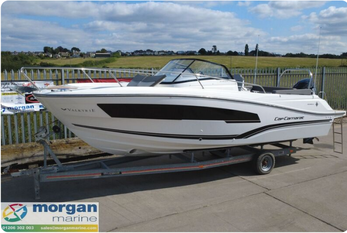
Jeanneau Cap Camarat 7.5 WA S3 - Main