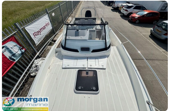
Jeanneau Cap Camarat 7.5 WA S3 - deck hatch