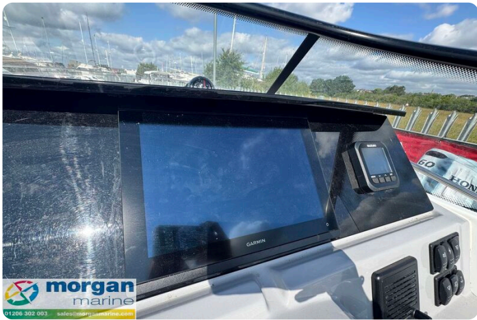
Jeanneau Cap Camarat 7.5 WA S3 - Garmin