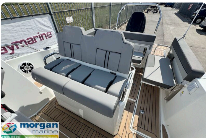
Jeanneau Cap Camarat 7.5 WA S3 - bolster seats