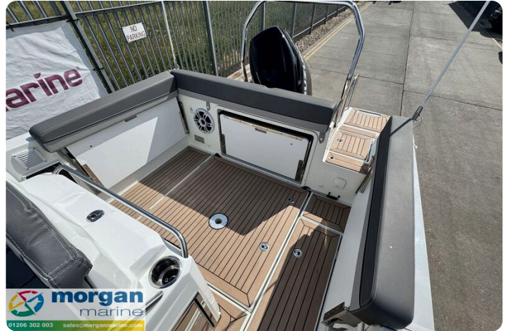
Jeanneau Cap Camarat 7.5 WA S3 - cockpit