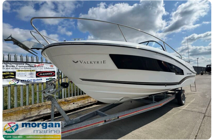
Jeanneau Cap Camarat 7.5 WA S3 - bow