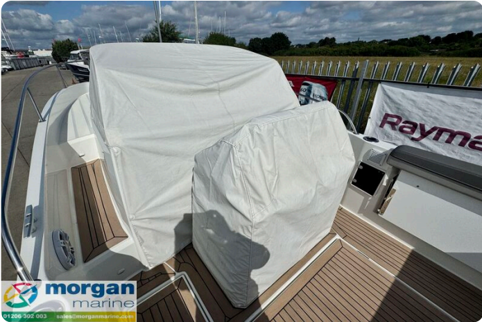
Jeanneau Cap Camarat 7.5 WA S3 - console cover