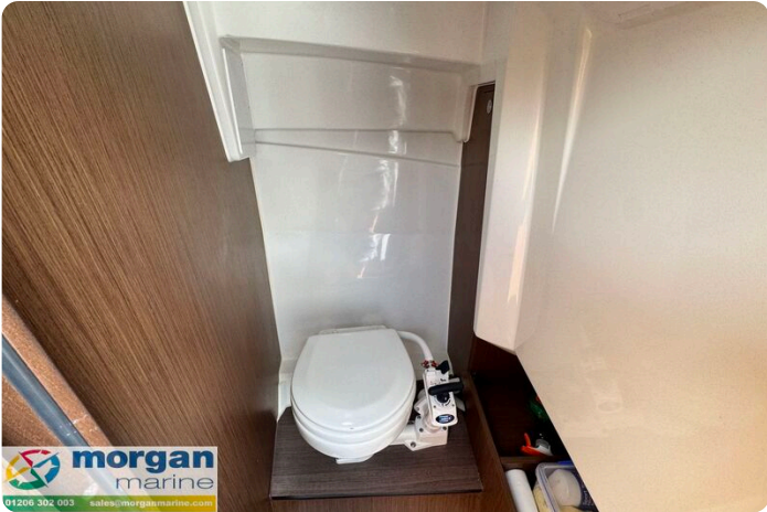
Jeanneau Cap Camarat 7.5 WA S3 - toilet