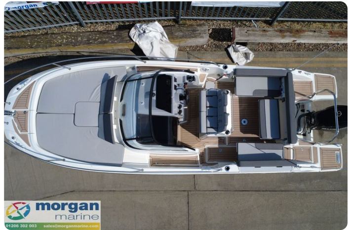
Jeanneau Cap Camarat 7.5 WA S3 - top view