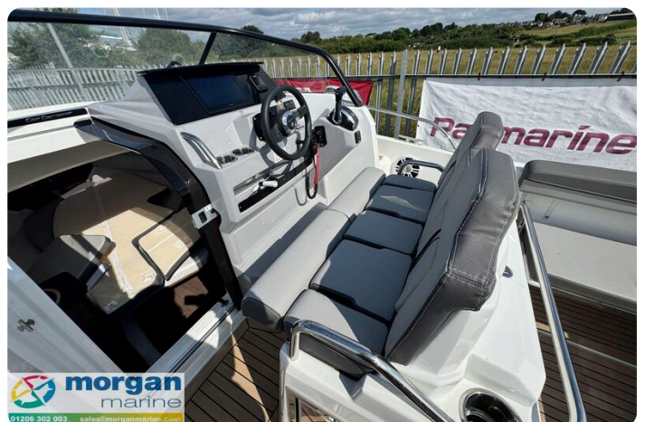
Jeanneau Cap Camarat 7.5 WA S3 - wheel