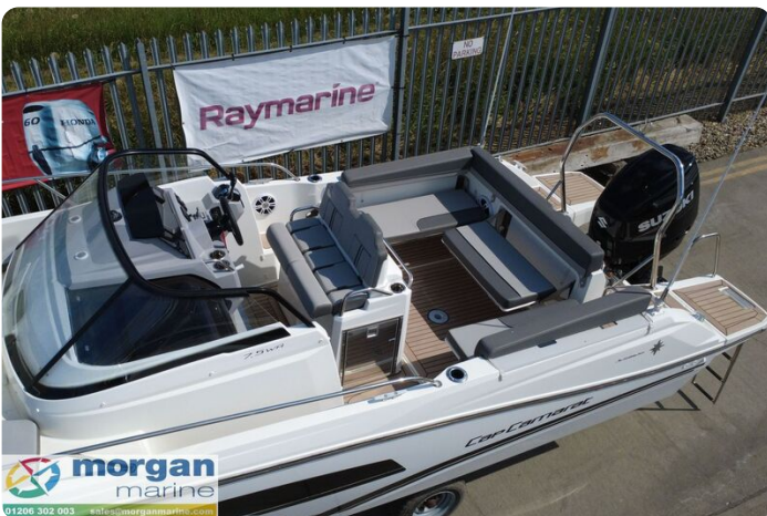
Jeanneau Cap Camarat 7.5 WA S3 - bolster seats