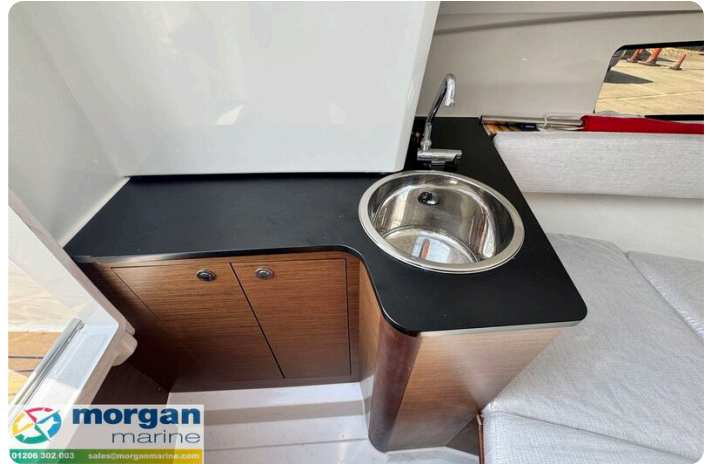
Jeanneau Cap Camarat 7.5 WA S3 - galley sink