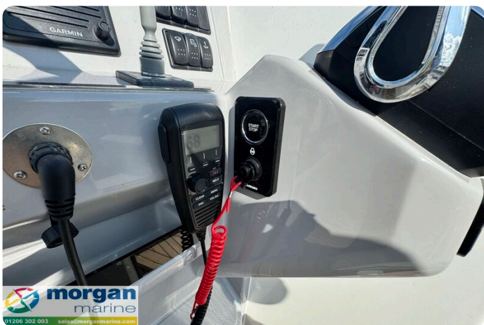
Jeanneau Cap Camarat 7.5 WA S3 - vhf radio