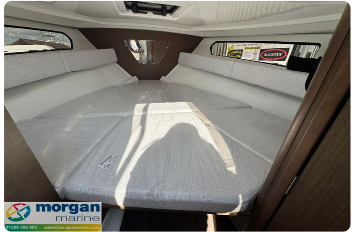
Jeanneau Cap Camarat 7.5 WA S3 - main berth