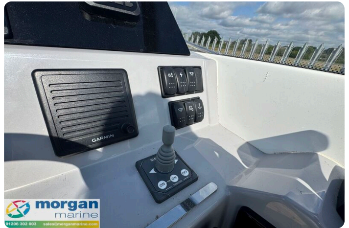
Jeanneau Cap Camarat 7.5 WA S3 - bow thruster