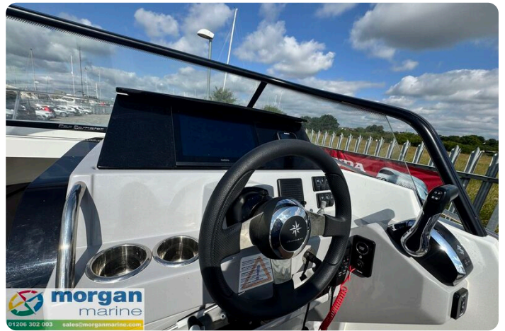
Jeanneau Cap Camarat 7.5 WA S3 - cup holder