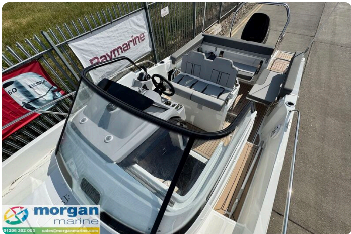
Jeanneau Cap Camarat 7.5 WA S3 - windscreen