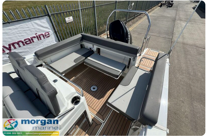
Jeanneau Cap Camarat 7.5 WA S3 - cockpit seating