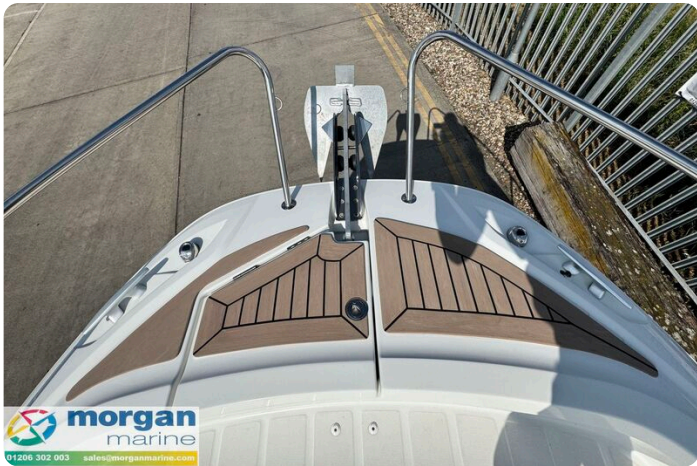
Jeanneau Cap Camarat 7.5 WA S3 - bow locker