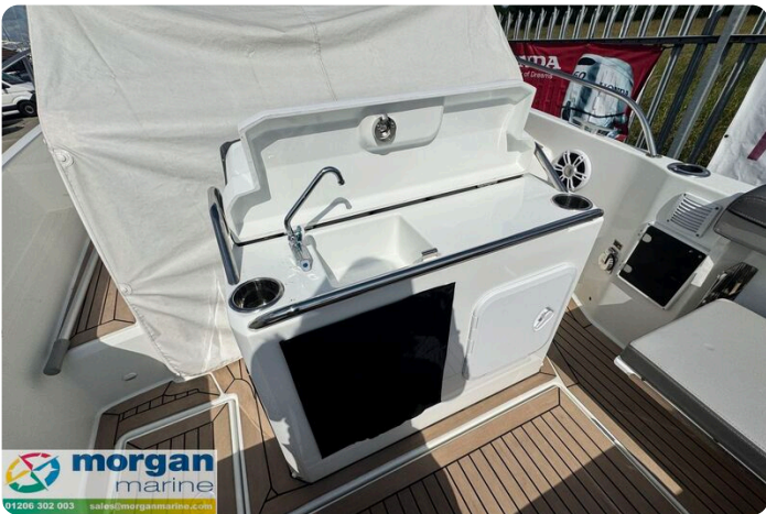
Jeanneau Cap Camarat 7.5 WA S3 - cockpit sink