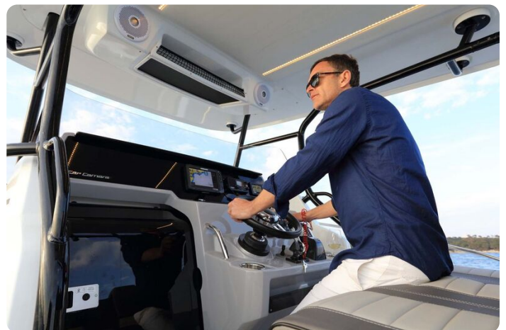
Jeanneau Cap Camarat 9.0 CC - helm position and plexi door to cabin