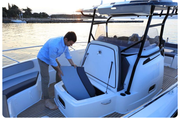
Jeanneau Cap Camarat 9.0 CC - access to cabin from bow