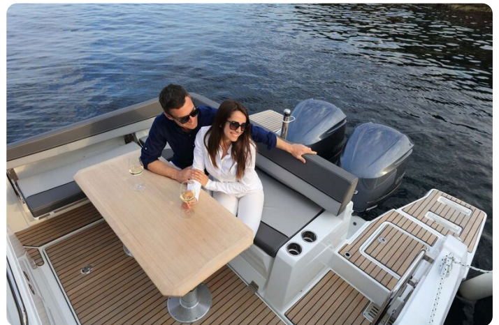
Jeanneau Cap Camarat 9.0 CC - aft cockpit bench seat and table