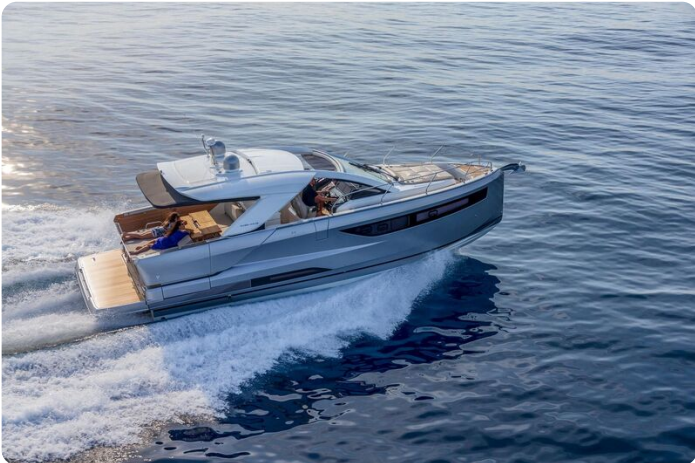
Jeanneau DB 43 inboard - overhead view from starboard side