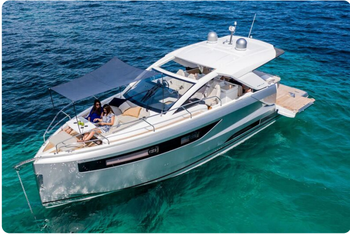
Jeanneau DB 43 inboard