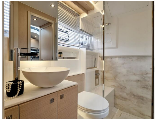
Jeanneau DB 43 inboard - toilet and shower compartment