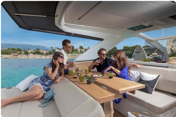
Jeanneau DB 43 inboard - sitting at cockpit table