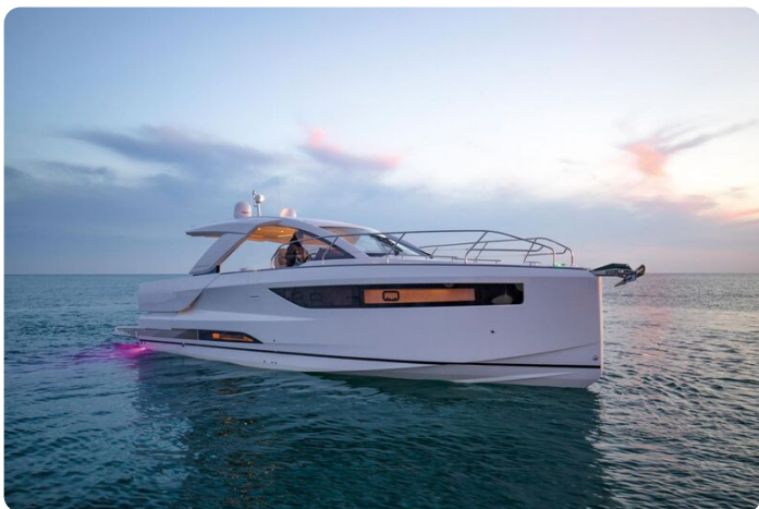
Jeanneau DB 43 inboard - view towards starboard side bow