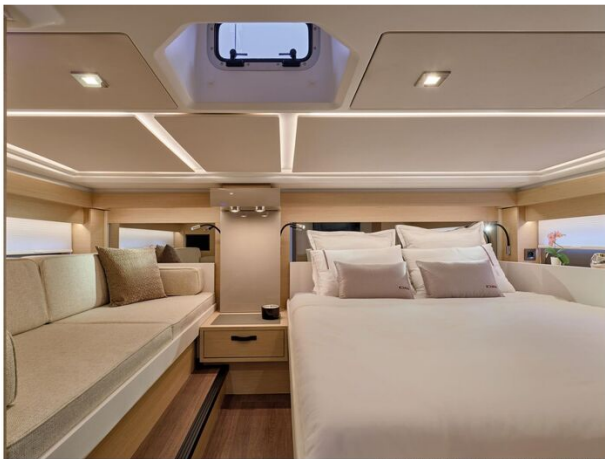
Jeanneau DB 43 inboard - aft cabin with double berth and sofa