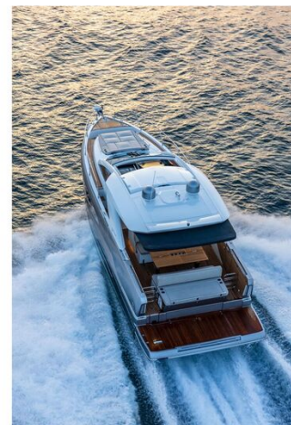
Jeanneau DB 43 inboard - overhead view from aft