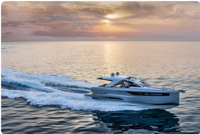
Jeanneau DB 43 inboard - cruising on the water