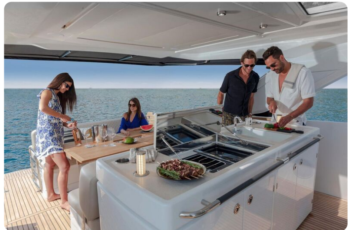
Jeanneau DB 43 inboard - cockpit galley