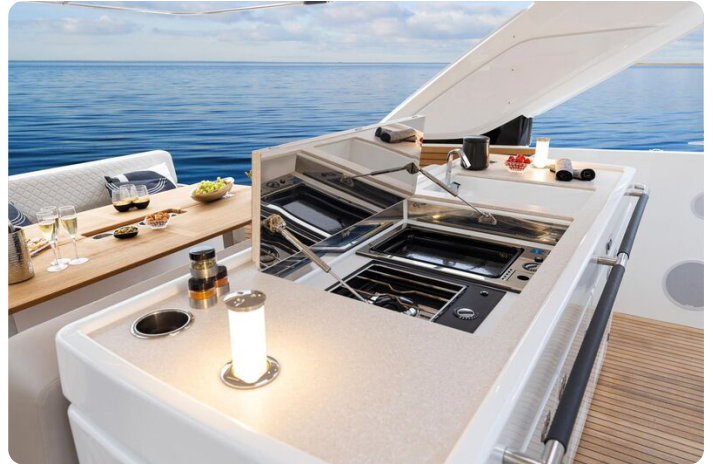
Jeanneau DB 43 inboard - cockpit galley