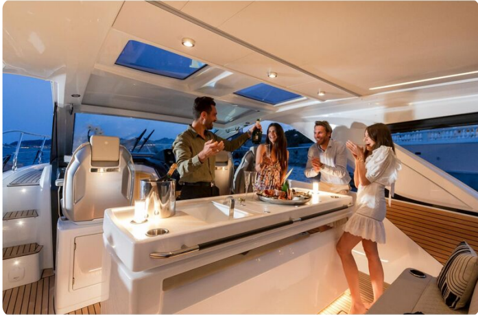
Jeanneau DB 43 inboard - cockpit galley