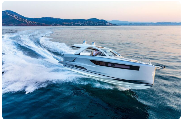
Jeanneau DB 43 inboard - on the water