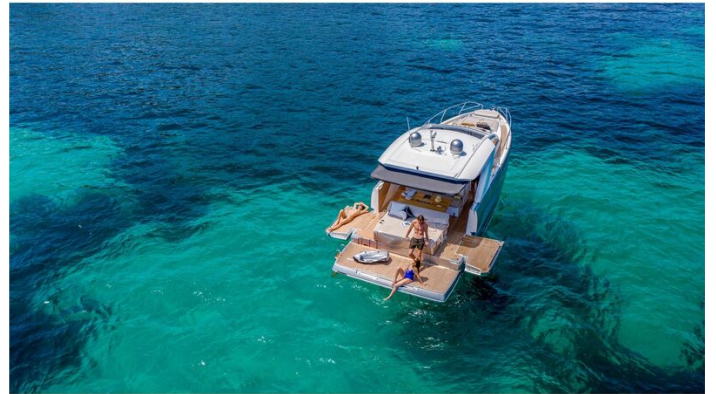
Jeanneau DB 43 inboard - view from high above