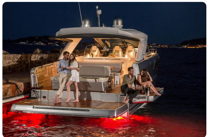
Jeanneau DB 43 inboard - socialising at night on the terraces with under water lights