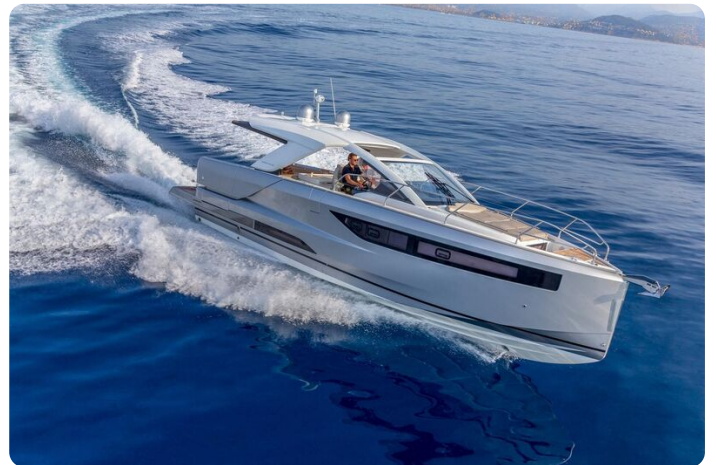
Jeanneau DB 43 inboard - speeding through the water