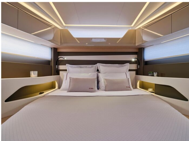
Jeanneau DB 43 inboard - forward cabin with double berth