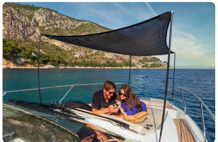
Jeanneau DB 43 inboard - forward cockpit sunshade