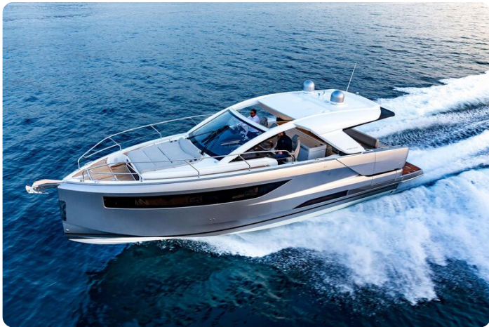
Jeanneau DB 43 inboard - on the water