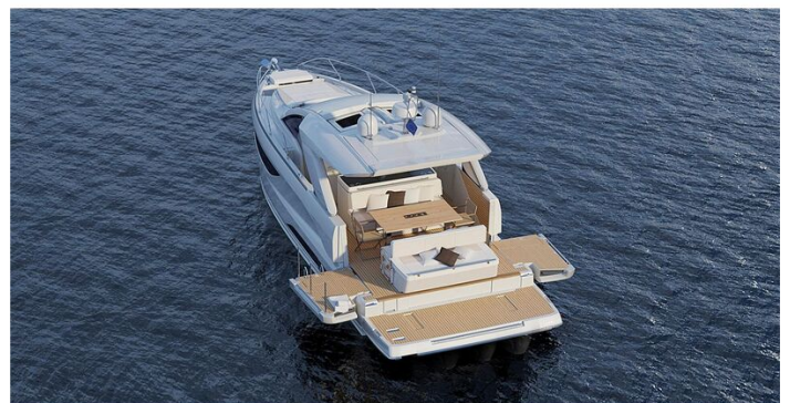
Jeanneau DB 43 inboard - overhead view of terraces