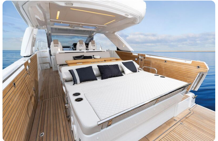
Jeanneau DB 43 inboard - aft sun lounger