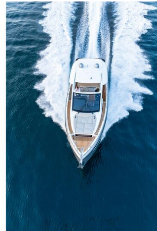
Jeanneau DB 43 inboard - with large wake