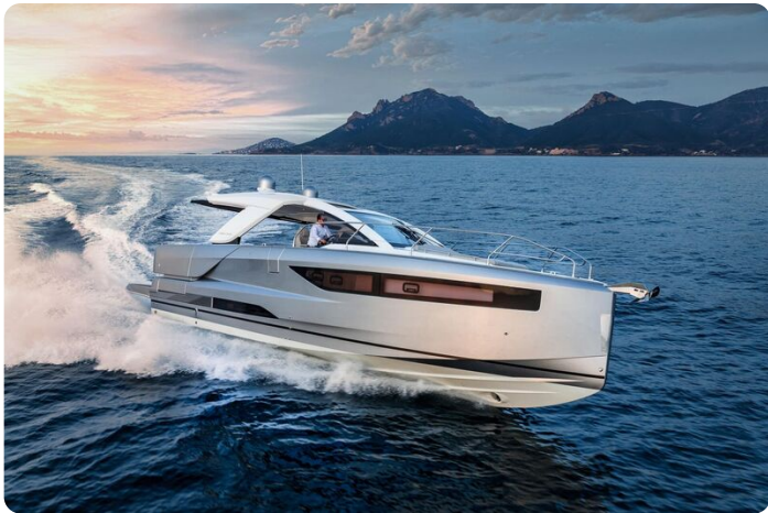
Jeanneau DB 43 inboard - on the water with beautiful sunset