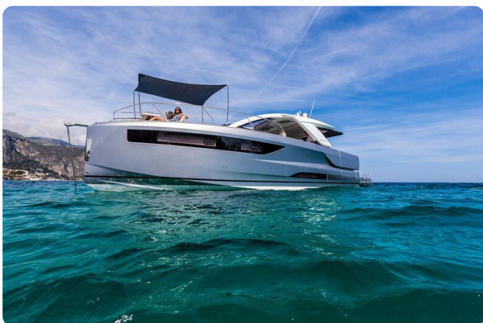
Jeanneau DB 43 inboard - port side hull