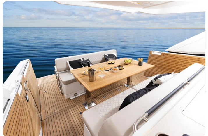
Jeanneau DB 43 inboard - aft cockpit table