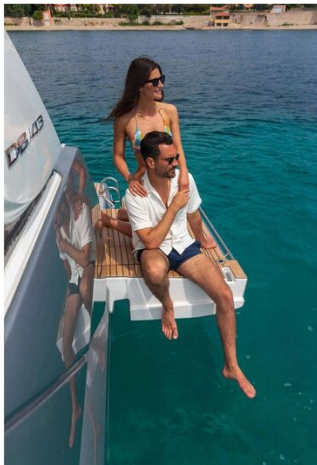
Jeanneau DB 43 inboard - relaxing on the port side terrace