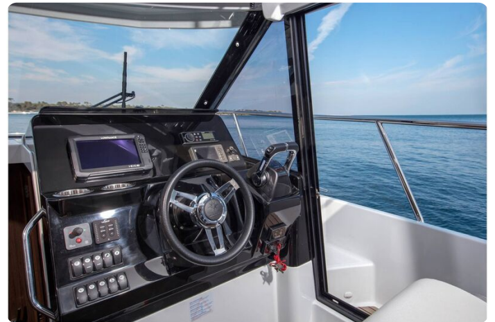
Jeanneau Merry Fisher 1095 - helm position and starboard side door