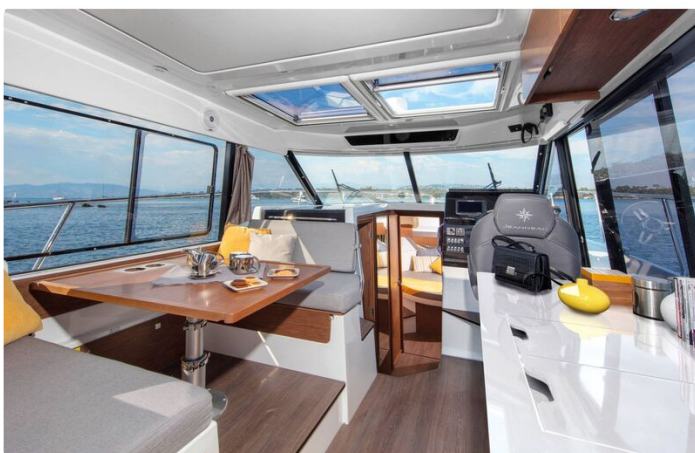
Jeanneau Merry Fisher 1095 - wheelhouse interior