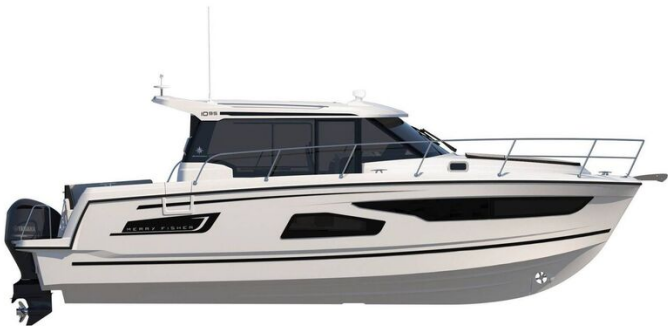
Jeanneau Merry Fisher 1095 - diagram of side view