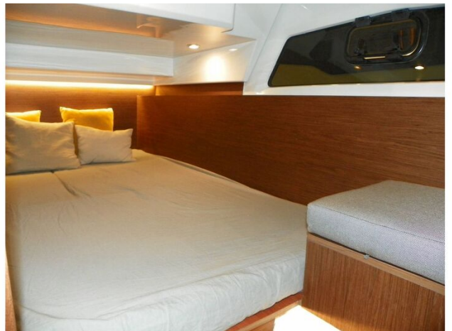
Jeanneau Merry Fisher 1095 - 2nd cabin