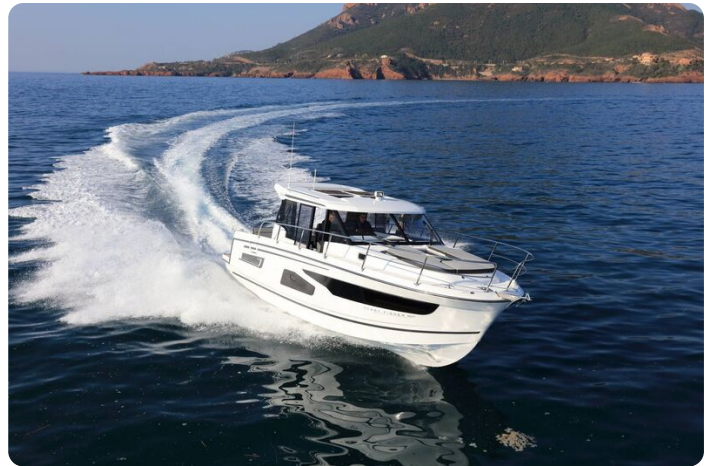
Jeanneau Merry Fisher 1095 - on the water with long wake