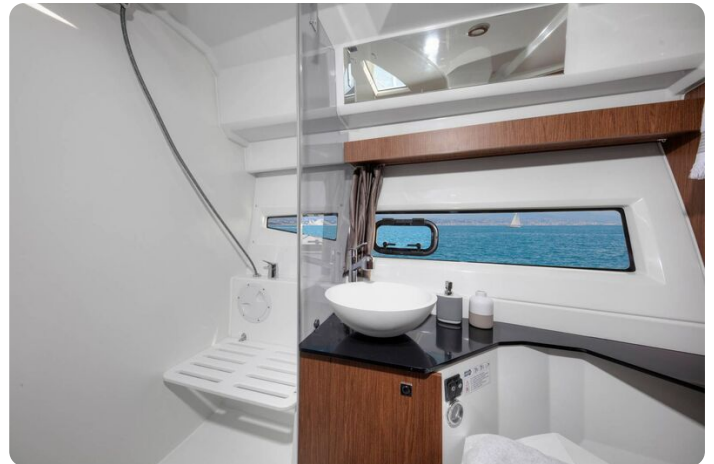
Jeanneau Merry Fisher 1095 - toilet and shower compartment