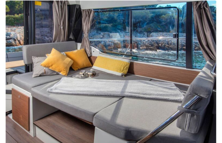
Jeanneau Merry Fisher 1095 - wheelhouse saloon converts to double berth