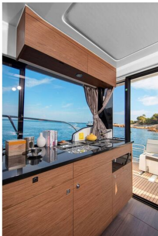
Jeanneau Merry Fisher 1095 - galley area