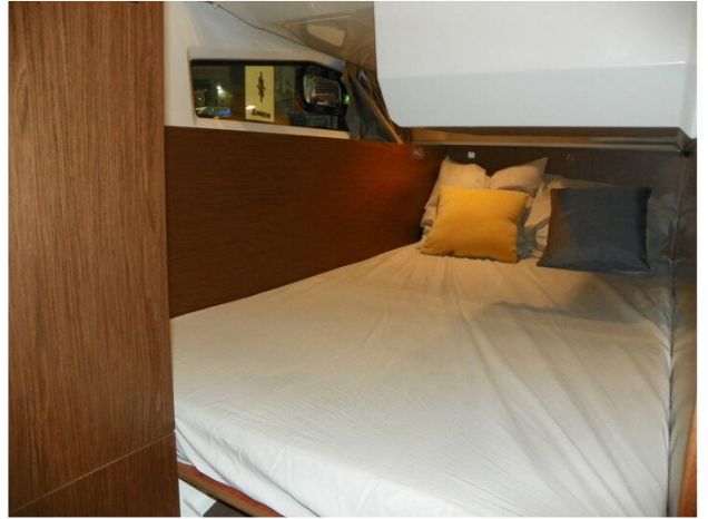
Jeanneau Merry Fisher 1095 - 3rd cabin