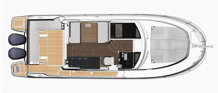
Jeanneau Merry Fisher 1095 - diagram of overhead view