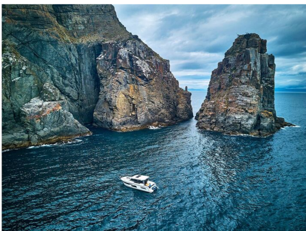
Jeanneau Merry Fisher 1095 - on the water - view from distance