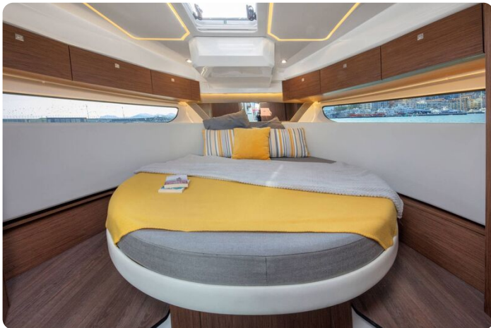
Jeanneau Merry Fisher 1095 - forward cabin