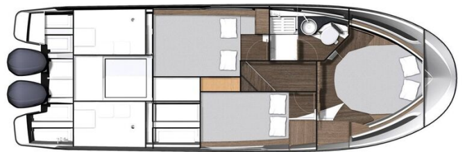
Jeanneau Merry Fisher 1095 - diagram of cabin layout