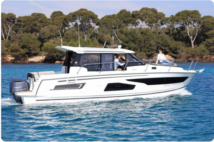
Jeanneau Merry Fisher 1095