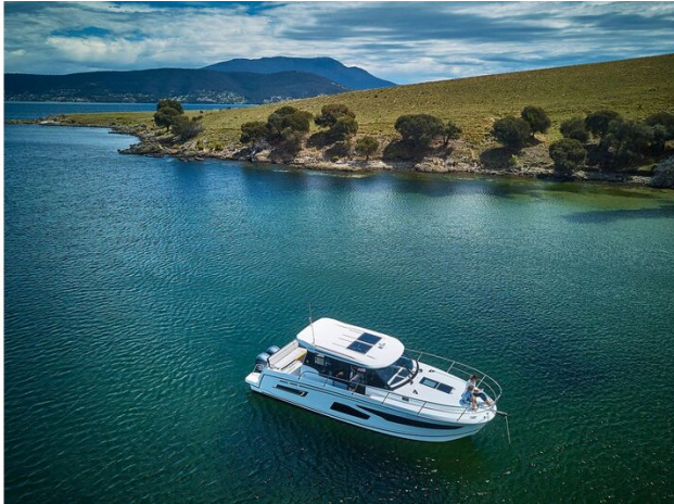
Jeanneau Merry Fisher 1095 - in beautiful surroundings