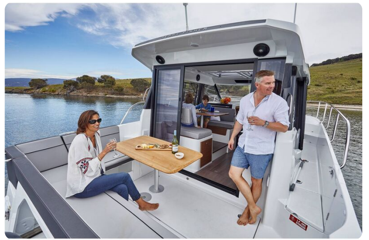
Jeanneau Merry Fisher 1095 - view from cockpit to wheelhouse