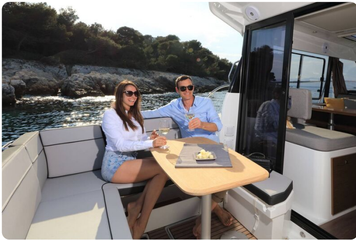
Jeanneau Merry Fisher 1095 - cockpit U shape saloon seating and table