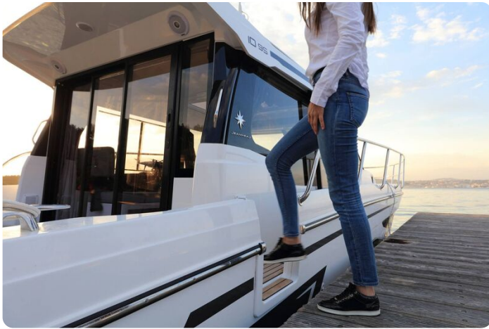
Jeanneau Merry Fisher 1095 - cockpit side gate for easy access from pontoon