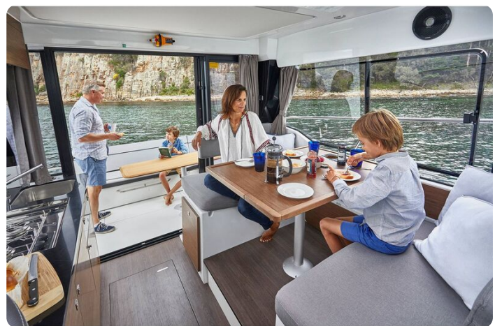
Jeanneau Merry Fisher 1095 - view from wheelhouse to cockpit