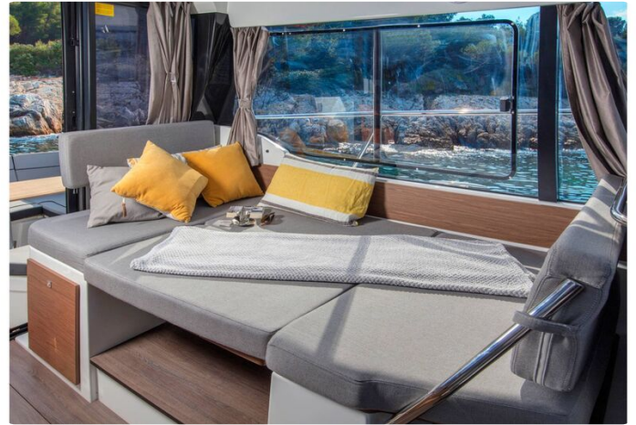
Jeanneau Merry Fisher 1095 - table in wheelhouse converts to berth