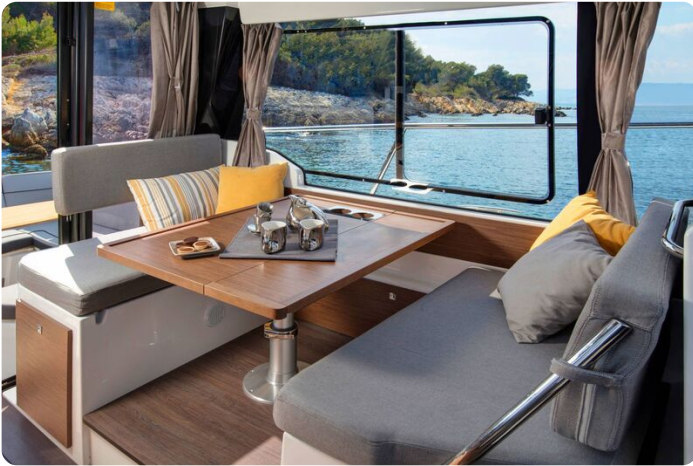
Jeanneau Merry Fisher 1095 - wheelhouse saloon seating and table