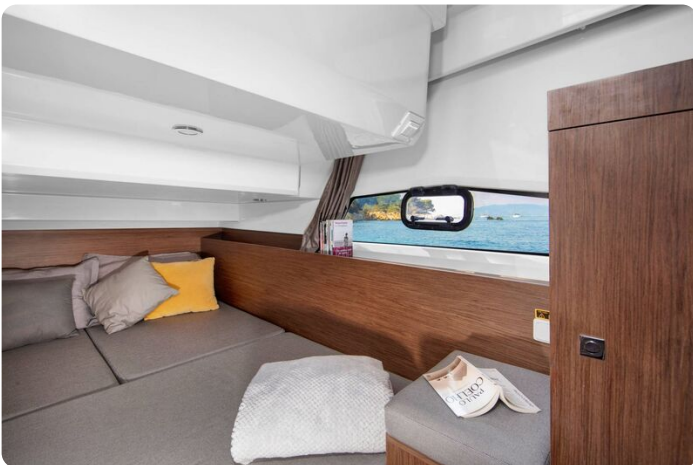
Jeanneau Merry Fisher 1095 - 3rd cabin