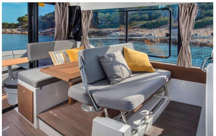
Jeanneau Merry Fisher 1095 - table folds and forward seat converts to co-pilot seat