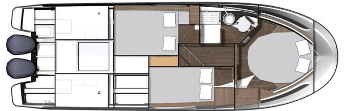
Jeanneau Merry Fisher 1095 - diagram of cabin layout