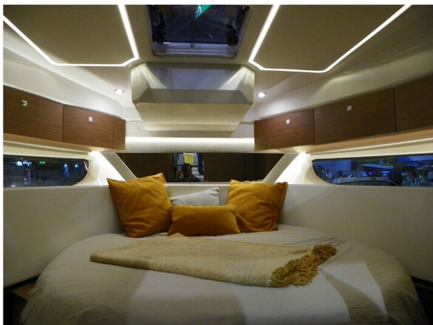
Jeanneau Merry Fisher 1095 - LED lights in the cabins