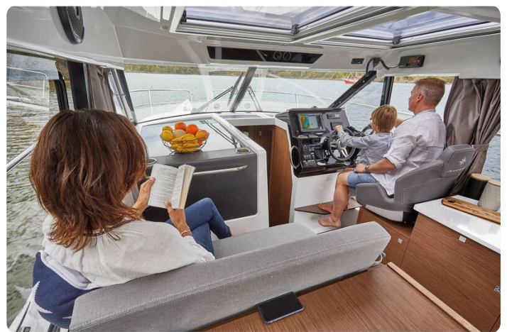
Jeanneau Merry Fisher 1095 - co-pilot seat and pilot seat