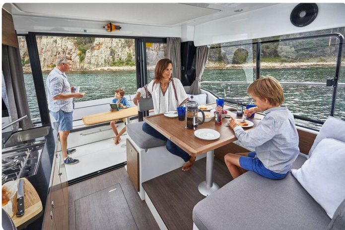
Jeanneau Merry Fisher 1095 - view from wheelhouse to cockpit