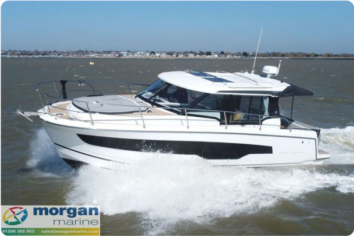
Merry Fisher 1095 - main