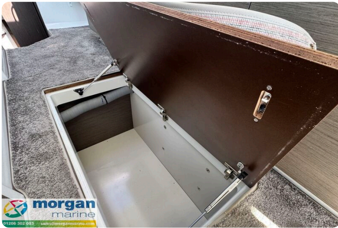
Merry Fisher 1095 - storage