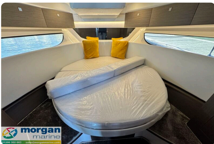
Merry Fisher 1095 - main berth