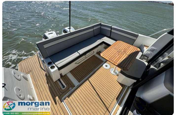
Merry Fisher 1095 - table