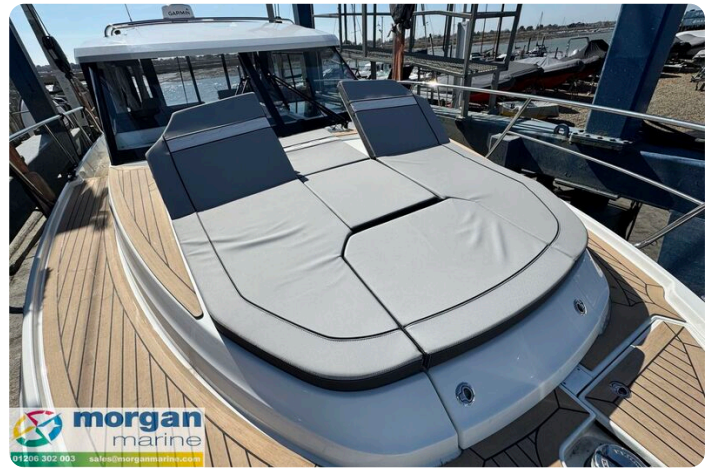
Merry Fisher 1095 - seun cushions front