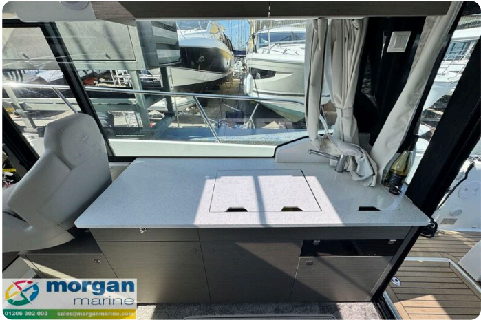
Merry Fisher 1095 - galley