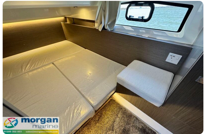
Merry Fisher 1095 - sec berth