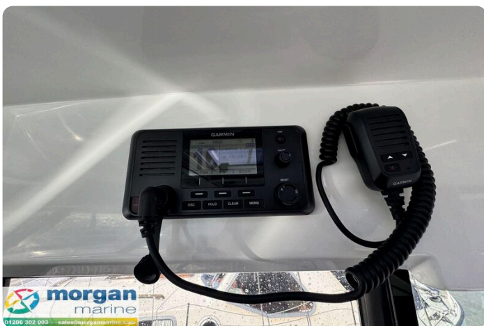
Merry Fisher 1095 - VHF