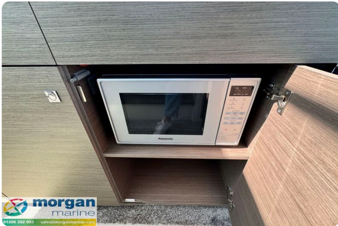
Merry Fisher 1095 - microwave