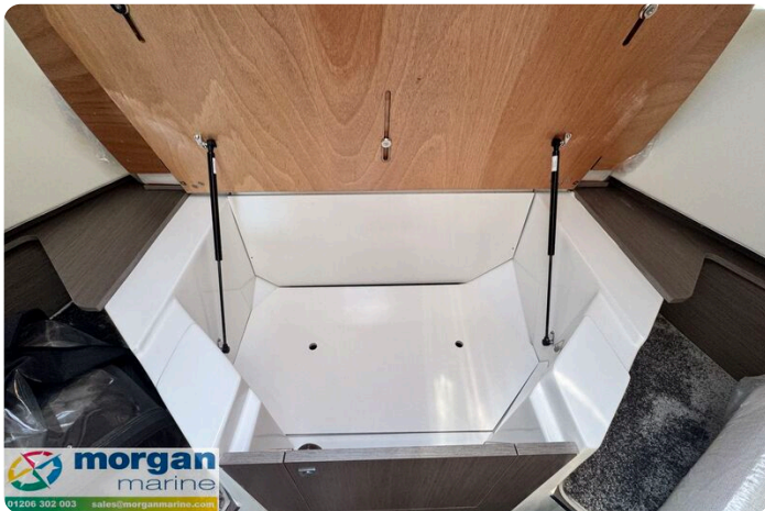
Merry Fisher 1095 - storage