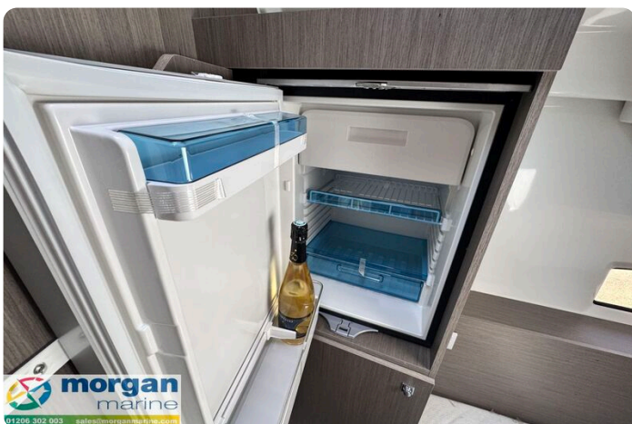
Merry Fisher 1095 - fridge