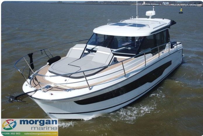
Merry Fisher 1095 - sun-pads