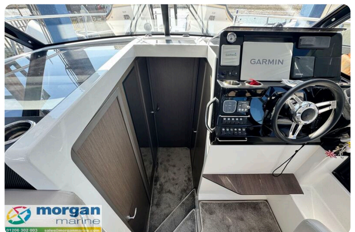
Merry Fisher 1095 - stairs