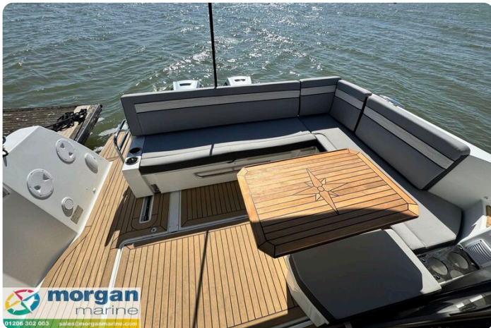
Merry Fisher 1095 - cockpit