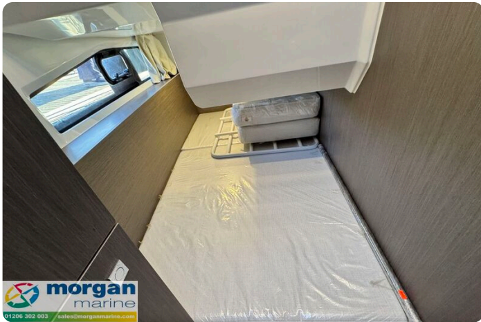
Merry Fisher 1095 - third berth