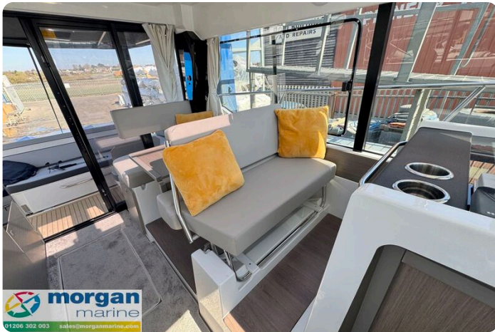
Merry Fisher 1095 - co pilot seat