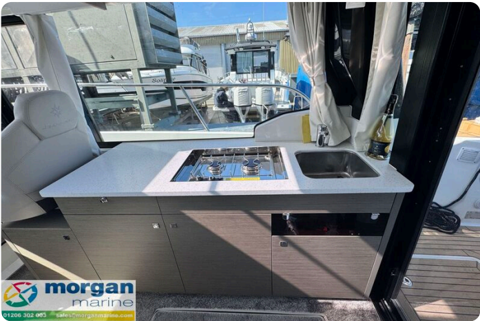
Merry Fisher 1095 - cooker