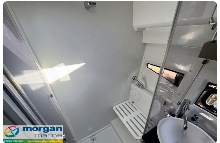
Merry Fisher 1095 - shower