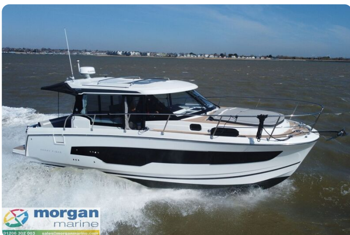
Merry Fisher 1095 - speed