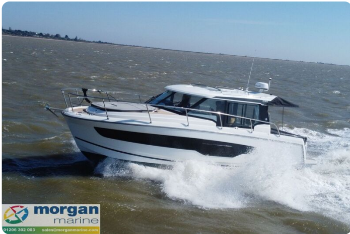
Merry Fisher 1095 - railings