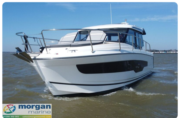
Merry Fisher 1095 - cleats