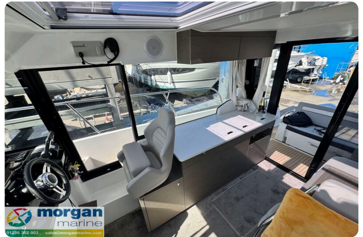
Merry Fisher 1095 - pilot seat