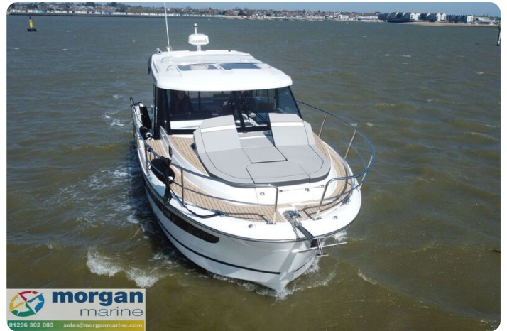
Merry Fisher 1095 - bow seating