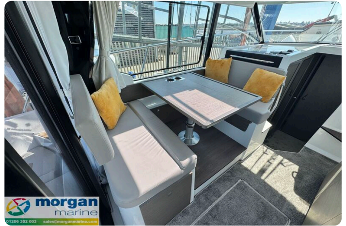
Merry Fisher 1095 - table