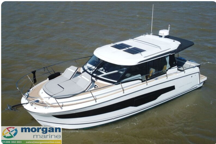
Merry Fisher 1095 - bow view