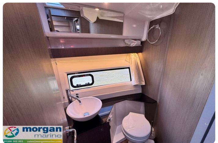
Merry Fisher 1095 - toilet