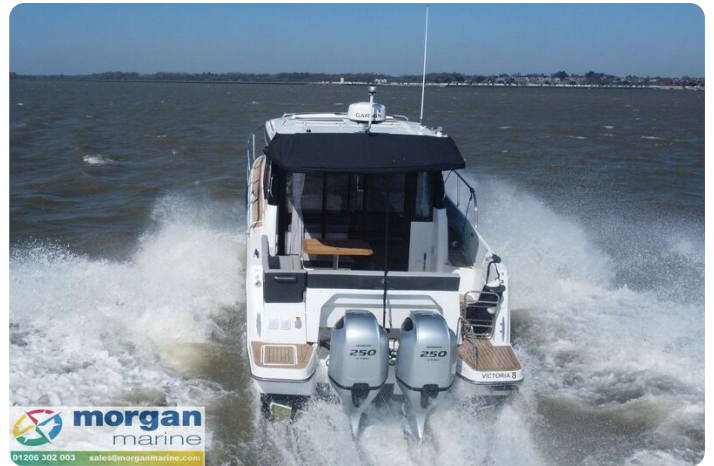
Merry Fisher 1095 - honda