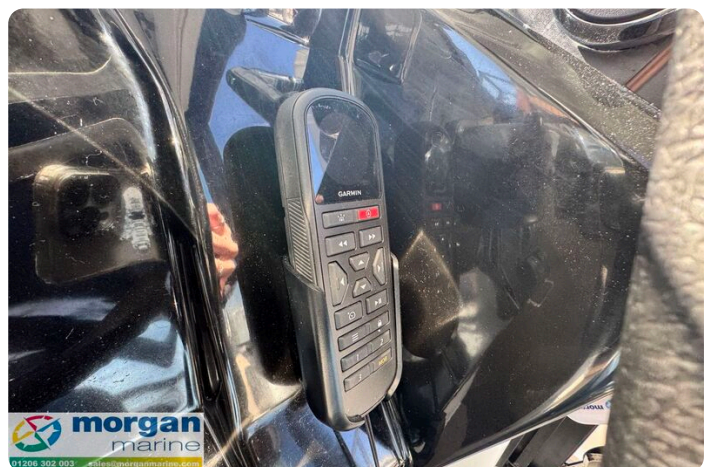
Merry Fisher 1095 - radio