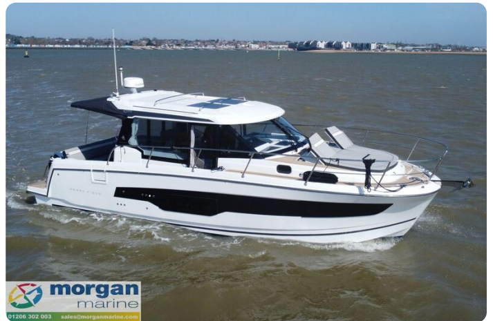
Merry Fisher 1095 - calm