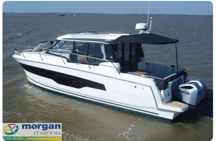
Merry Fisher 1095 - stern