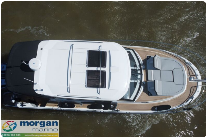
Merry Fisher 1095 - roof bars