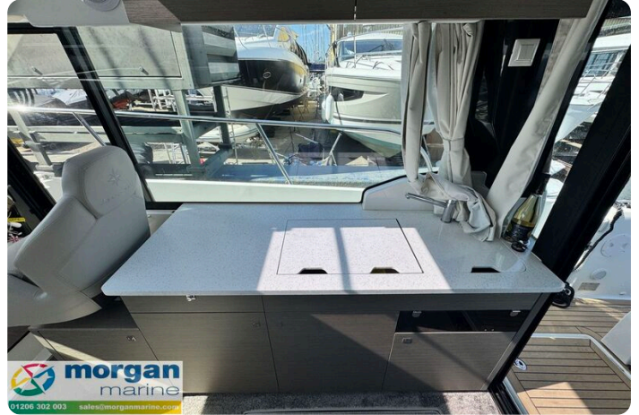
Merry Fisher 1095 - galley