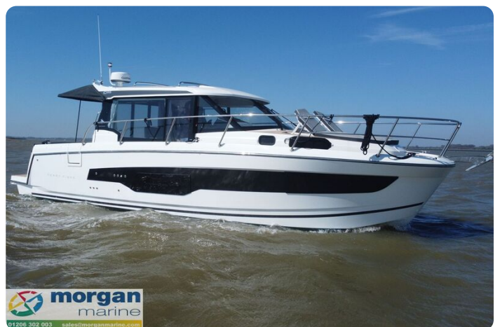
Merry Fisher 1095 - bow view