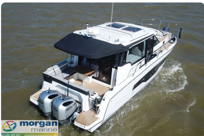
Merry Fisher 1095 - canopy