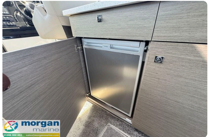
Merry Fisher 1095 - fridge