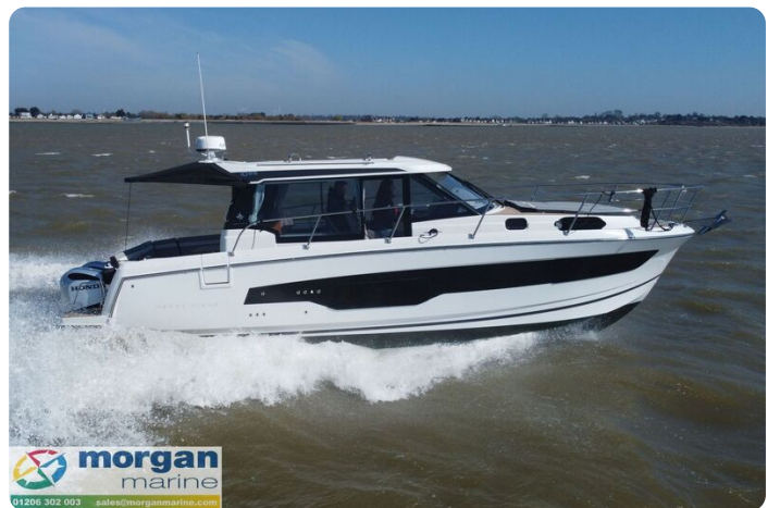
Merry Fisher 1095 - action