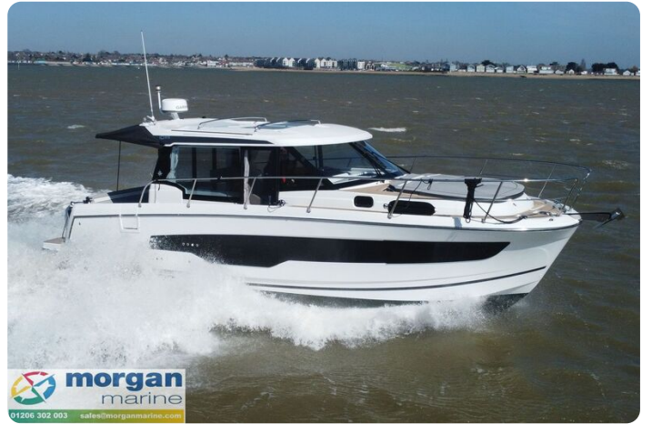
Merry Fisher 1095 - fenders