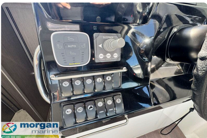
Merry Fisher 1095 - bow thruster