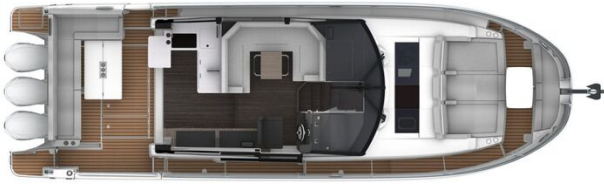
Jeanneau Merry Fisher 1295 Coupe - diagram of deck layout and wheelhouse interior