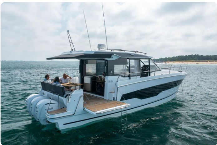
Jeanneau Merry Fisher 1295 Coupe - aft cockpit and starboard side terrace