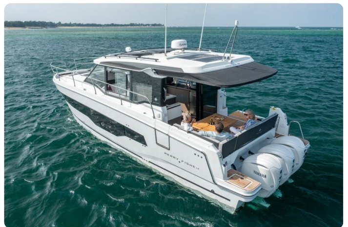
Jeanneau Merry Fisher 1295 Coupe - aft port side