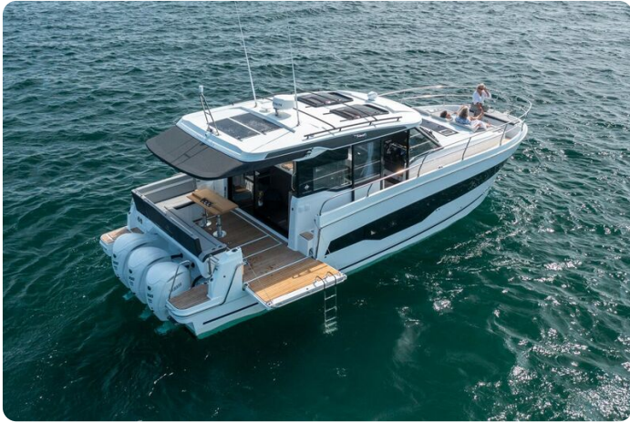
Jeanneau Merry Fisher 1295 Coupe