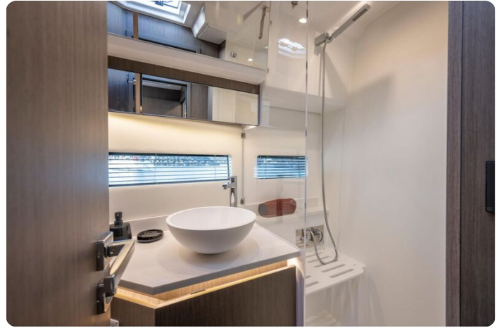
Jeanneau Merry Fisher 1295 Coupe - wash basin and shower