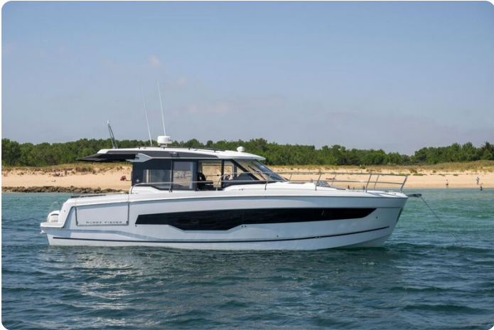
Jeanneau Merry Fisher 1295 Coupe - on the water starboard side