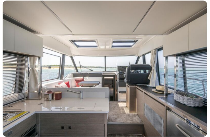
Jeanneau Merry Fisher 1295 Coupe - starboard side and aft galley