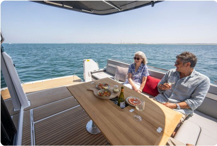
Jeanneau Merry Fisher 1295 Coupe - aft cockpit seating and table