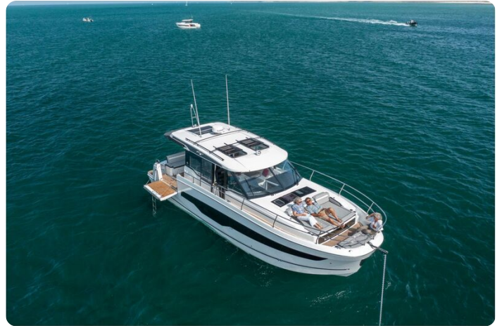
Jeanneau Merry Fisher 1295 Coupe - overhead view from bow