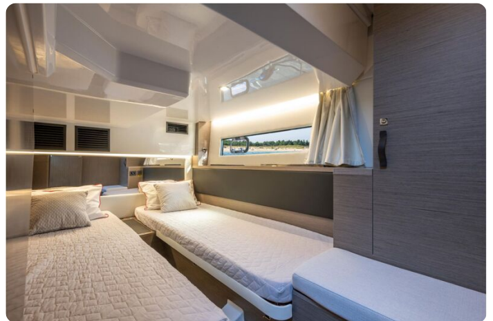
Jeanneau Merry Fisher 1295 Coupe - 2nd cabin