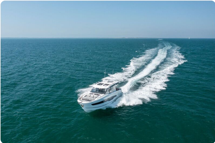
Jeanneau Merry Fisher 1295 Coupe - boat moving through the water