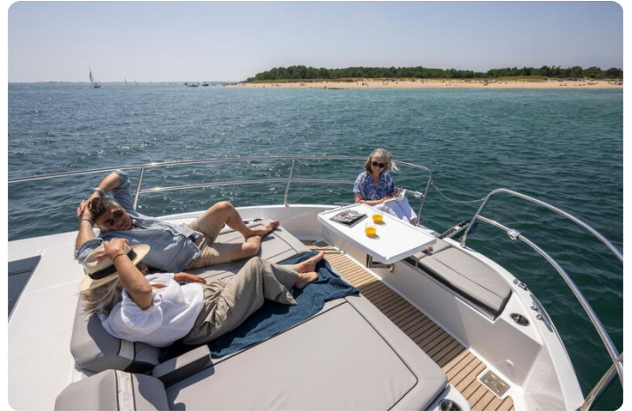
Jeanneau Merry Fisher 1295 Coupe - bow cockpit seating