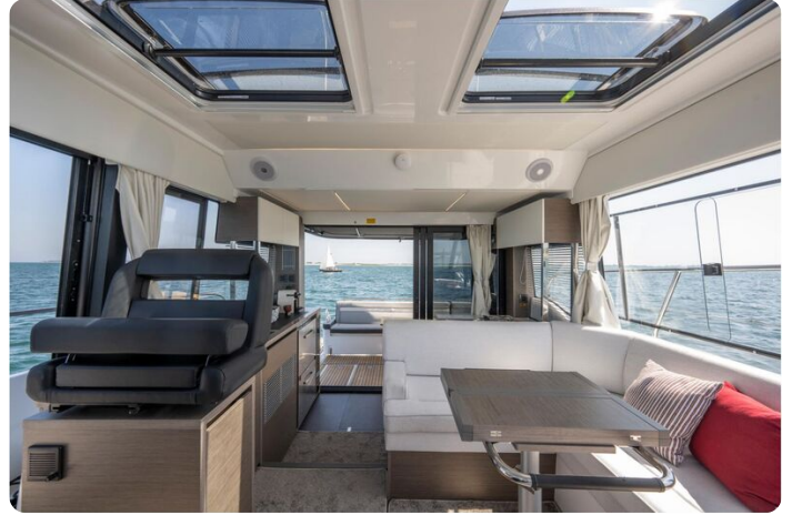
Jeanneau Merry Fisher 1295 Coupe - view from wheelhouse towards aft