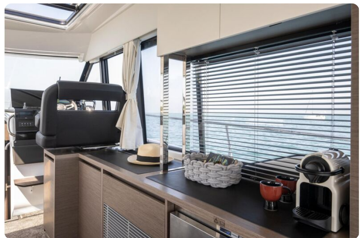
Jeanneau Merry Fisher 1295 Coupe - starboard side galley