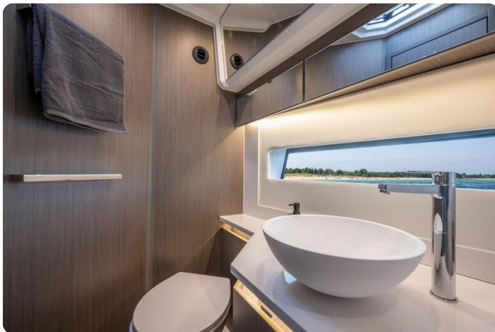
Jeanneau Merry Fisher 1295 Coupe - toilet and wash basin