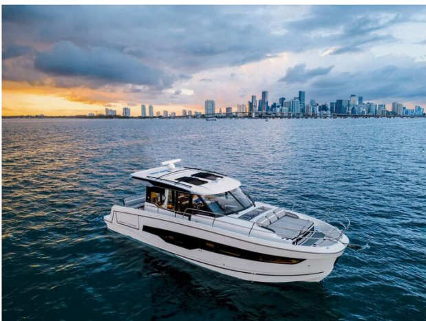
Jeanneau Merry Fisher 1295 Coupe - on the water