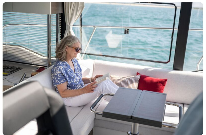
Jeanneau Merry Fisher 1295 Coupe - C shape port side seating