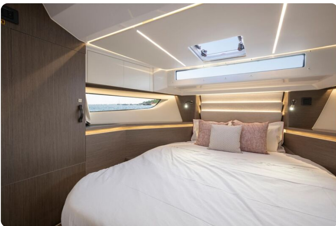
Jeanneau Merry Fisher 1295 Coupe - forward cabin view towards port