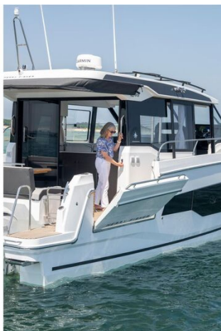
Jeanneau Merry Fisher 1295 Coupe - electric folding terrace in operation