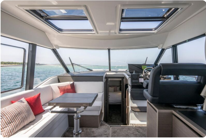
Jeanneau Merry Fisher 1295 Coupe - wheelhouse interior with port side saloon and starboard side galley