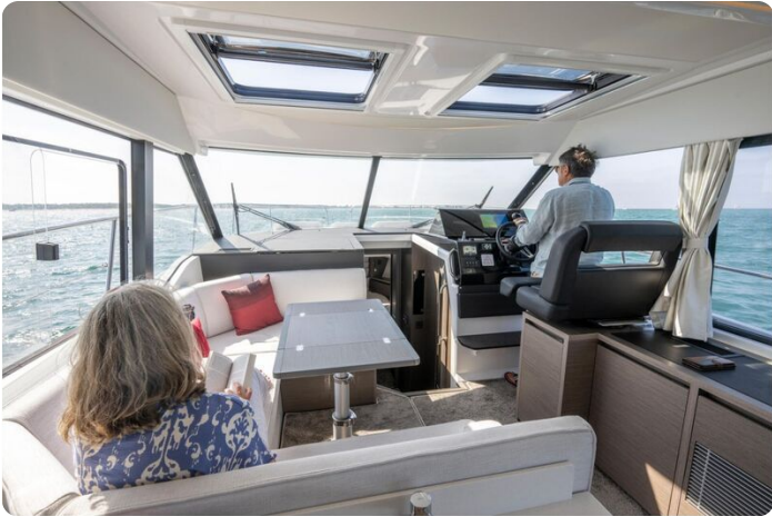
Jeanneau Merry Fisher 1295 Coupe - port side seating and starboard side helm position