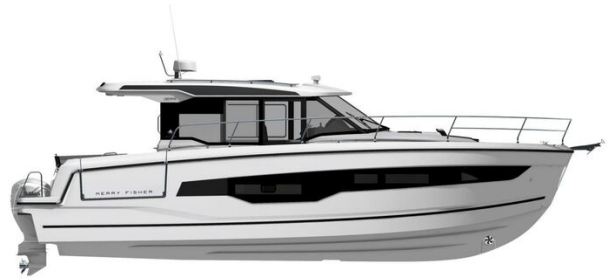
Jeanneau Merry Fisher 1295 Coupe - diagram of side view