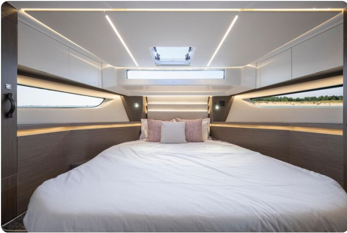
Jeanneau Merry Fisher 1295 Coupe - forward cabin