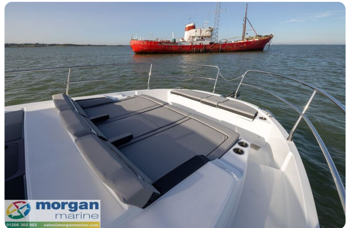
Jeanneau Merry Fisher 1295 Flybridge - bow sun loungers