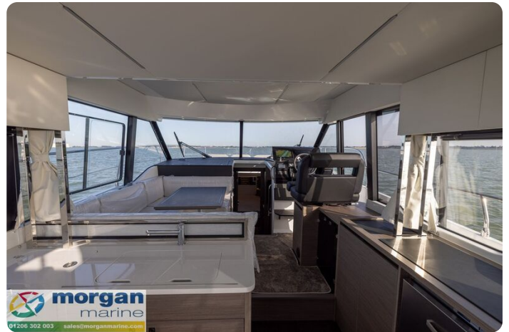
Jeanneau Merry Fisher 1295 Flybridge - wheelhouse saloon with galley