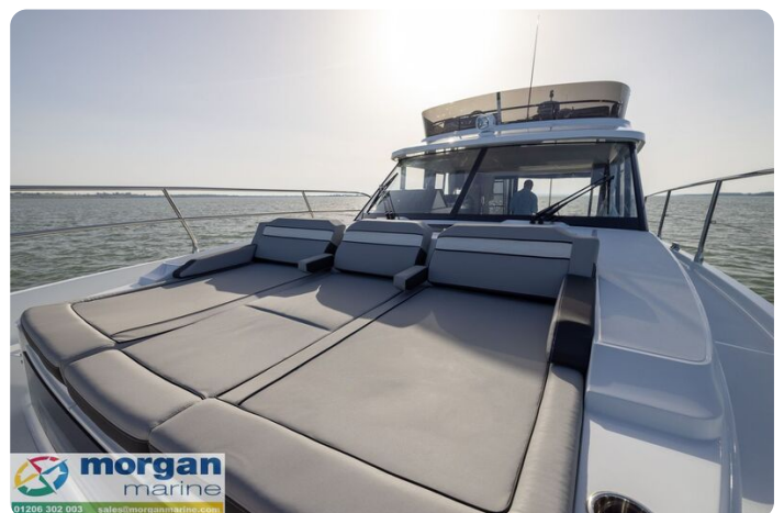
Jeanneau Merry Fisher 1295 Flybridge - bow sun lounge - view towards flybridge