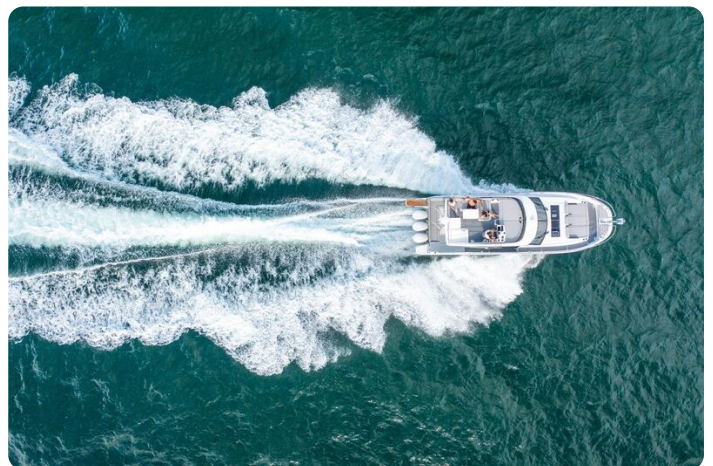
Jeanneau Merry Fisher 1295 Flybridge - on the water overhead view