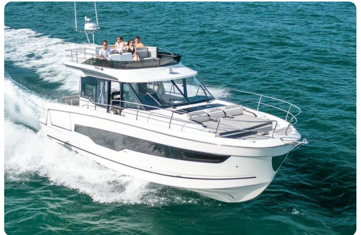
Jeanneau Merry Fisher 1295 Flybridge