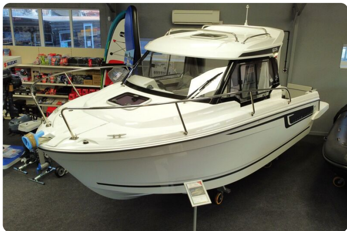
Jeanneau Merry Fisher 605 - in stock at Morgan Marine - view towards bow