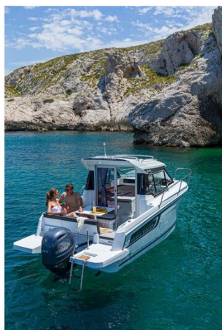
Jeanneau Merry Fisher 605 - in beautiful surroundings