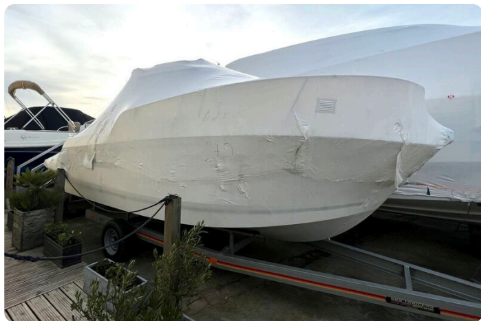
Jeanneau Merry Fisher 605 - still wrapped up