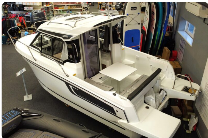
Jeanneau Merry Fisher 605 - in stock at Morgan Marine - view towards cockpit