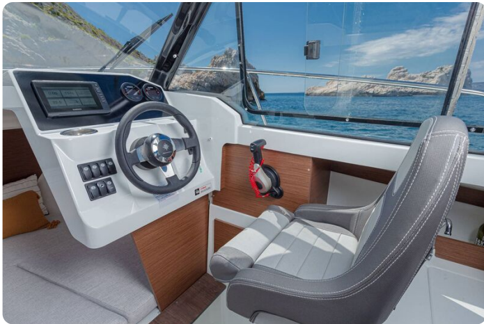
Jeanneau Merry Fisher 605 - helm position