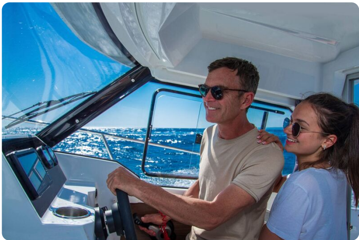
Jeanneau Merry Fisher 605 - starboard side window at helm