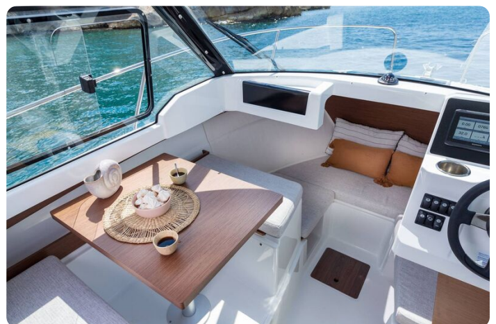
Jeanneau Merry Fisher 605 - port side saloon table and forward berth