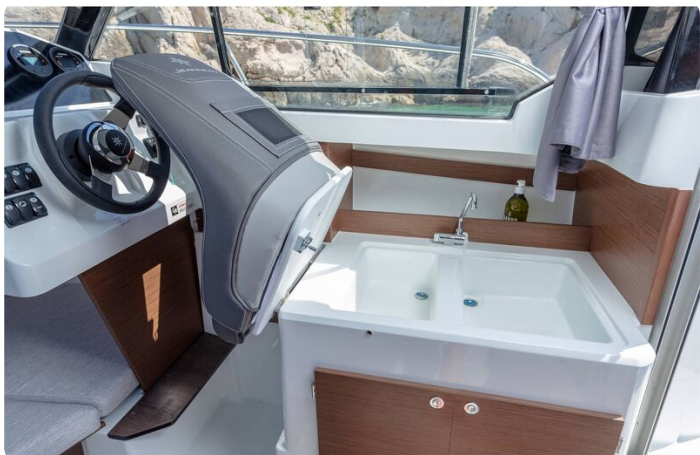
Jeanneau Merry Fisher 605 - helm seat folds forward for access to galley