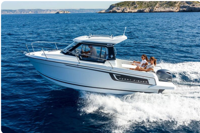
Jeanneau Merry Fisher 605 - port side view on the water