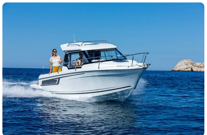
Jeanneau Merry Fisher 605 - on the water