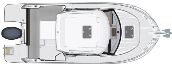
Jeanneau Merry Fisher 605 - diagram of overhead view