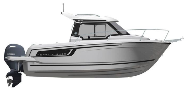
Jeanneau Merry Fisher 605 - diagram of side view