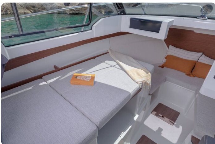
Jeanneau Merry Fisher 605 - saloon table converts to berth