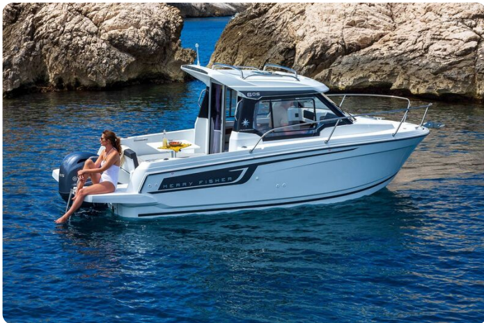
Jeanneau Merry Fisher 605