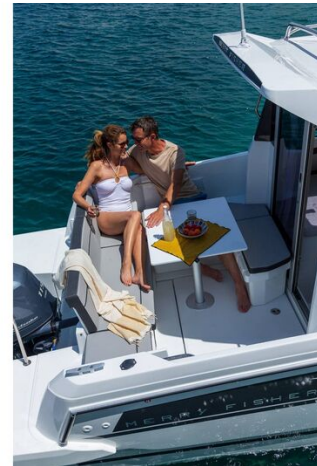
Jeanneau Merry Fisher 605 - relaxing in the U-shaped cockpit saloon