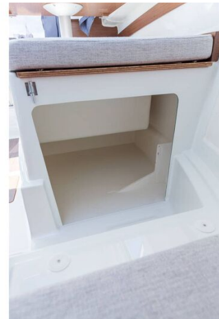
Jeanneau Merry Fisher 605 - storage under co-pilot seat