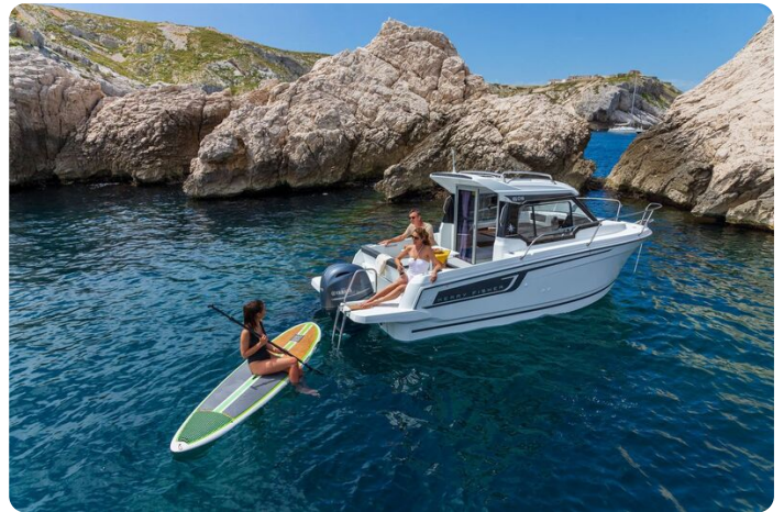
Jeanneau Merry Fisher 605 - fun on the water with a paddleboard