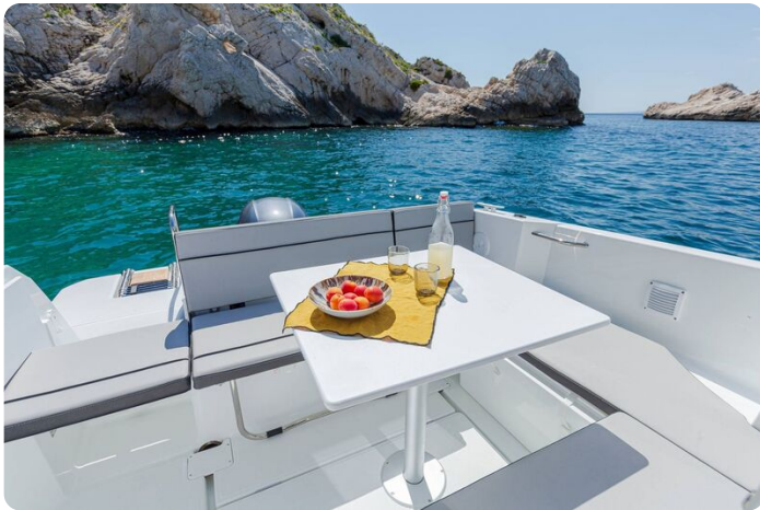
Jeanneau Merry Fisher 605 - view towards aft