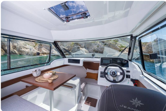
Jeanneau Merry Fisher 605 - wheelhouse with helm position, saloon and roof hatch