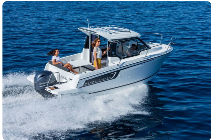
Jeanneau Merry Fisher 605 - relaxing on the water