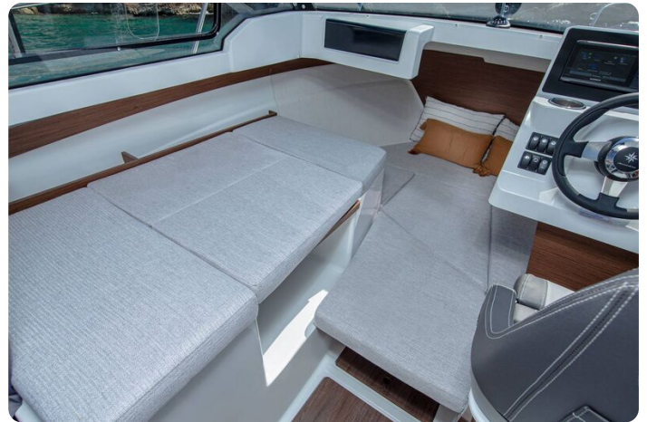
Jeanneau Merry Fisher 605 - all cushions in wheelhouse for two double berths