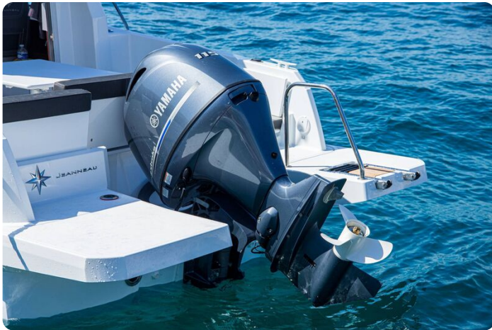
Jeanneau Merry Fisher 605 - transom with swim platforms and outboard engine