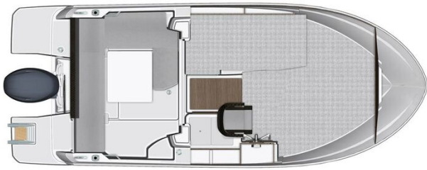
Jeanneau Merry Fisher 605 - diagram of cockpit and berths layout