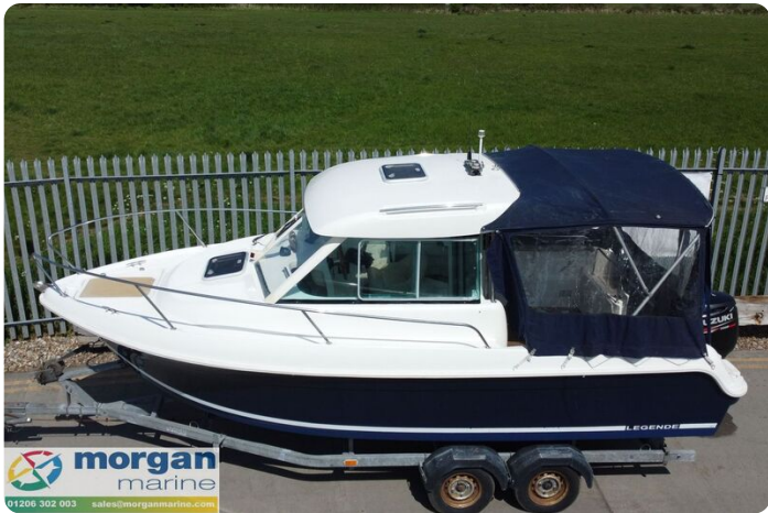
Merry Fisher 625 - stainless steel