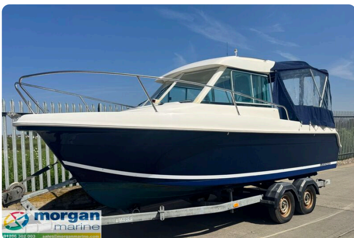
Merry Fisher 625 - Main