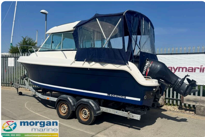
Merry Fisher 625 - canopy