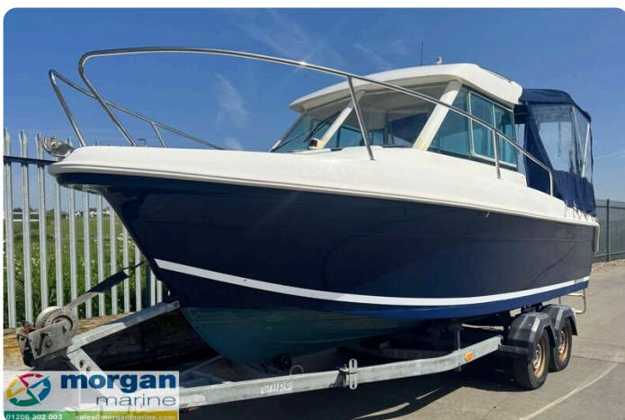
Merry Fisher 625 - railings