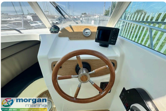
Merry Fisher 625 - wheel