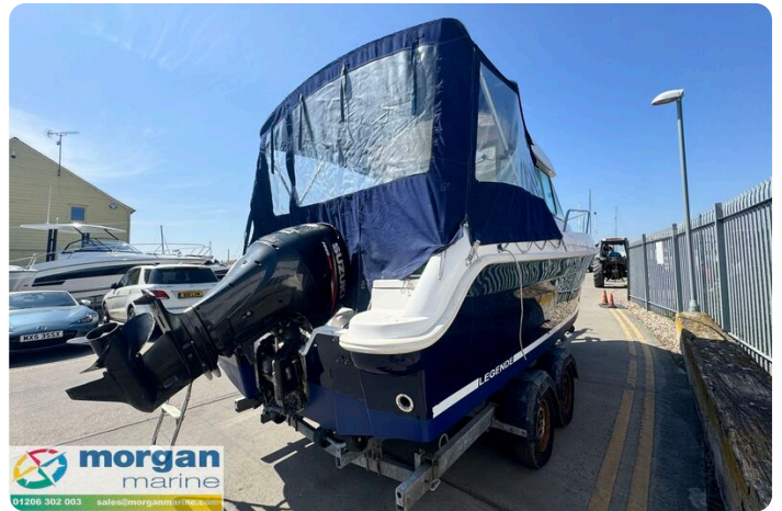
Merry Fisher 625 - bathing platform