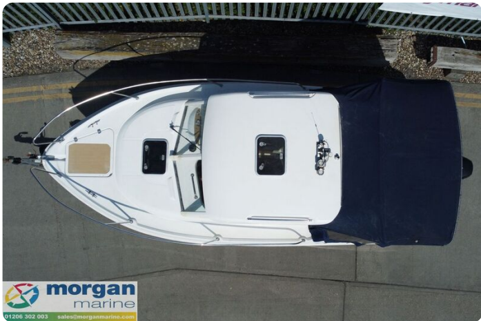
Merry Fisher 625 - top view