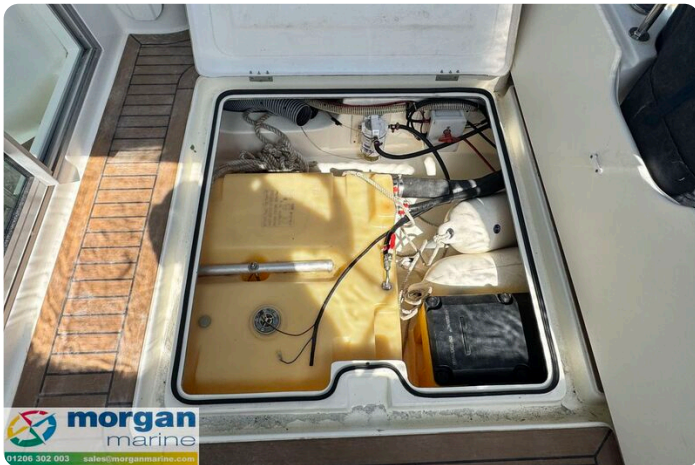
Merry Fisher 625 - fuel tank