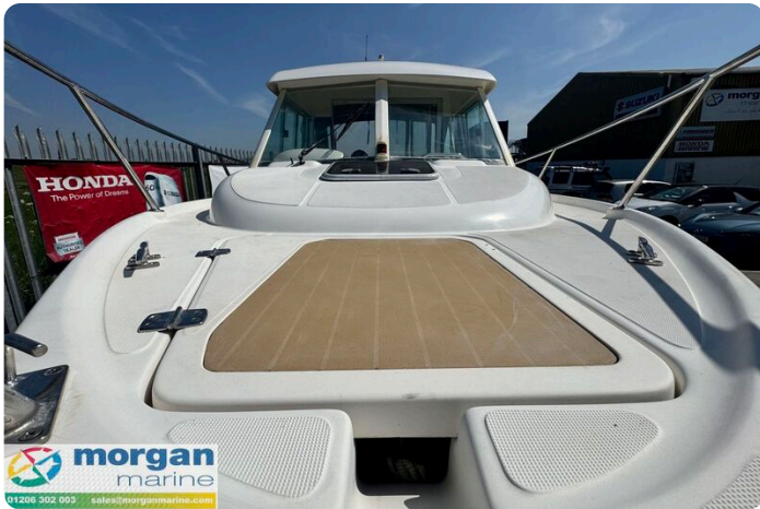
Merry Fisher 625 - hatch