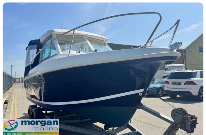
Merry Fisher 625 - bow view