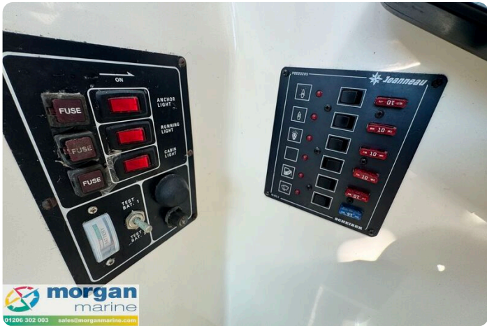
Merry Fisher 625 - Isolators