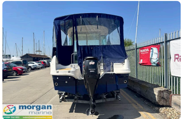
Merry Fisher 625 - engine