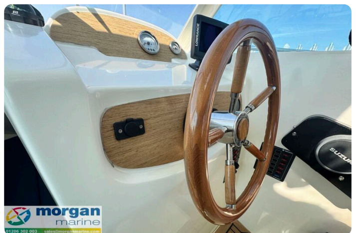
Merry Fisher 625 - wheel