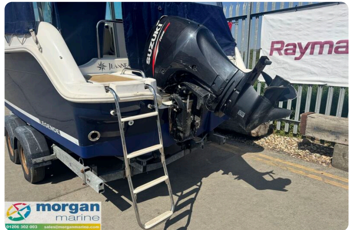
Merry Fisher 625 - ladder