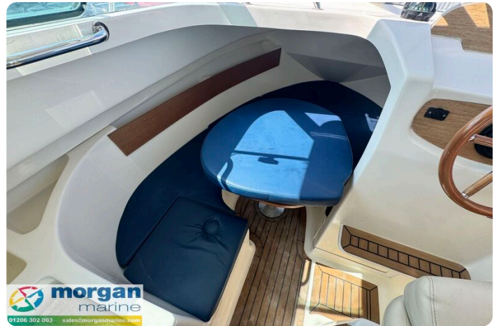
Merry Fisher 625 - berth 2