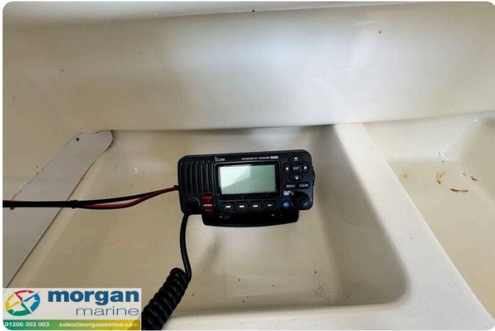
Merry Fisher 625 - VHF