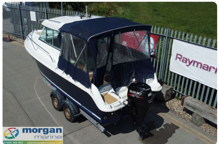
Merry Fisher 625 - overview