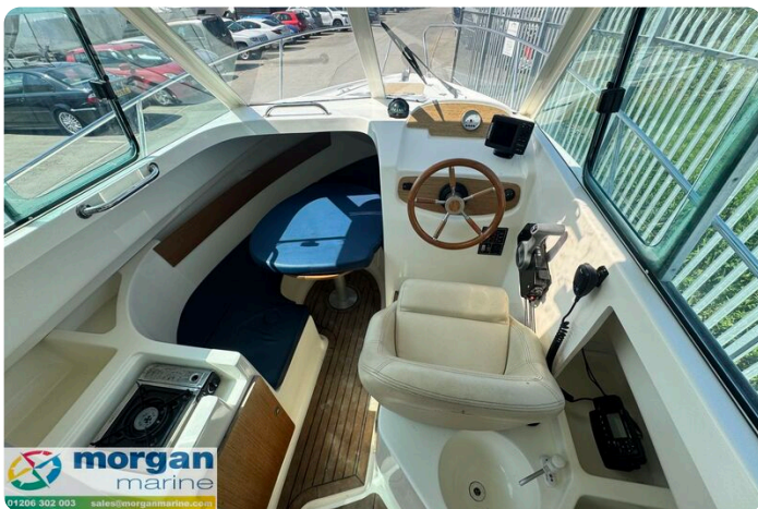
Merry Fisher 625 - saloon