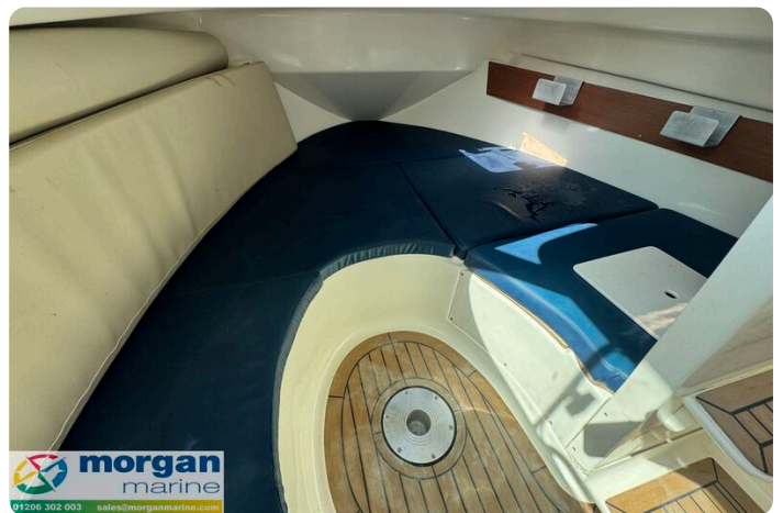
Merry Fisher 625 - berth