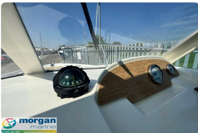
Merry Fisher 625 - compass