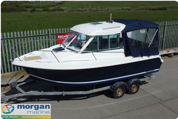
Merry Fisher 625 - window