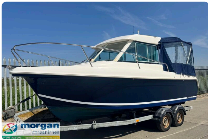
Merry Fisher 625 - side