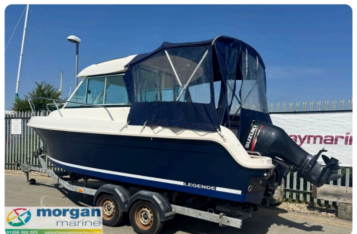
Merry Fisher 625 - back