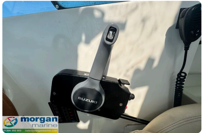
Merry Fisher 625 - control