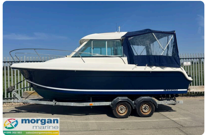
Merry Fisher 625 - side