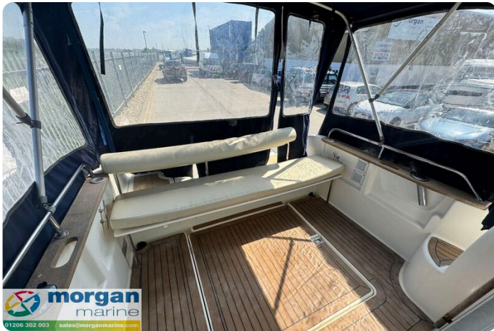
Merry Fisher 625 - back seating