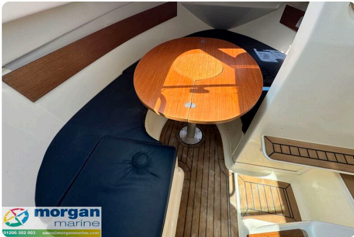
Merry Fisher 625 - table