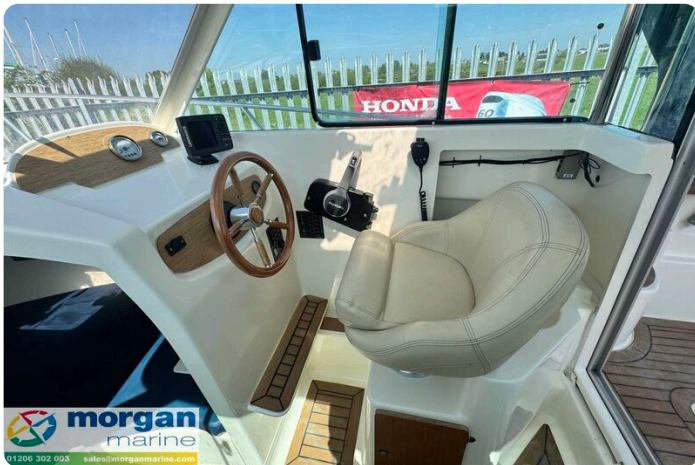
Merry Fisher 625 - pilot seat