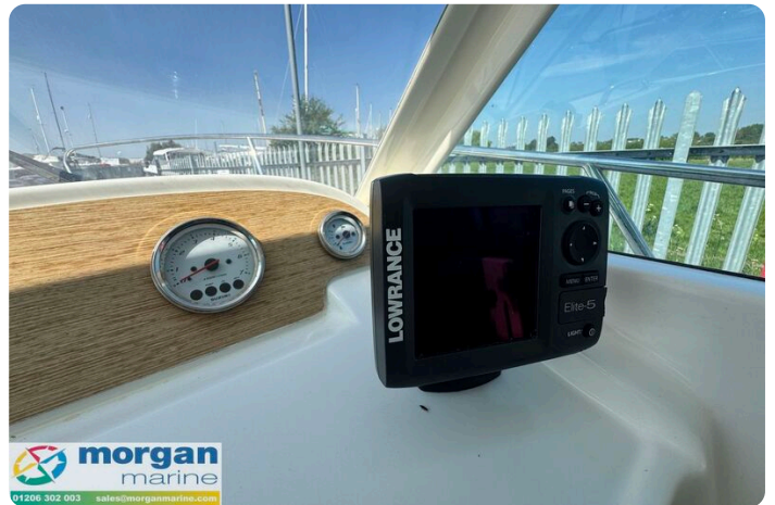
Merry Fisher 625 - plotter