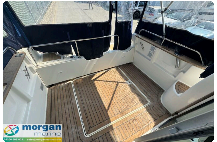
Merry Fisher 625 - deck