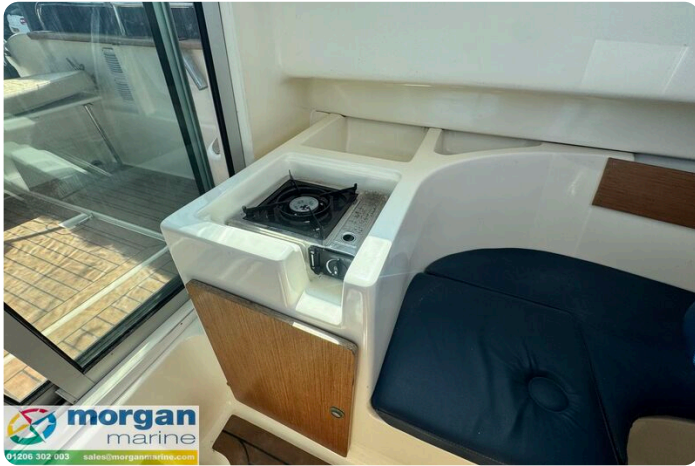
Merry Fisher 625 - cooker