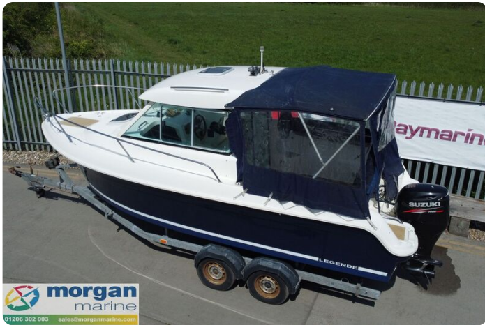
Merry Fisher 625 - overview