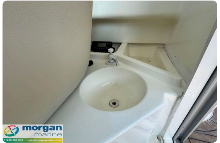
Merry Fisher 625 - sink