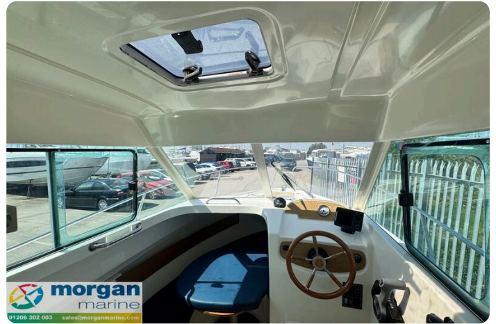
Merry Fisher 625 - hatch