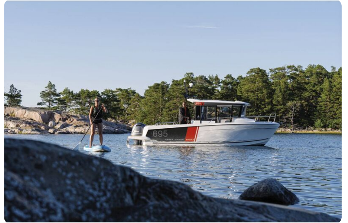
Jeanneau Merry Fisher 695 Sport - great for fun and adventures on the water