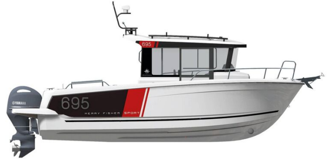
Jeanneau Merry Fisher 695 Sport - diagram of side view