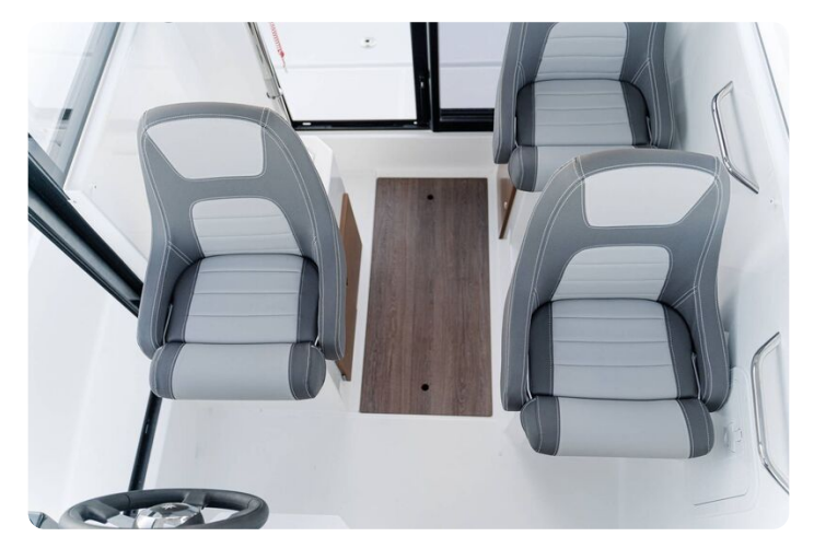
Jeanneau Merry Fisher 695 Sport - render of wheelhouse seating