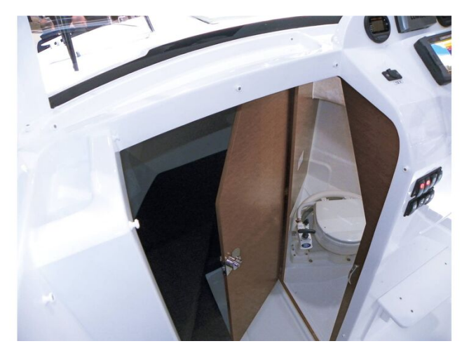
Jeanneau Merry Fisher 695 Sport - toilet compartment

Jeanneau Merry Fisher 695 Sport - diagram of side view