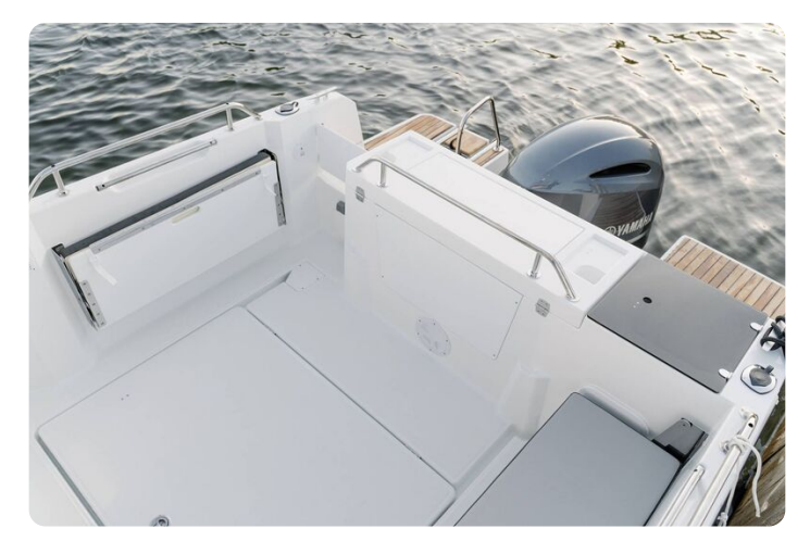
Jeanneau Merry Fisher 695 Sport - large aft cockpit