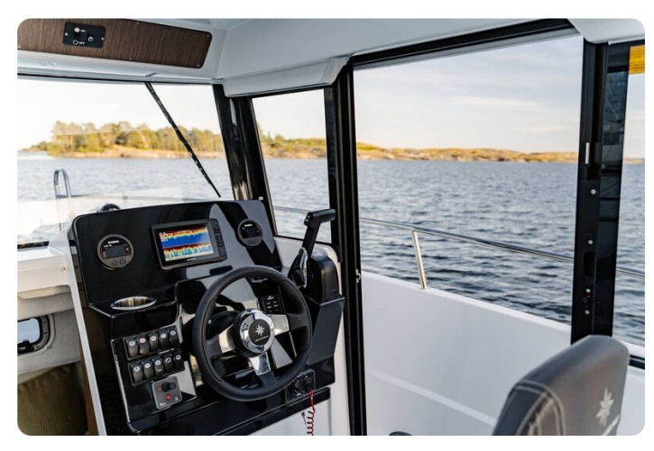
Jeanneau Merry Fisher 695 Sport - helm position and side door