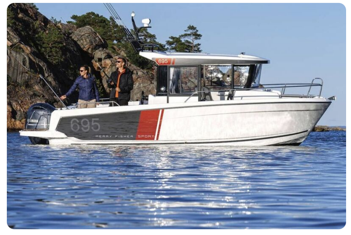
Jeanneau Merry Fisher 695 Sport