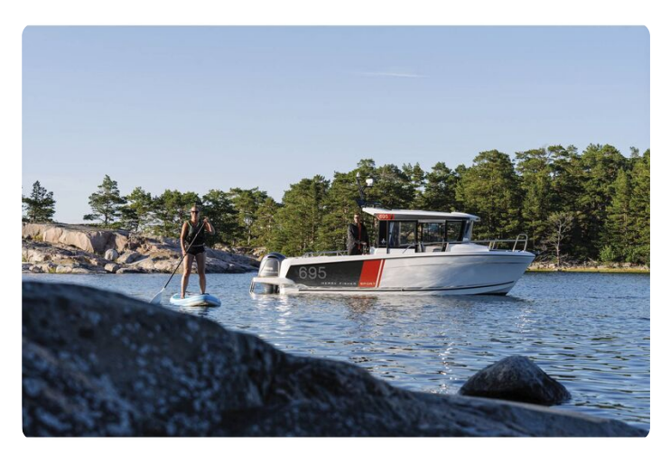
Jeanneau Merry Fisher 695 Sport - great for fun and adventures on the water