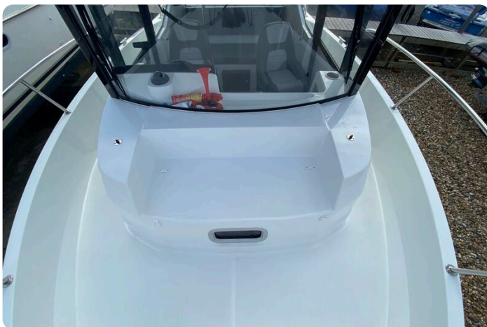
Jeanneau Merry Fisher 795 Marlin-front-seating