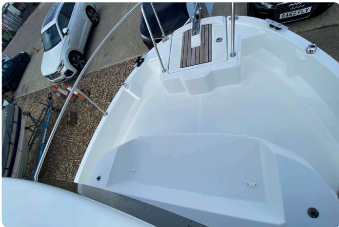
Jeanneau Merry Fisher 795 Marlin-Front