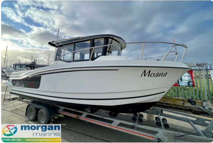
Jeanneau Merry Fisher 795 Marlin - starboard side