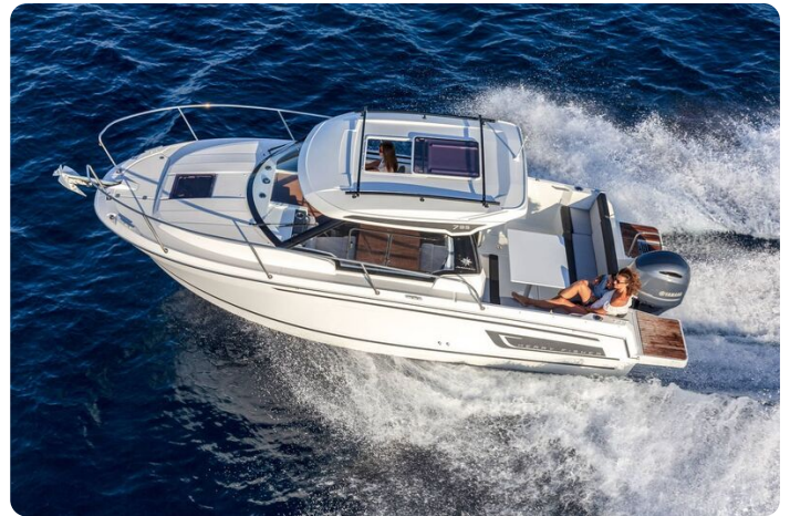
Jeanneau Merry Fisher 795 Series 2 - overhead view from port side