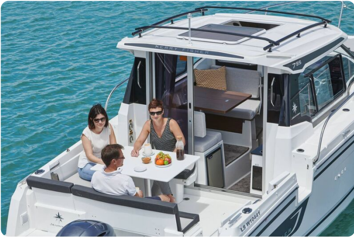
Jeanneau Merry Fisher 795 Series 2 - aft cockpit saloon with table