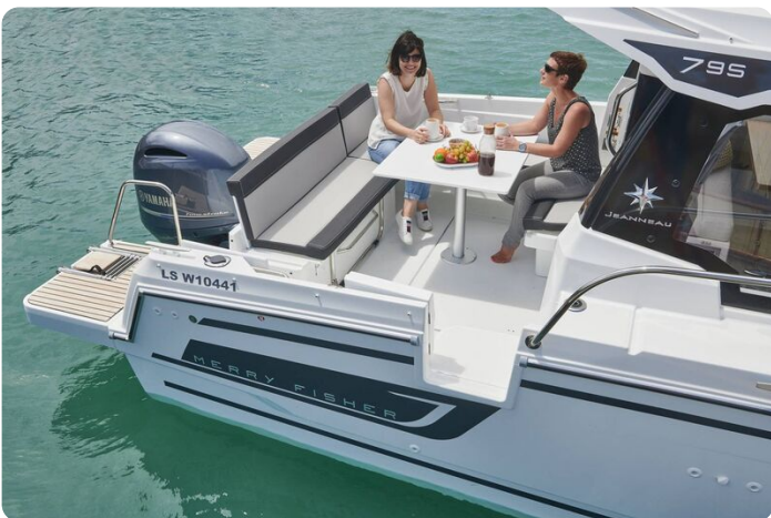
Jeanneau Merry Fisher 795 Series 2 - view into cockpit saloon through side gate