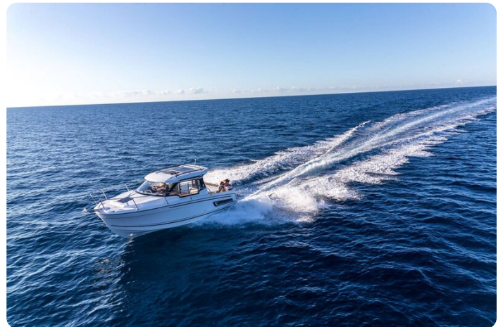
Jeanneau Merry Fisher 795 Series 2 - speeding through the water with a large wake