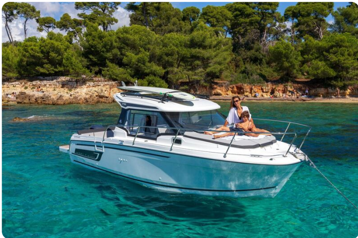
Jeanneau Merry Fisher 795 Series 2 - bow sun lounger