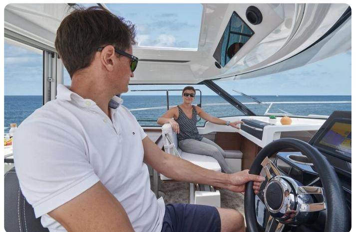
Jeanneau Merry Fisher 795 Series 2 - helm seat and co-pilot seat