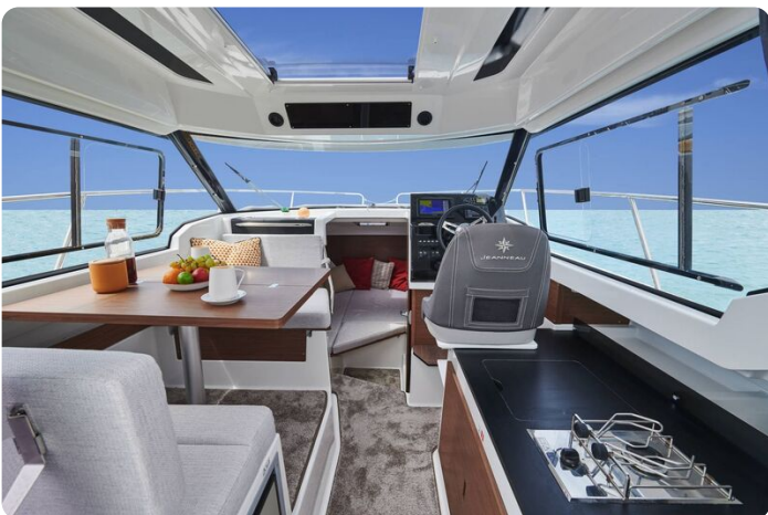
Jeanneau Merry Fisher 795 Series 2 - wheelhouse with roof hatch, port side saloon and starboard side galley