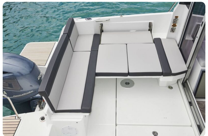
Jeanneau Merry Fisher 795 Series 2 - U-shape cockpit saloon seating with infill for sun lounger