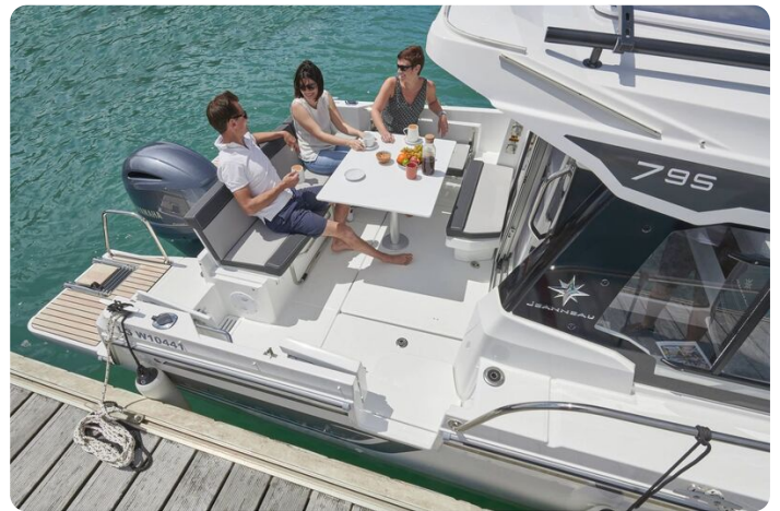
Jeanneau Merry Fisher 795 Series 2 - aft cockpit saloon with table and side gate