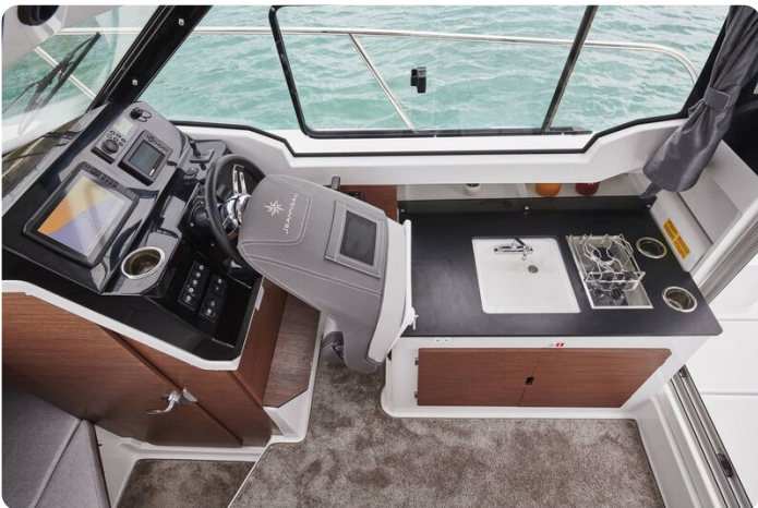
Jeanneau Merry Fisher 795 Series 2 - helm seat folds forward for easy access to galley