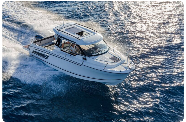
Jeanneau Merry Fisher 795 Series 2 - overhead view towards bow with cabin deck hatch and wheelhouse roof hatch