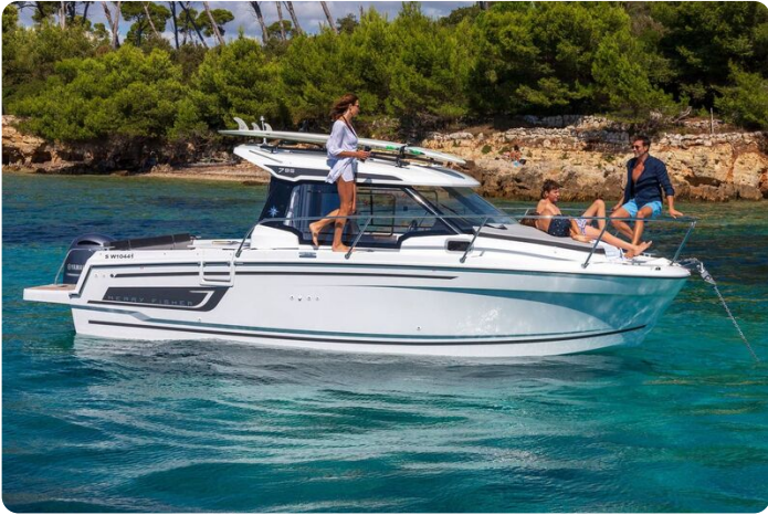
Jeanneau Merry Fisher 795 Series 2